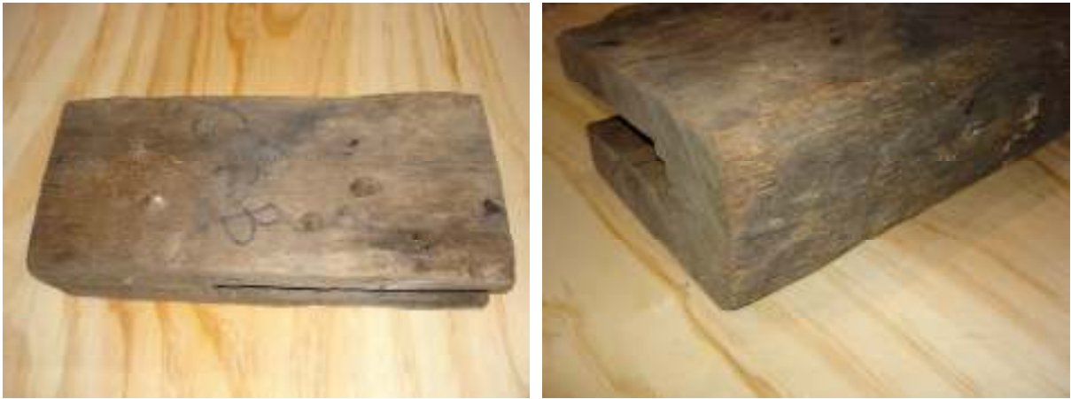
Fig 1b: Timber angg02 showing location of sample slice with III chiselled carpenters' mark