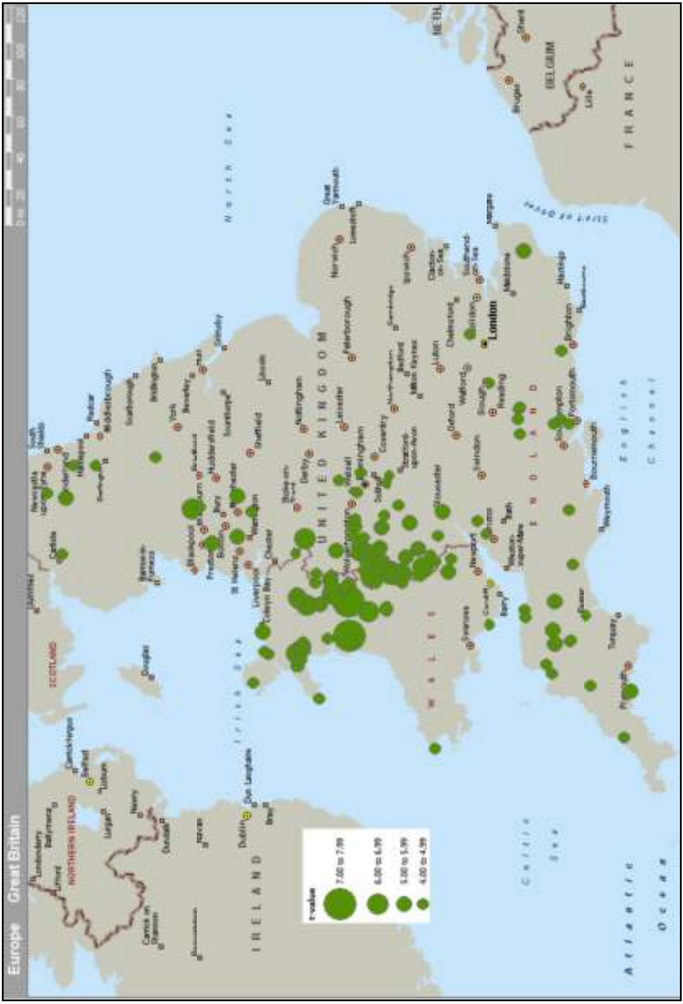
Fig 3: Map of the distribution of site chronology ANGG against independent dated reference sites

A report commissioned by The North West Wales Dendrochronology Project in partnership with The Royal Commission on the Ancient and Historical Monuments in Wales (RCAHMW).