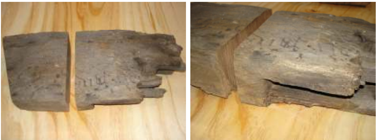
Fig 1c: Timber angg03 showing location of sample slice