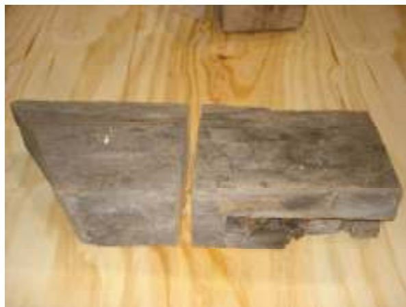
Fig 1d: Timber angg04 showing location of sample slice