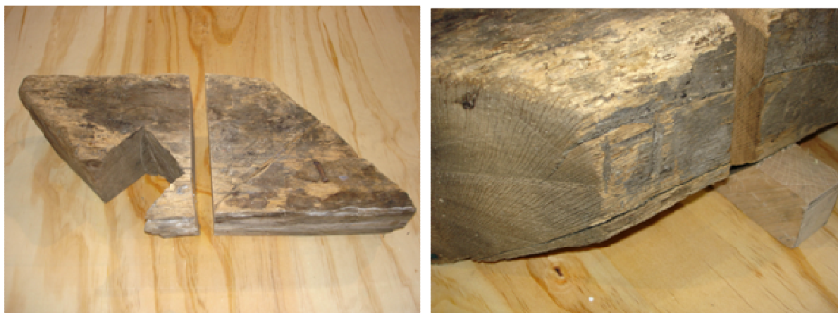
Fig 1a: Timber angg01 showing location of sample slice with II chiselled carpenters' mark

Five ex situ timbers were supplied by David Longley (Gwynedd Archaeological Trust) in October 2010. No plans were available for their original location within the building, which was thought to consist of two detached ranges, one behind the other, of different ages. One of the ranges was assessed in January 2010 and at least one truss was still in situ from which samples with good dating potential could be taken, should it not be possible to reconcile these results. All the samples were of oak ( Quercus spp.). They were numbered using the prefix angg . The samples were removed for further preparation and analysis. Radial sections were cut from the timbers and then these were polished using progressively finer grits down to 1000 to allow the measurement of ring-widths to the nearest 0.01 mm. The samples were measured under a binocular microscope on a purpose-built moving stage with a linear transducer, attached to a desktop computer. Measurements and subsequent analysis were carried out using DENDRO for WINDOWS, written by Ian Tyers (Tyers 2004).