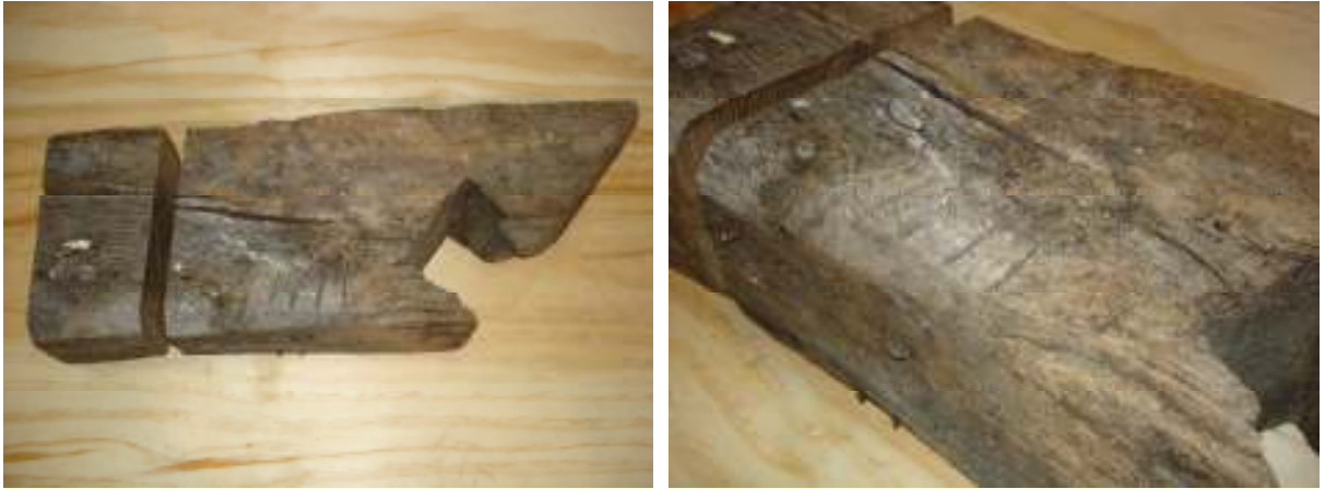
Fig 1e: Timber angg05 showing location of sample slice with IIII chiselled carpenters' mark