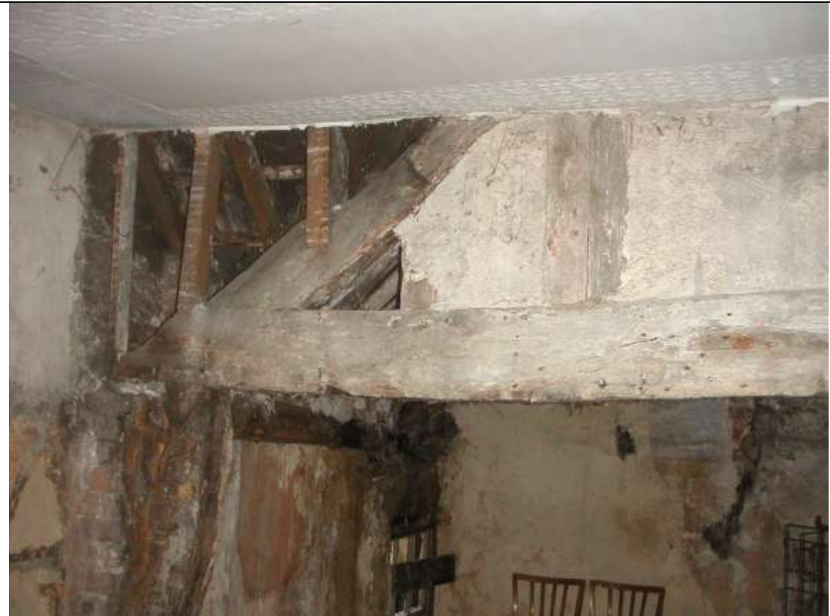
Plate 2 upper floor of No.18, south end of truss at centre of house