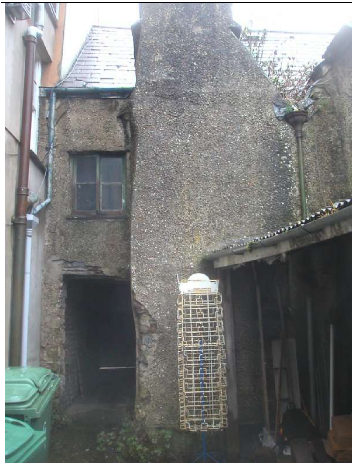
Plate 7 rear of No.16a