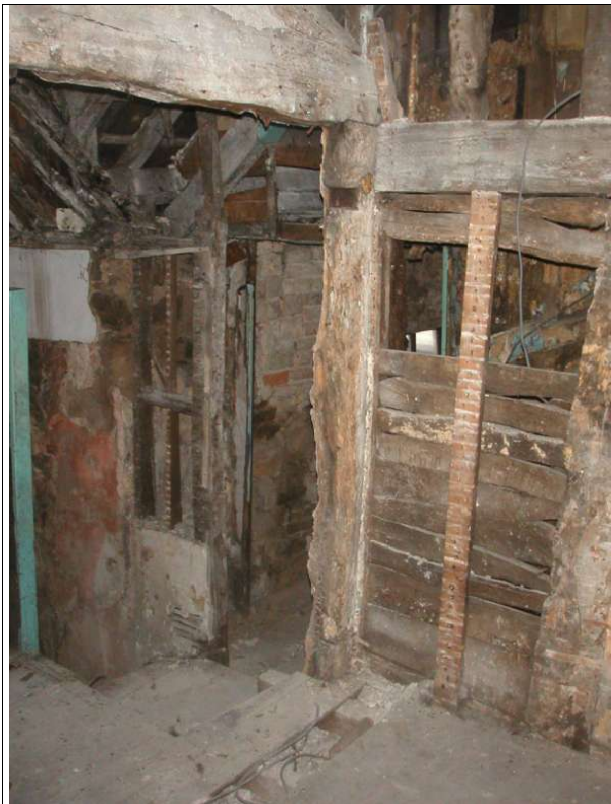
Plate 1 upper floor of No.18, looking into No.16a