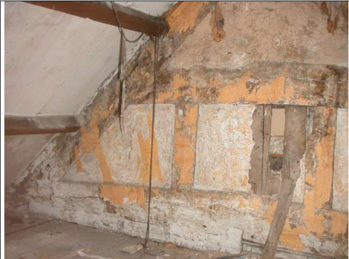
Plate 4 attic floor of No.16a, truss in north wall (rear)