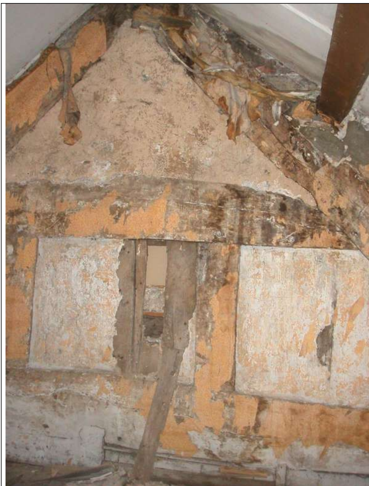
Plate 6 attic floor of No.16a, truss in north wall (centre)