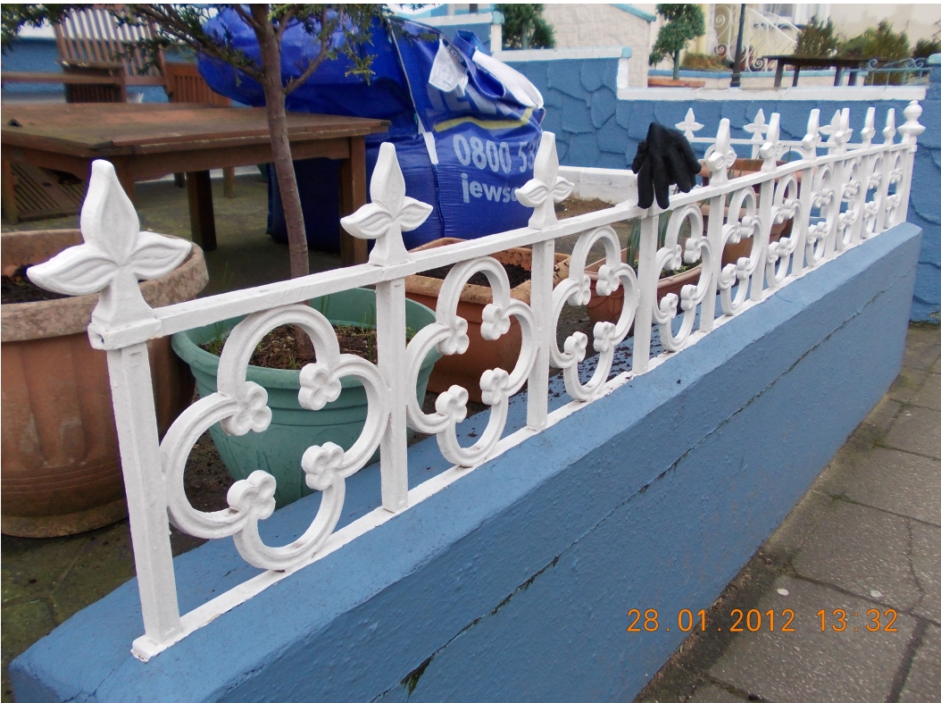
12 Deer Park