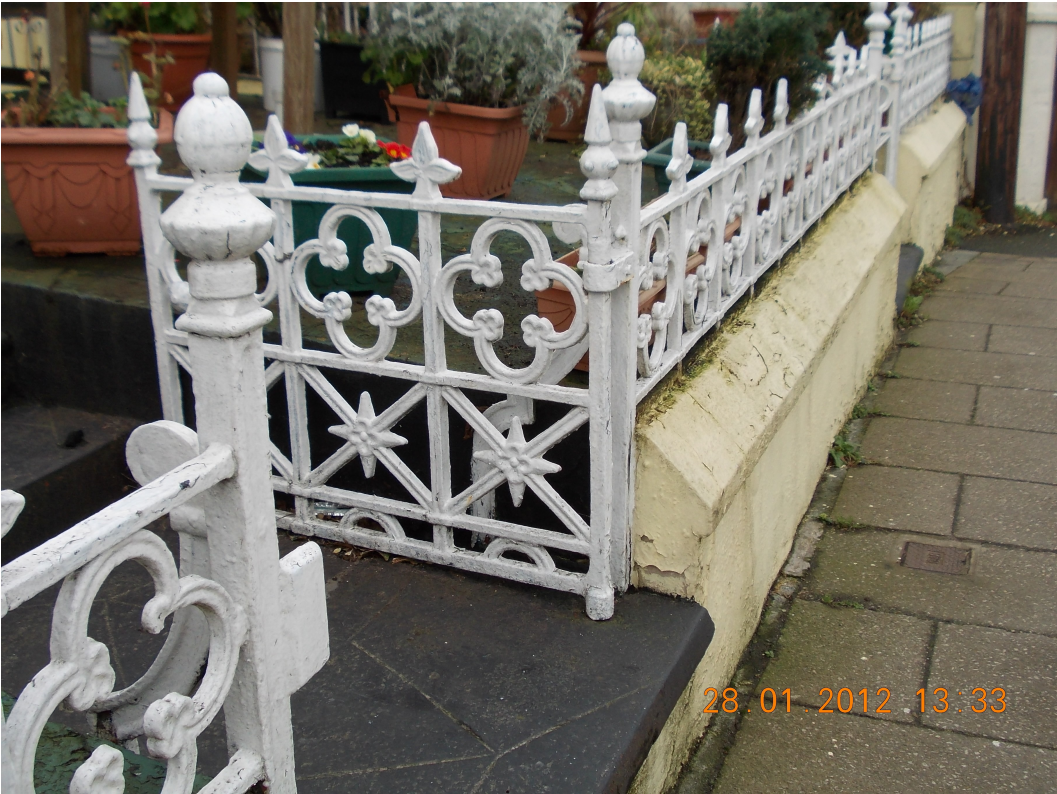
14 Deer Park (second identical gate also intact)