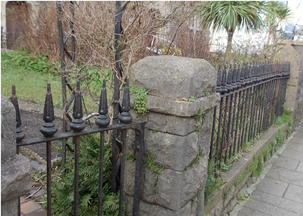
Walmer House, Deer Park

Greenhill, Deer Park, Greenhill Avenue, Harding Street