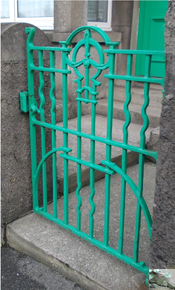
Downview, Hillgrove, Braeside and Ilex Grove, Greenhill Road