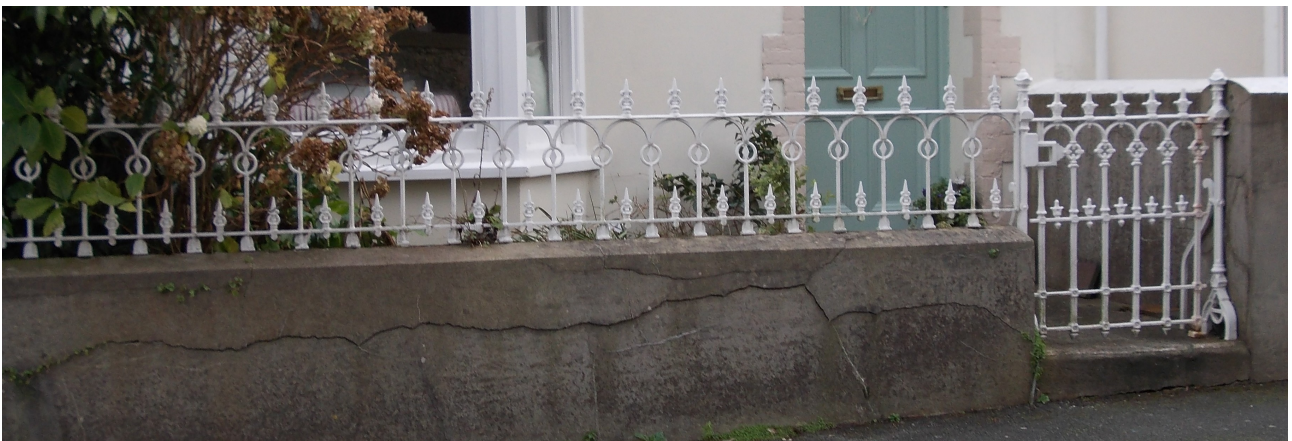
Nos 3, 7 and 8 Greenhill Avenue.