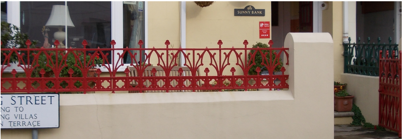
Sunny Bank and Ivy Bank, Harding Street.