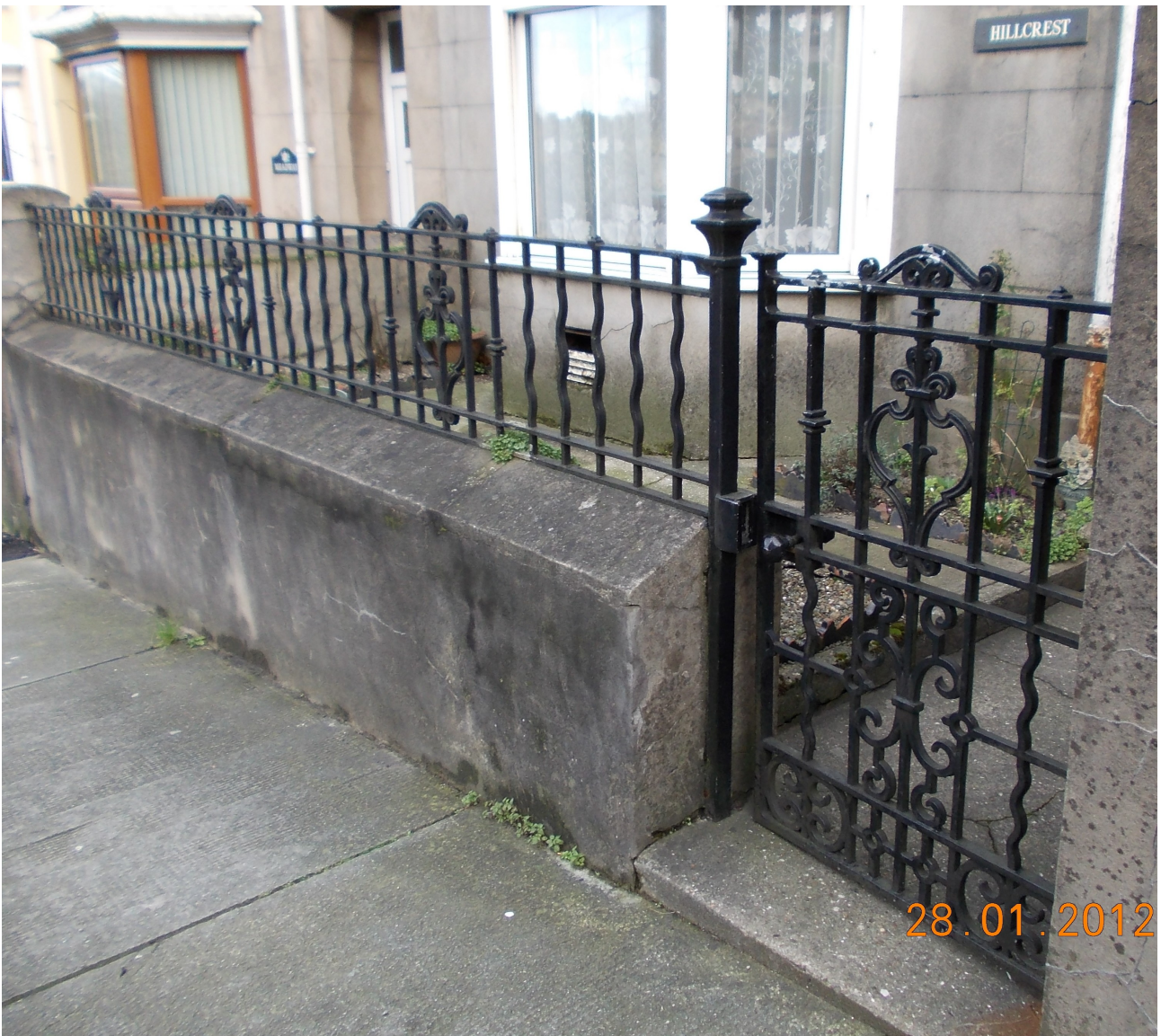
Oakdene, Rockleigh, Jesmond, Fairfield, Hillcrest (example illustrated), Meadway and Trefgarne, Greenhill. (Identical railings, all with gates and in good condition) 28 January 2012