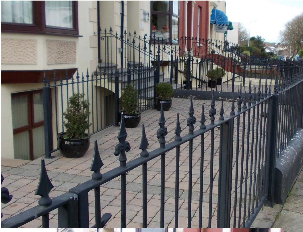
Modern railings at 1 and 2 Deer Park Villas