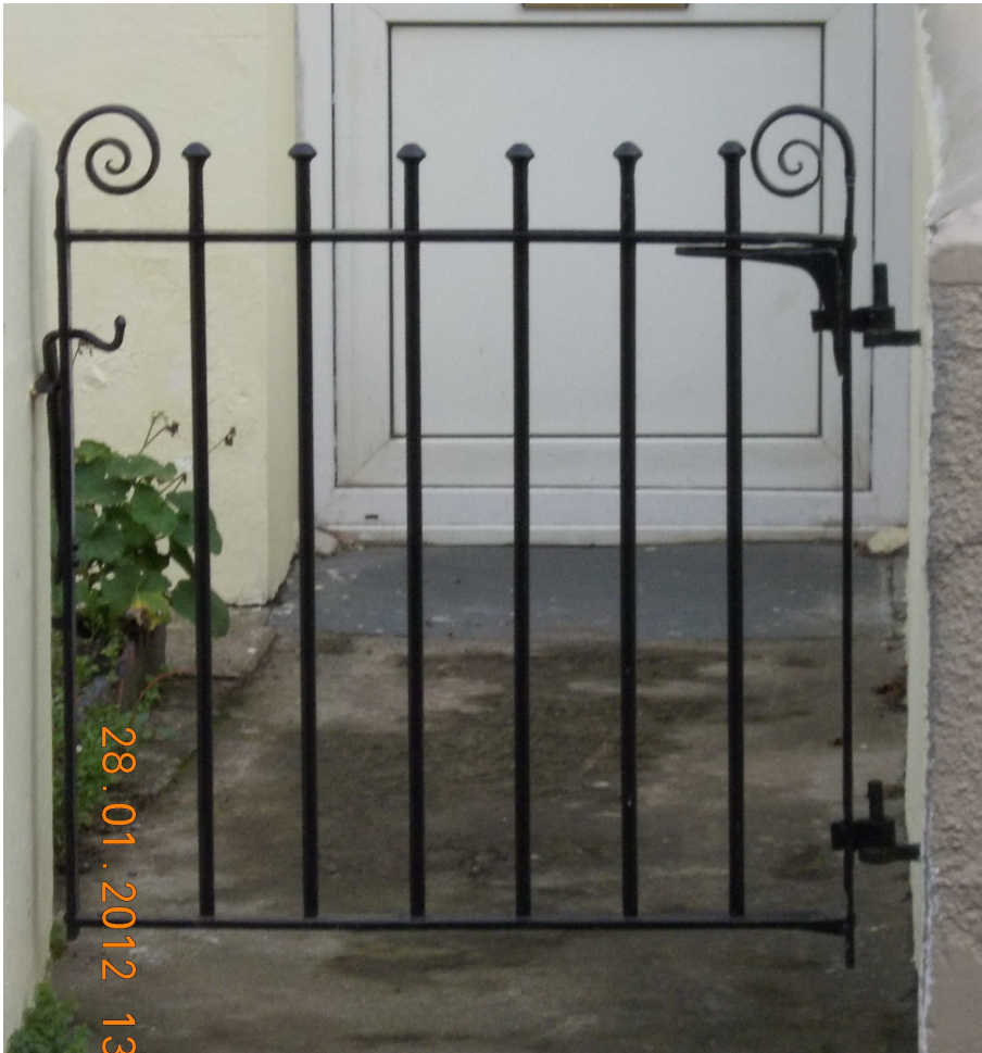
5 Deer Park (gate, no matching railings)