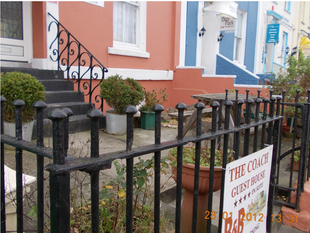
11 Deer Park