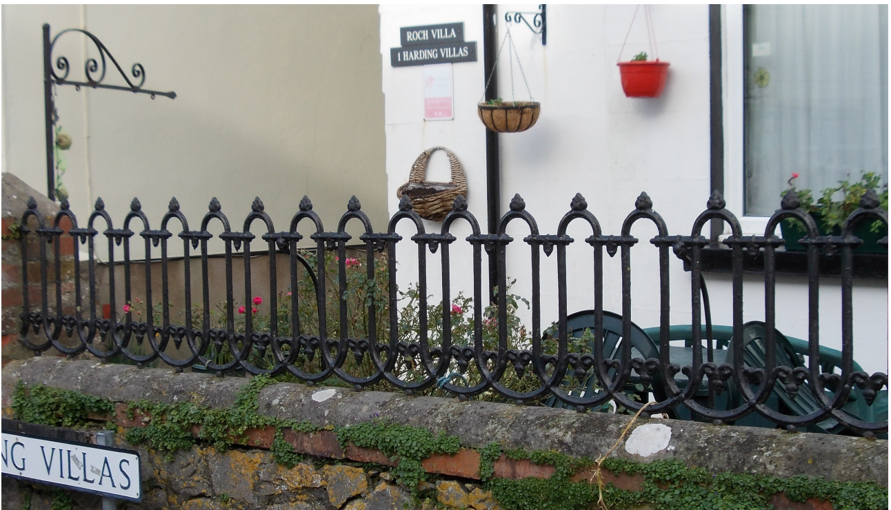
1 to 8 Harding Villas, plus Weston Lodge, Harding Street. (All same railings but no original gates)