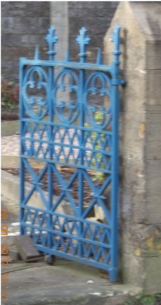
Baptist Chapel, Deer Park.