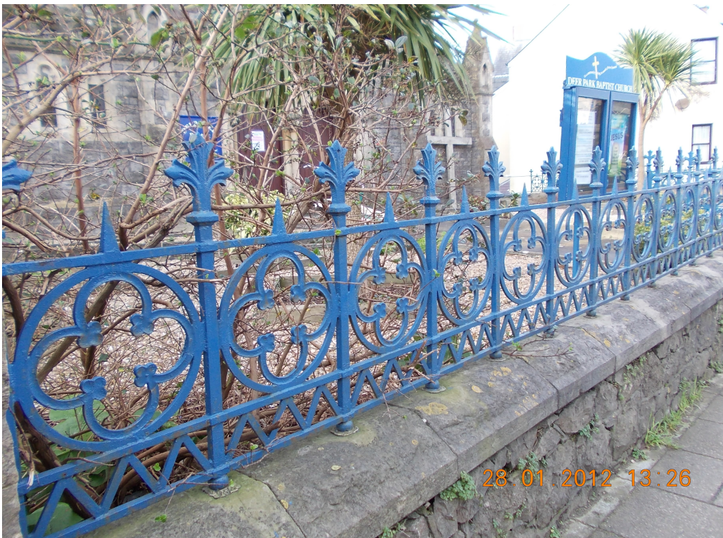
Baptist Chapel, Deer Park