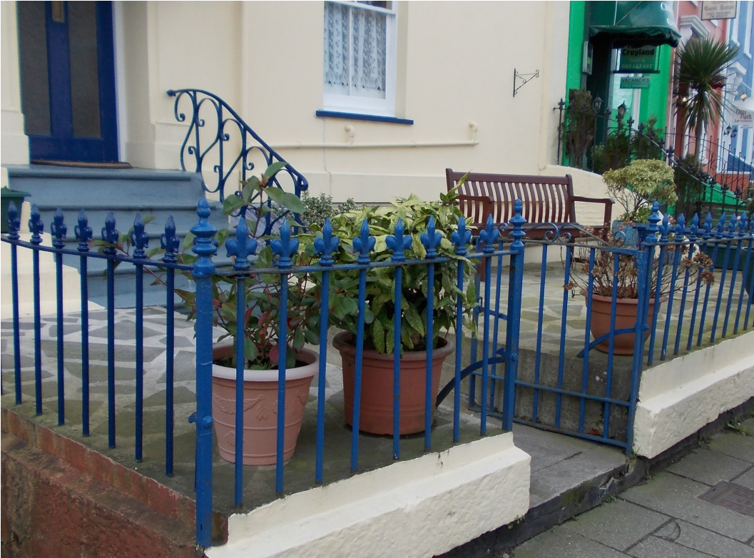
9 and 10 Deer Park