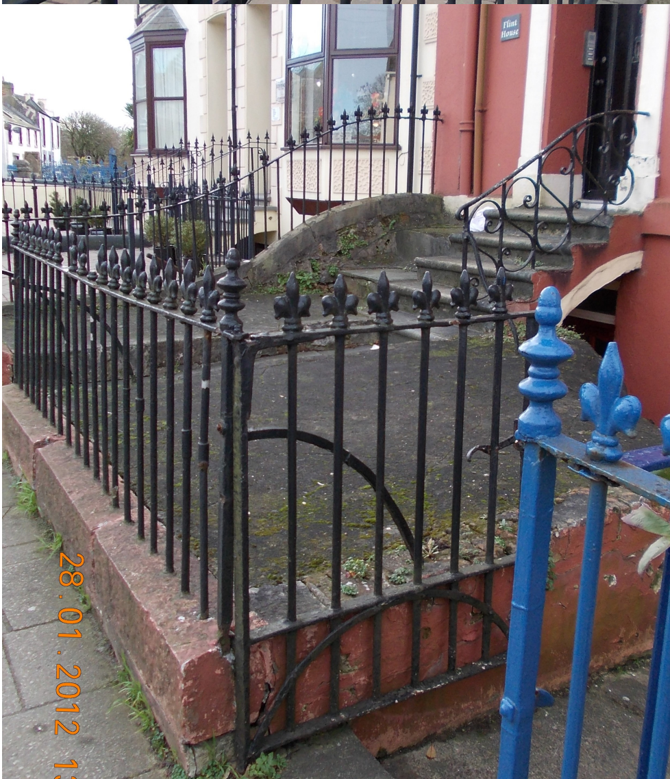
Flint House, 8 Deer Park