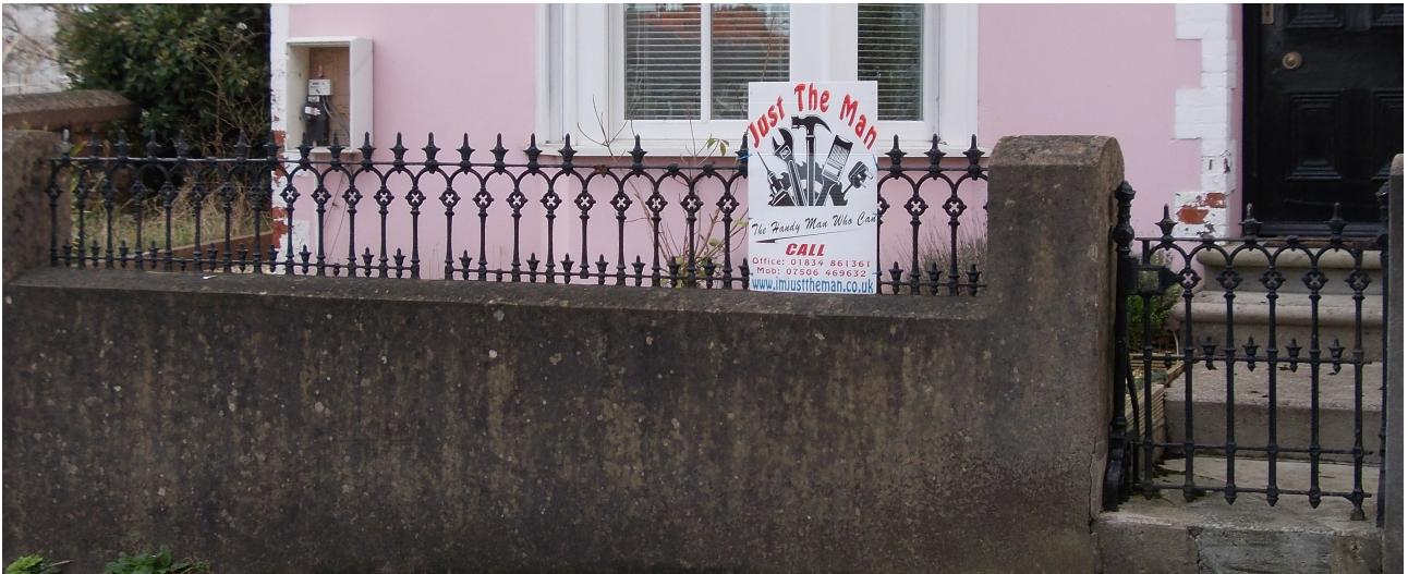
Nos 1, 4, 5, 6, 9, 10, 11 and 12 Greenhill Avenue.