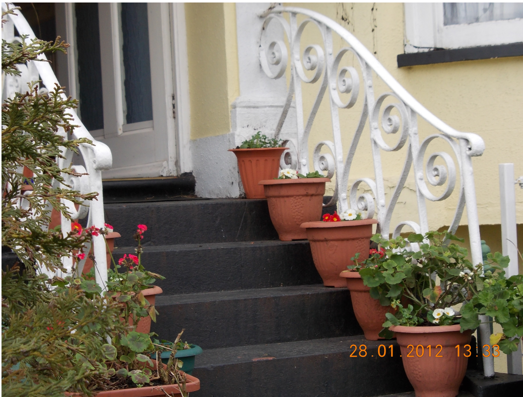
14 Deer Park

Note 13 Deer Park has lost all railings and has a modern gate.