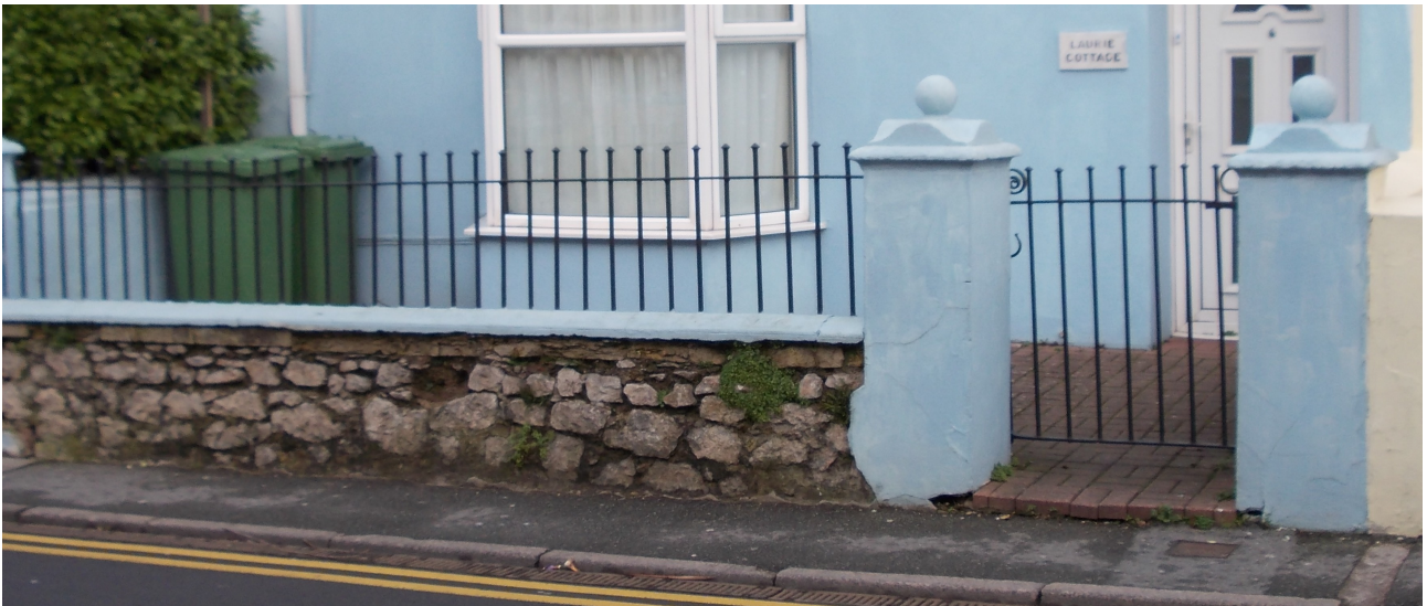
Laurie Cottage, 6 Deer Park.