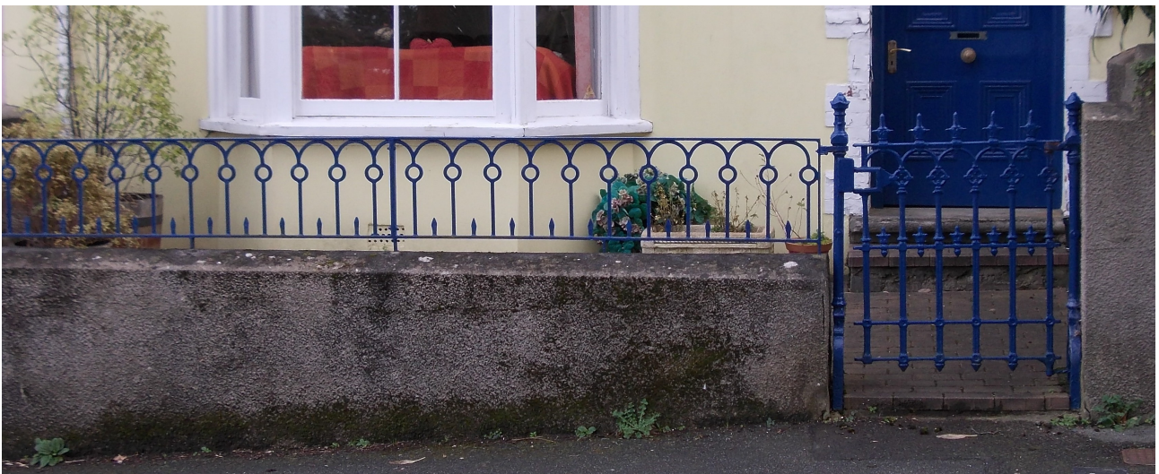
No2 Greenhill Avenue