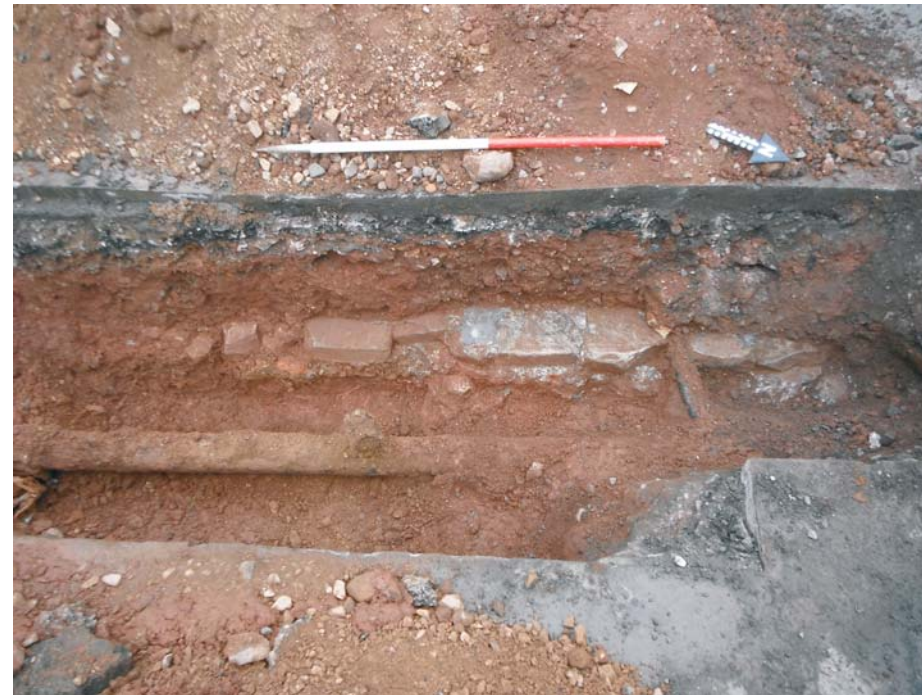
Trench 7, looking south-west (scale 1m)