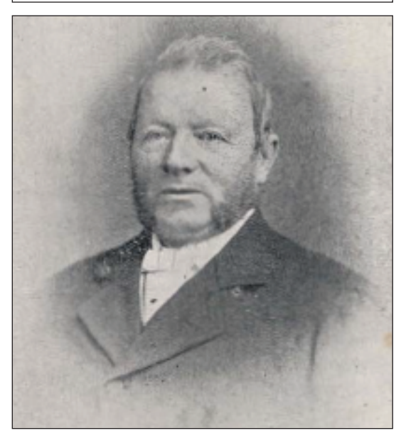
Y Parch H.W. Hughes. (Source "Braslan o Hanes Bethania Llawlyfr 1925". Document held by the Welsh Religious Buildings Trust).