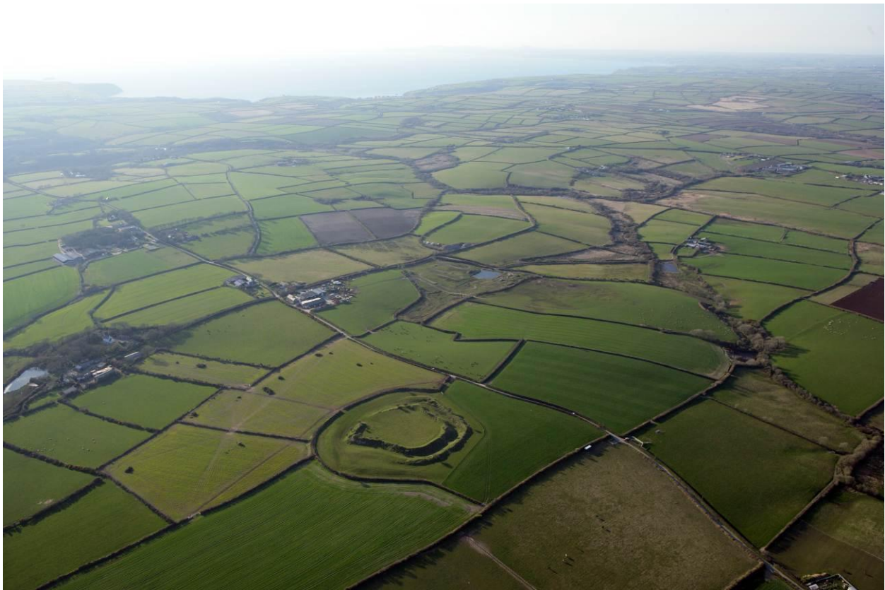
Figure 3. A landscape view of Romans Castle looking northwest

Romans Castle commands an extensive view, situated at the western end of a ridge that marks one of the highest points in the locality, some 90m above sea level (Fig 3). From the enclosure the ground falls steadily to the north, south and west, whilst to the east the ridge continues for 1.8km before dropping towards Johnston.