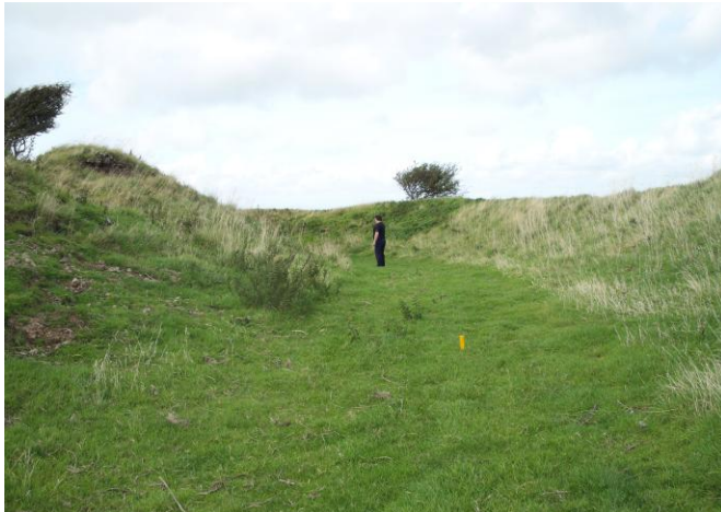
Figure 5. Looking north along the line of the inner ditch defining the eastern side of the enclosure. (Crown Copyright. RCAHMW DS2012_629_008)

The recent survey suggests that the relatively complex series of earthworks that define the interior of the monument, originally comprised a concentric double bank and ditch system, cut by a main west facing entrance, with an additional third line of defence enclosing all but the west side. However, a definitive understanding of this arrangement, based upon the surviving earthworks, is impossible due to the removal of key sections during later agricultural activity. Geophysical survey and excavation would undoubtedly provide firmer conclusions on the exact arrangement. Similarly, little exposed evidence survives as to the nature and makeup of the defences that once topped the banks. Some small loose stones were exposed from erosion scars and in a few places there are breaks/steps in the banks which may indicate the remains of walling.