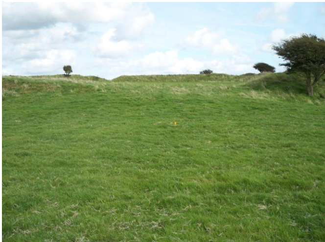
Figure 6. Looking northeast through the main entrance with a possible secondary entrance, feature b, beyond.

The inner bank and ditch are the best preserved, with the bank, in one form or other, defining the complete circuit and the ditch some 5m wide, traceable on all but the west side (fig 5). The bank is some 11m wide and stands around 4.2m high from the base of the ditch and 1.7m from the interior. A 50m section of the western line of the bank has been levelled and survives as a west facing scarp 2m high. The levelling was presumably a result of the later agricultural activity, to provide access and more land for cultivation within the forts interior.