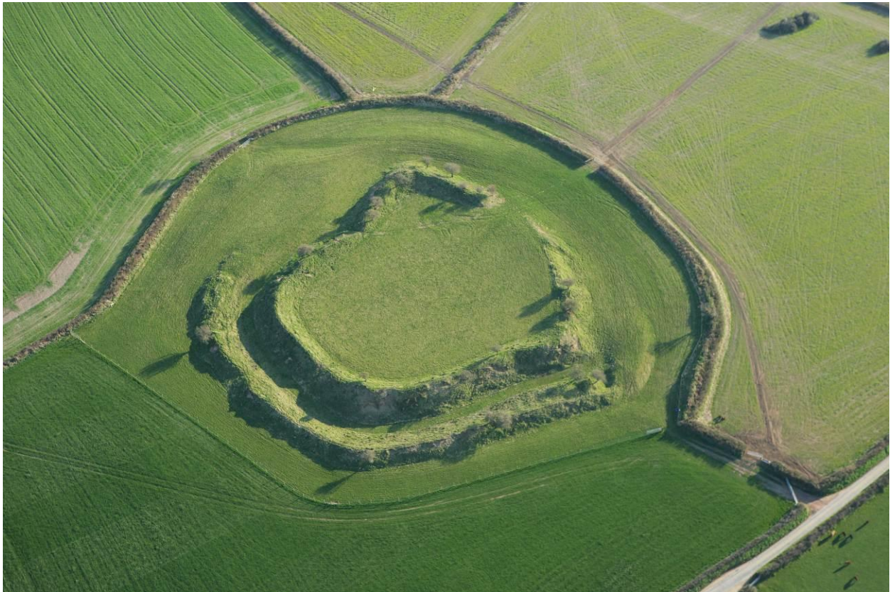
Figure 1. Aerial view of Romans Castle in 2010, looking southwest

During March 2010 the Royal Commission on the Ancient and Historical Monuments of Wales and the Walwyn's Castle Local History Society carried out an archaeological survey of Romans Castle, an Iron Age defended enclosure situated within the parish of Walwyn's Castle in Pembrokeshire (NPRN 305343; SM 8951 1058). The survey was both timely and of help to Cadw as the earthworks of this scheduled monument (PE 188) had recently been uncovered for the first time in many years following the removal of a dense covering of gorse and blackthorn to aid the conservation and management of the monument (Fig 1).