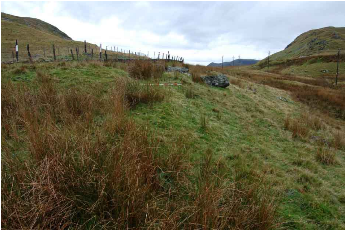
Plate 90 Site 30 Pre-turnpike road