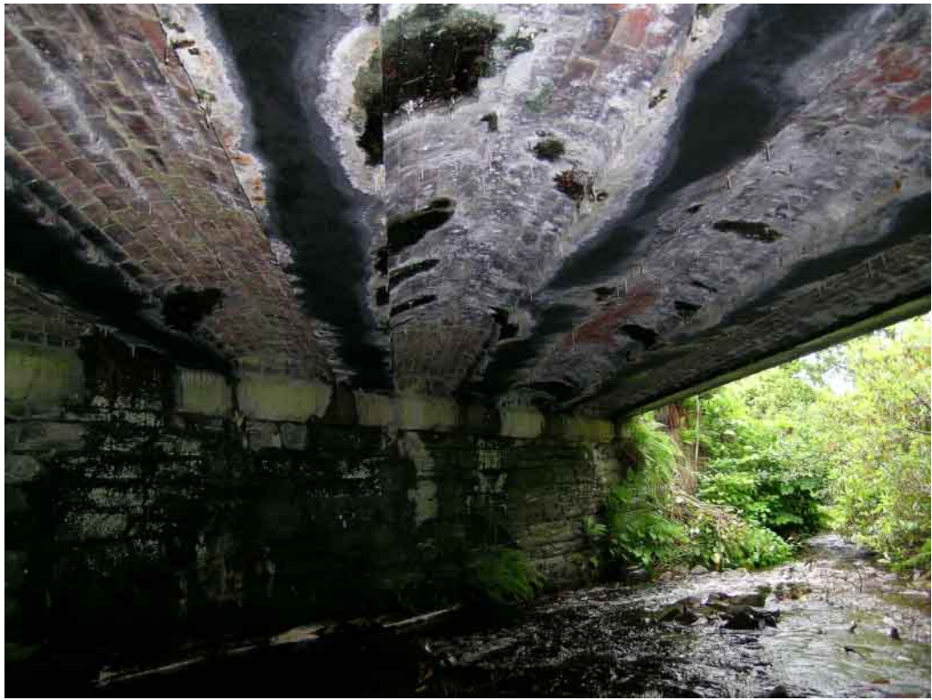
Plate 23 Bridge 68, underside