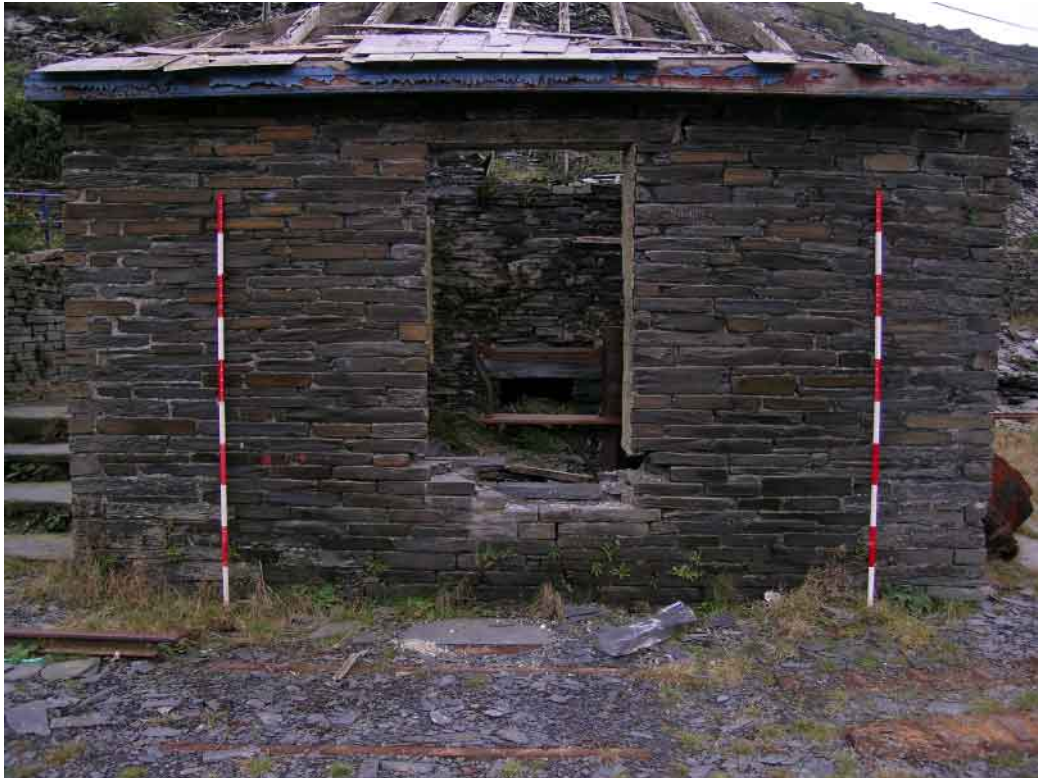
Plate 43 Site 3(11) Weighbridge house