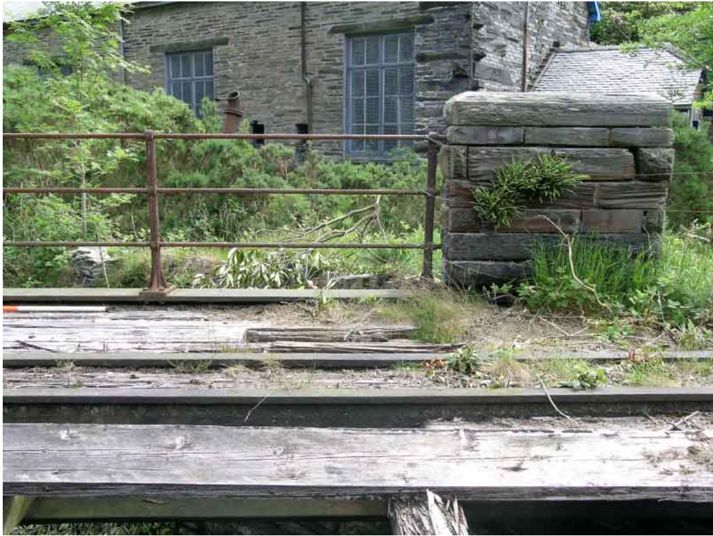
Plate 17 Bridge 67, parapet turret and railings E side, W facing