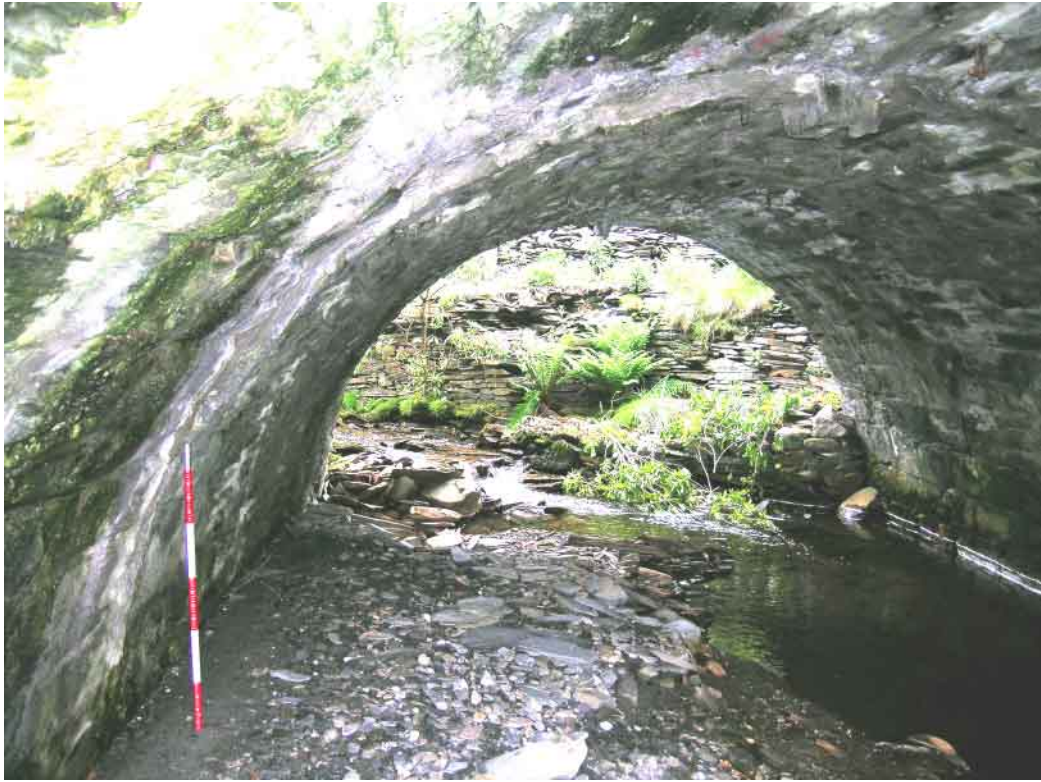
Plate 37 Afon Barlwyd tunnel, two phases of masonry within roof