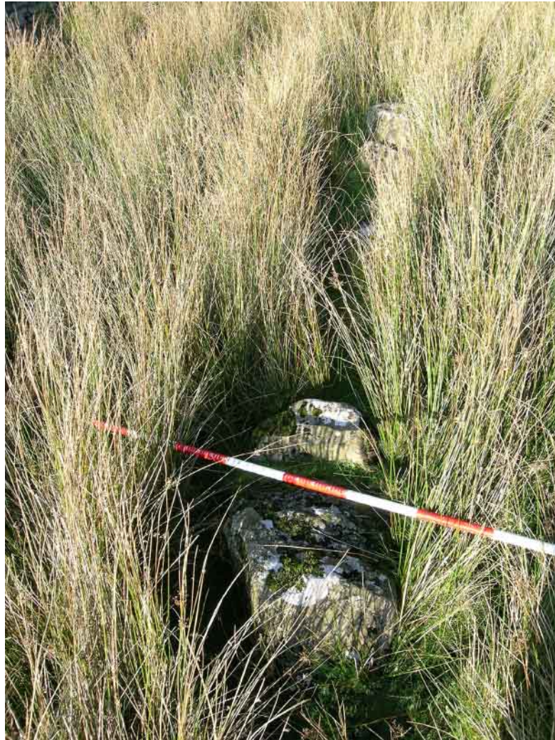
Plate 69 Site 21 Remains of dry-stone wall