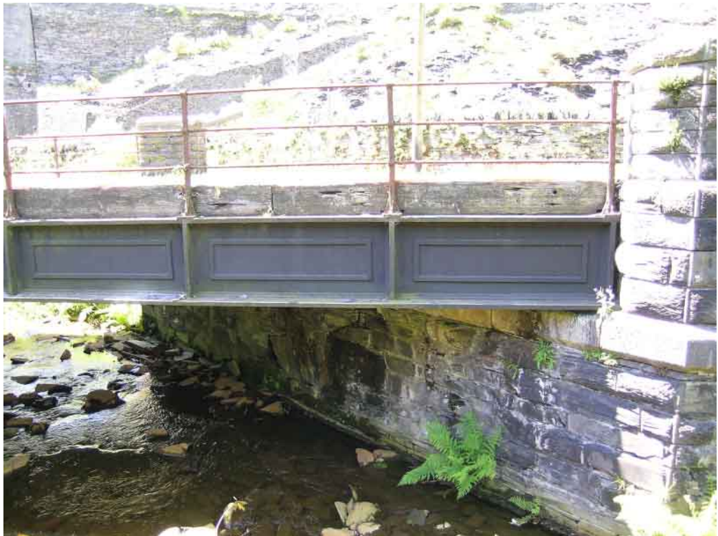
Plate 22 Bridge 68, girder panel E side