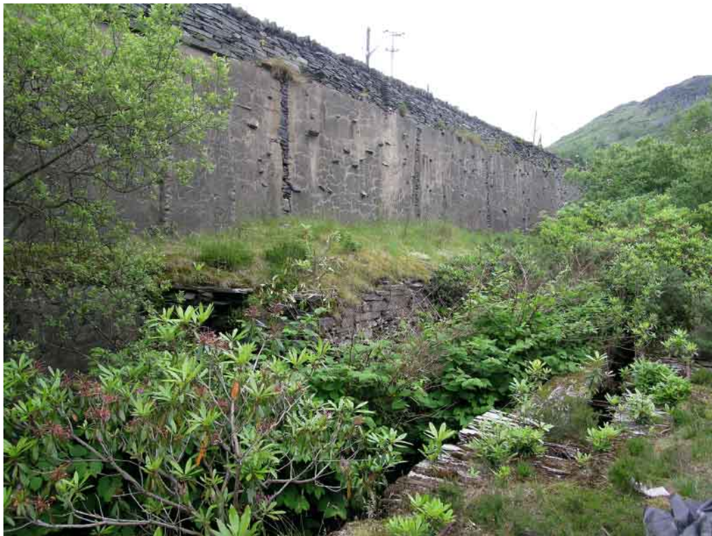
Plate 28 Road embankment, E side