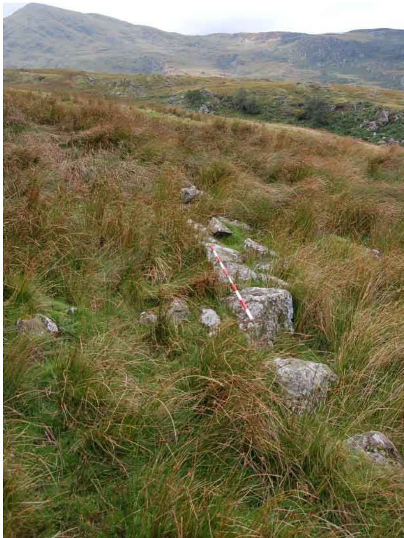
Plate 80 Site 41 Field wall/bank