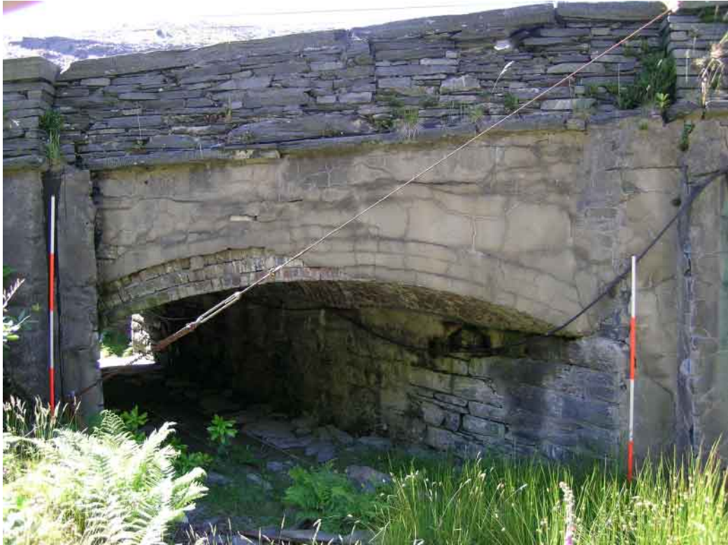
Plate 39 Llechwedd / sidings link tunnel, E side