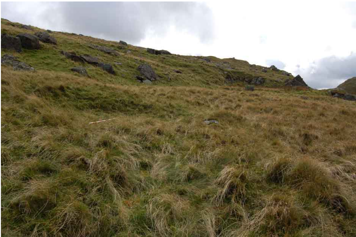
Plate 86 Site 61 Pre-turnpike road quarry pit