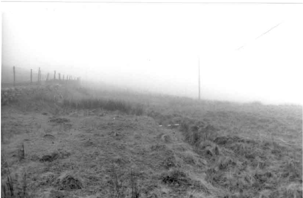
Plate 5 Site 33a Embanked curvilinear enclosure in 1992