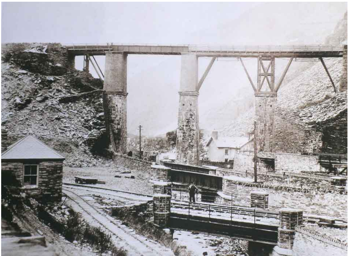
Plate 24 Bridge 68, by Bleasdale 1879