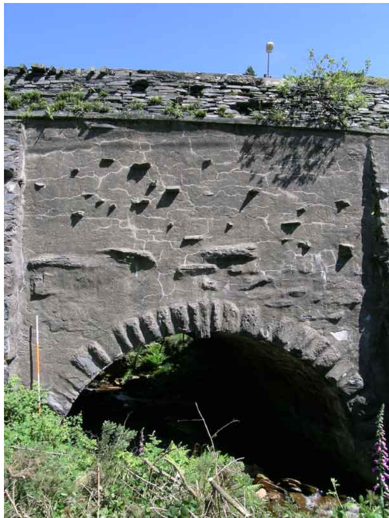
Plate 38 Afon Barlwyd tunnel, W side