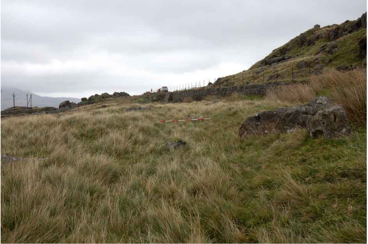
Plate 89 Site 37 Pre-turnpike road