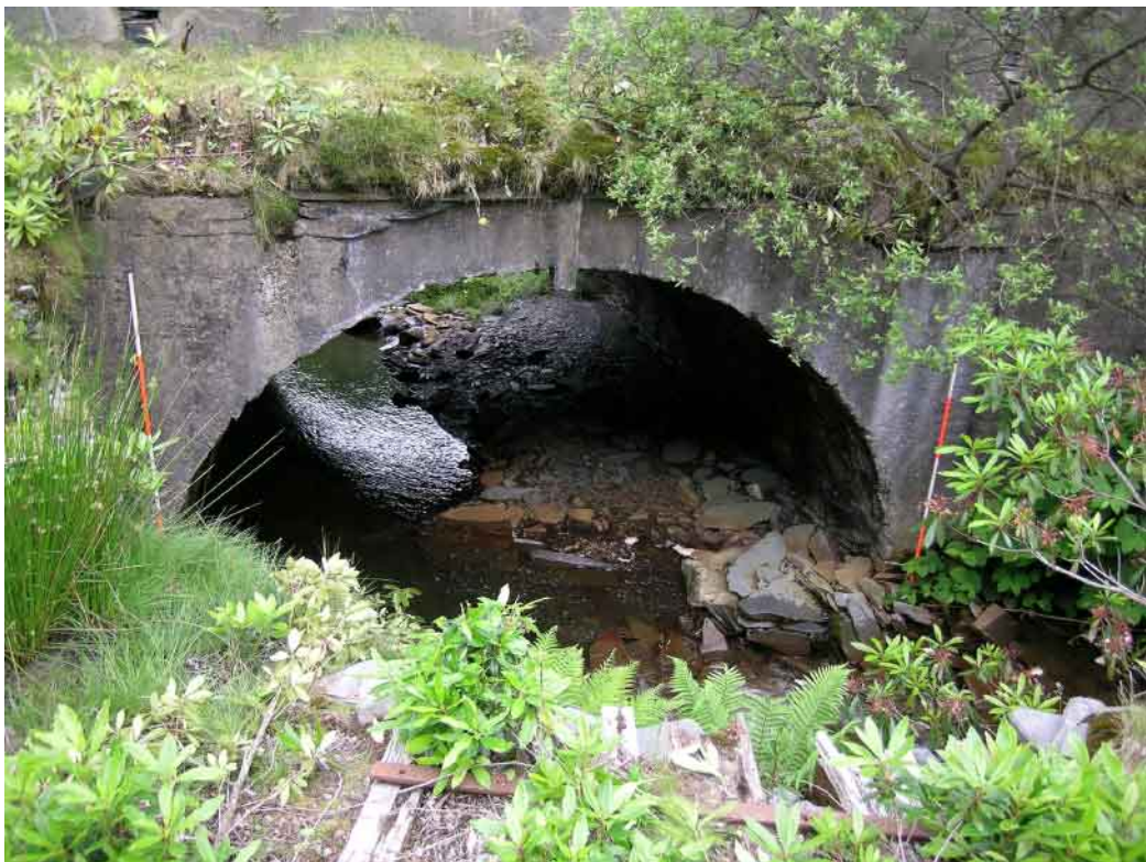
Plate 36 Afon Barlwyd tunnel, E side