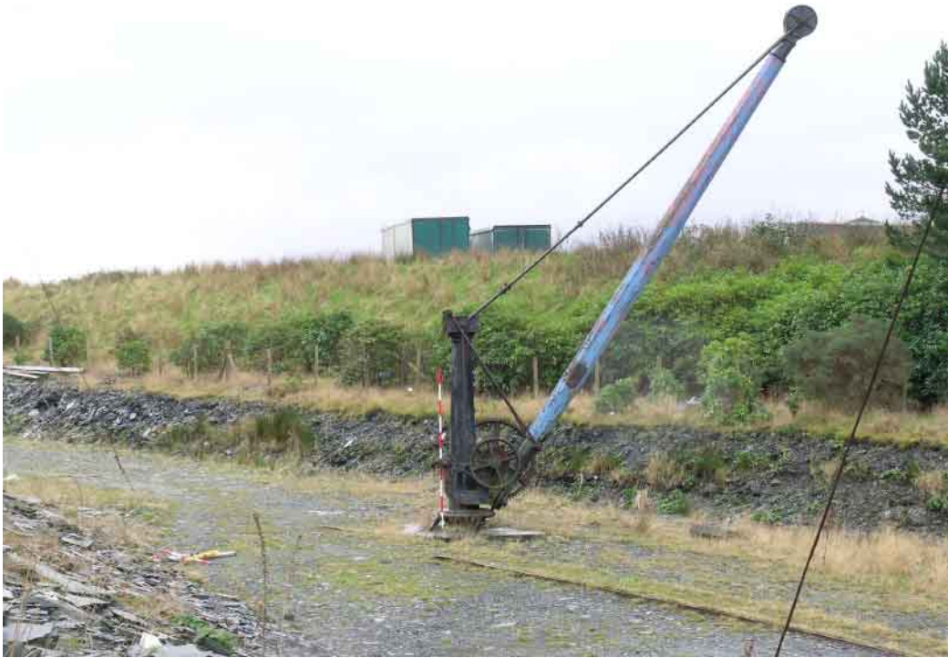
Plate 13 Site 3(13) Crane