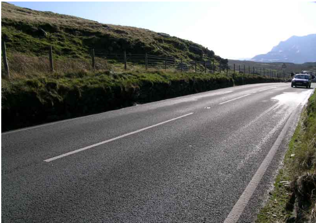
Plate 72 Site 24 Small roadside quarries