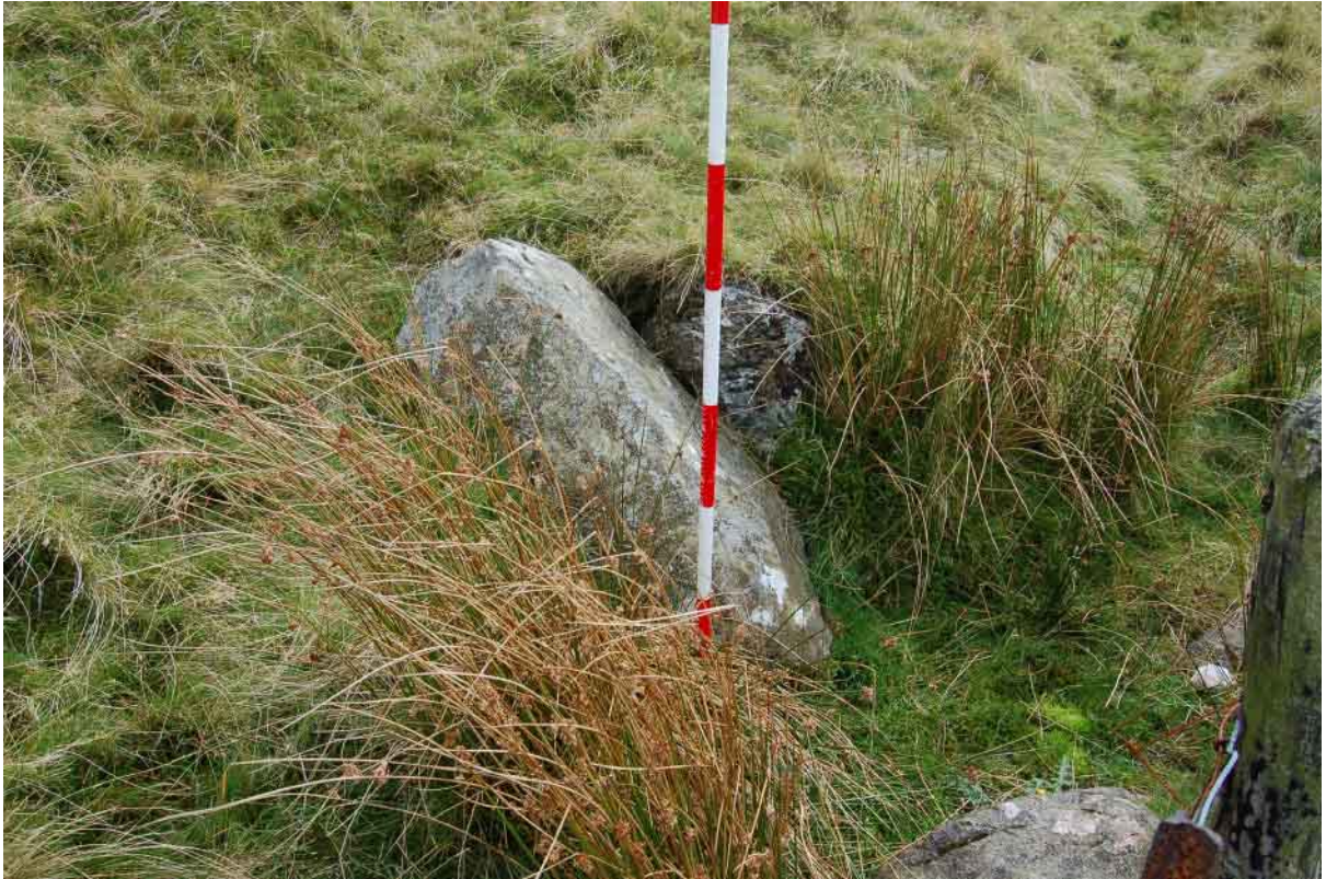
Plate 83 Site 62 St Mihangel's stone and well