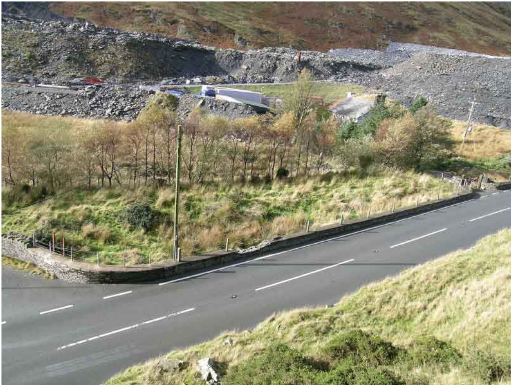
Plate 59 Site 12 Tip south of Bryntirion