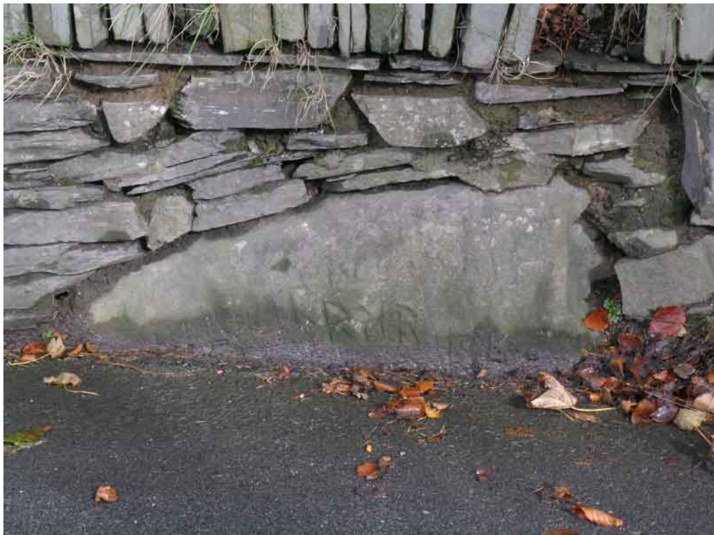
Plate 56 Site 9 Graffiti stones