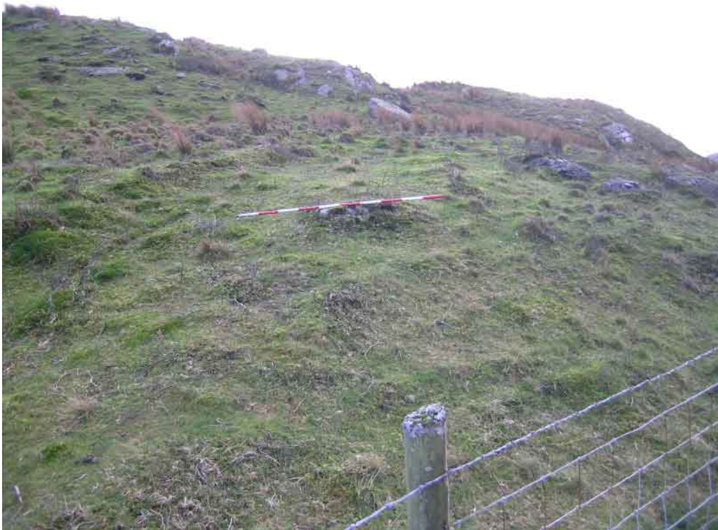
Plate 93 Site 26c Pre-turnpike road