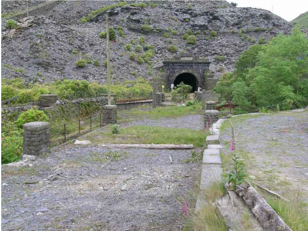
Plate 21 Bridge 68, general view