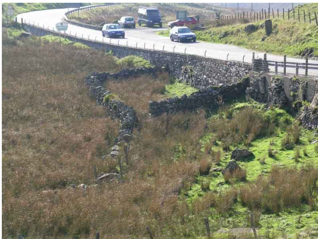
Plate 70 Site 22 Rectangular enclosure