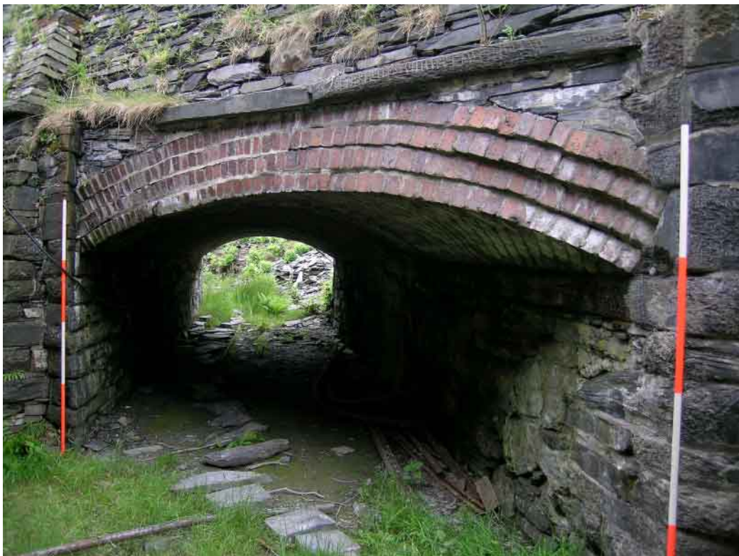
Plate 40 Llechwedd / sidings link tunnel, W side