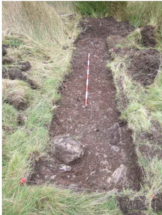
Plate 2 Site 17 Sub-rectangular scoop, excavation trench