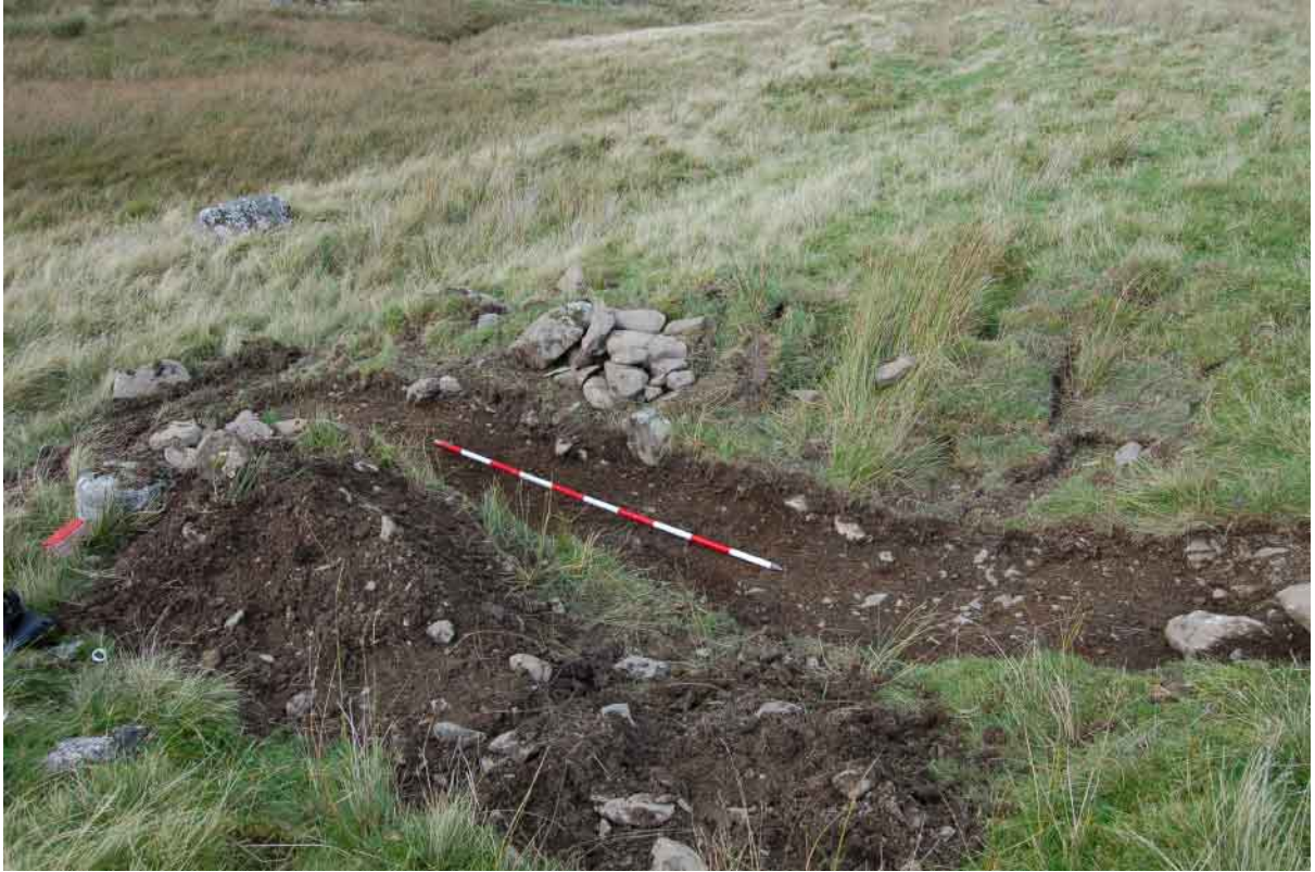
Plate 11 Site 39 a Settlement, excavation trench