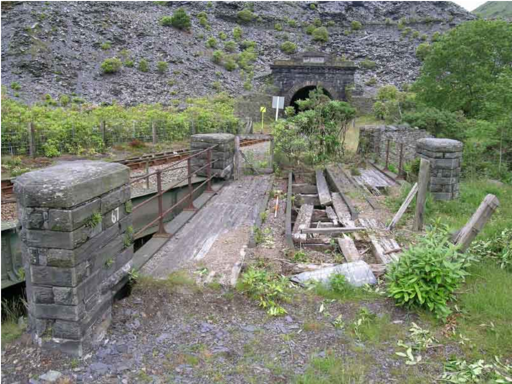
Plate 15 Bridge 67, general view