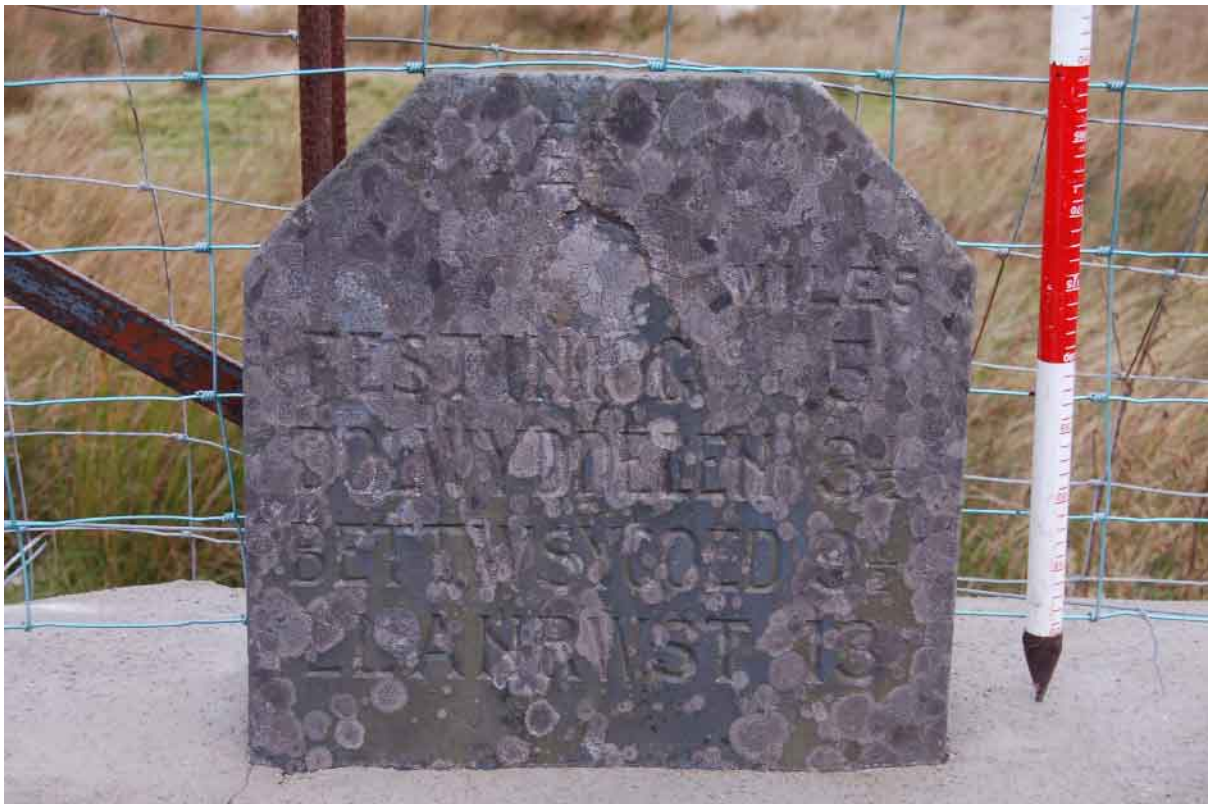
Plate 76 Site 32 Slate turnpike milestone