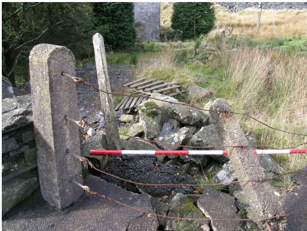
Plate 60 Site 13 Dry-stone field boundary, Bryntirion