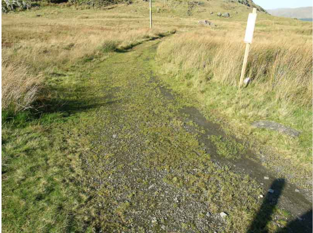
Plate 73 Site 28 Trackway to Chwarel Gethin