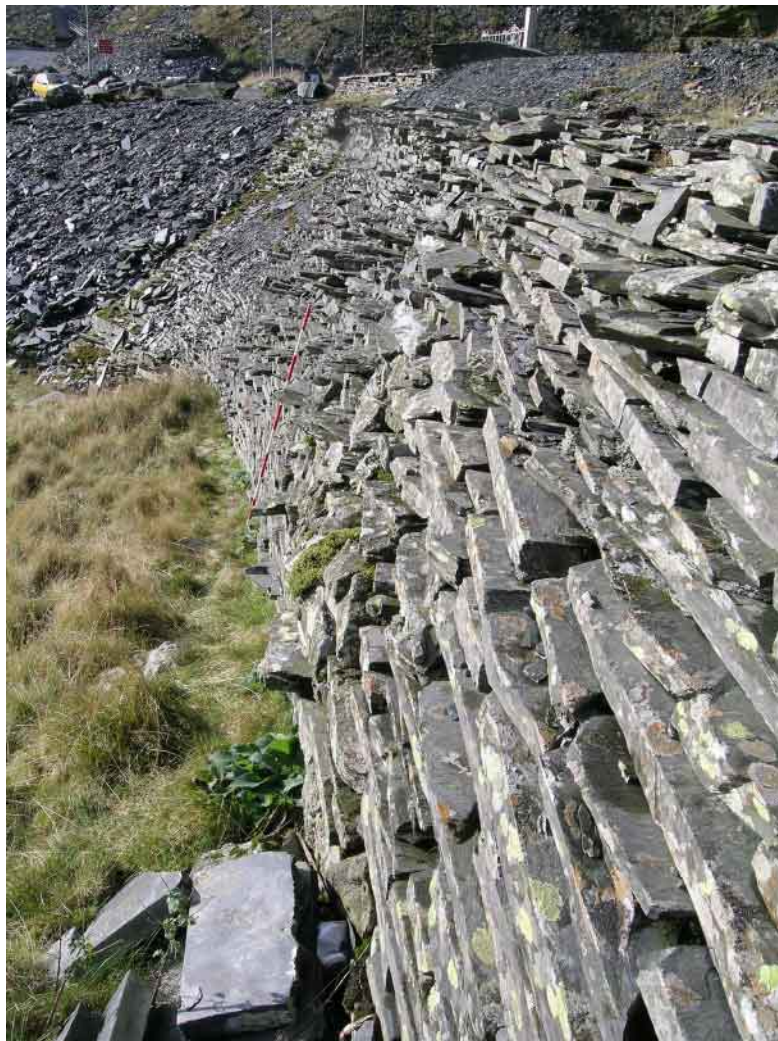
Plate 58 Site 11 Retaining wall, entrance to Oakeley complex