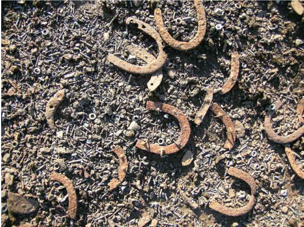
Plate 67 Site 20 Esgidiau Meirw, detail