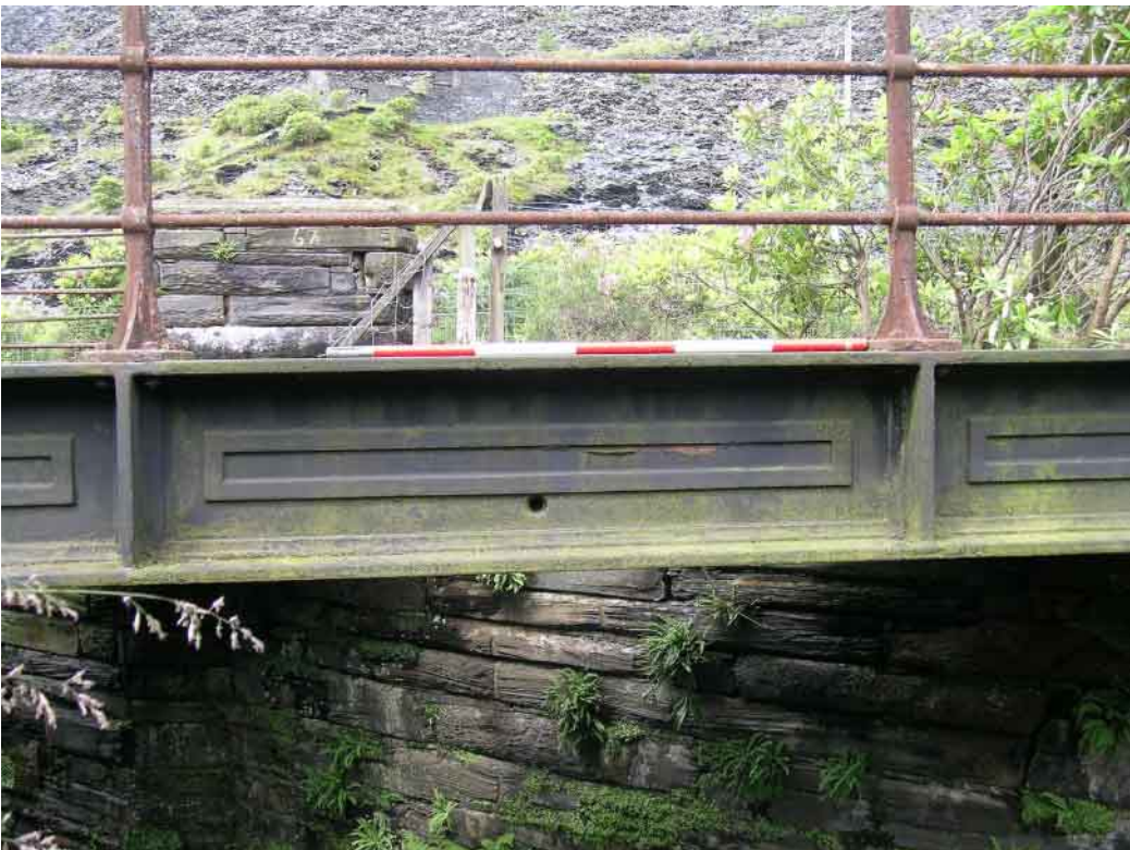
Plate 16 Bridge 67, girder panel E side