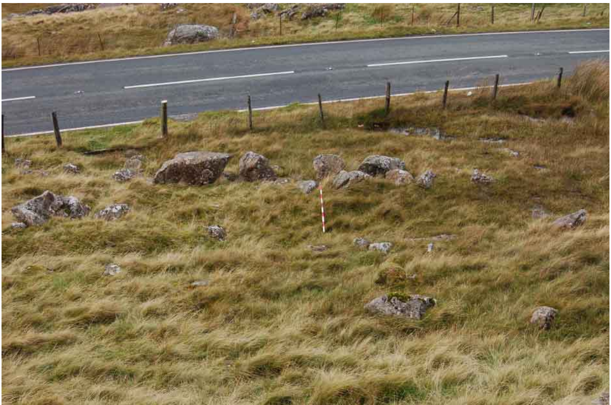
Plate 88 Site 35 Pre-turnpike road, boulder edging