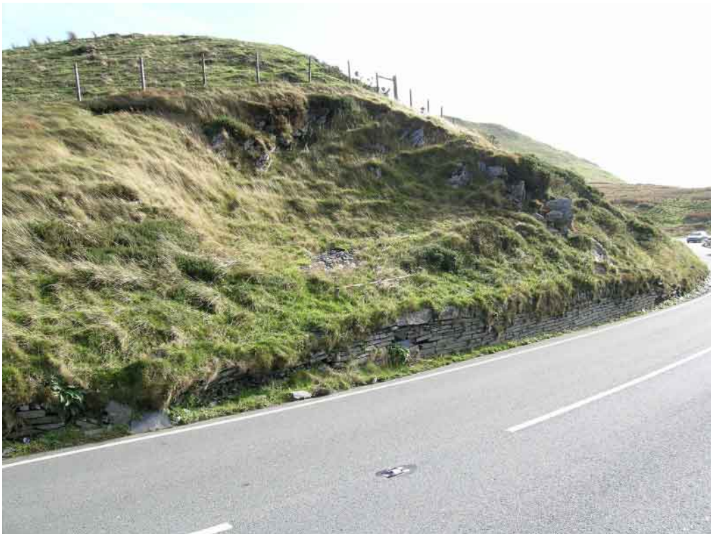
Plate 64 Site 18 Small quarry