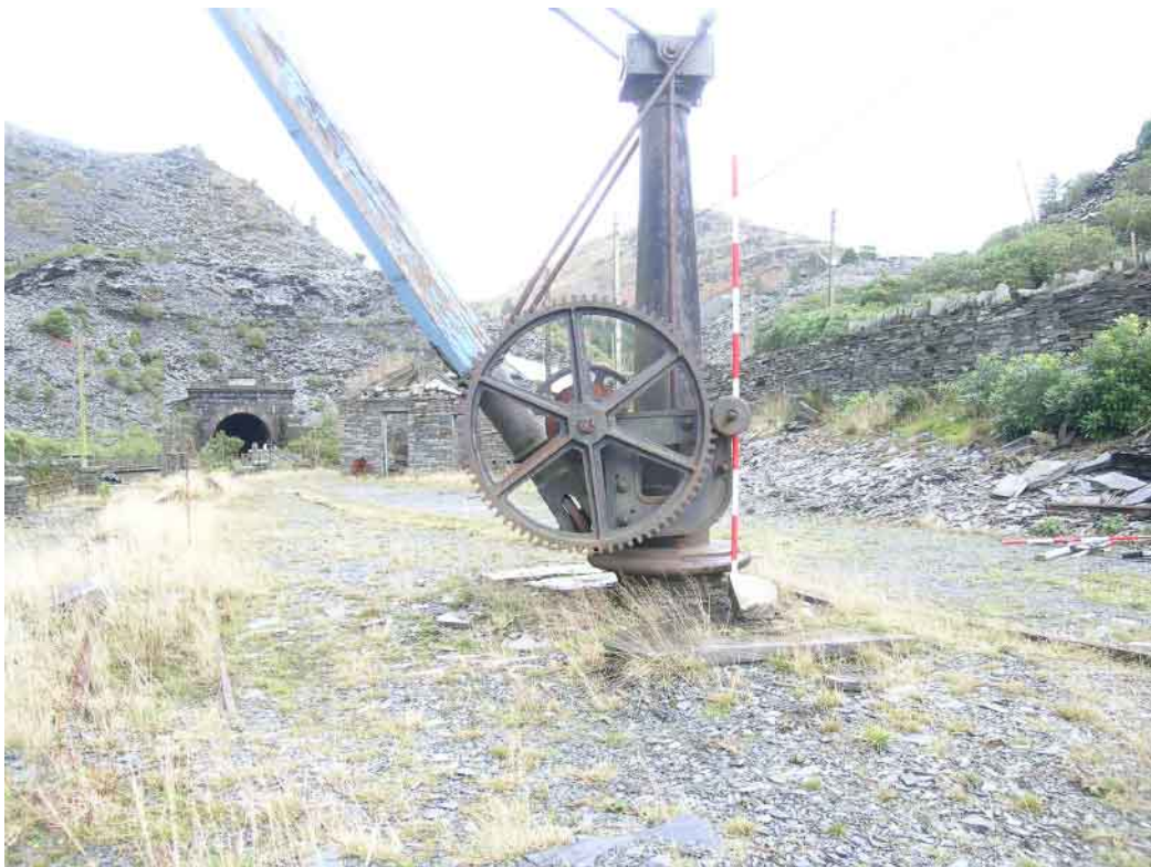
Plate 14 Site 3(13) Crane