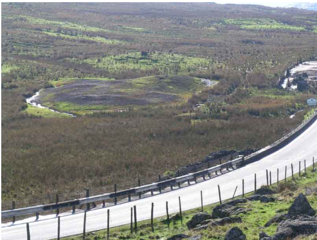
Plate 66 Site 20 Esgidiau Meirw