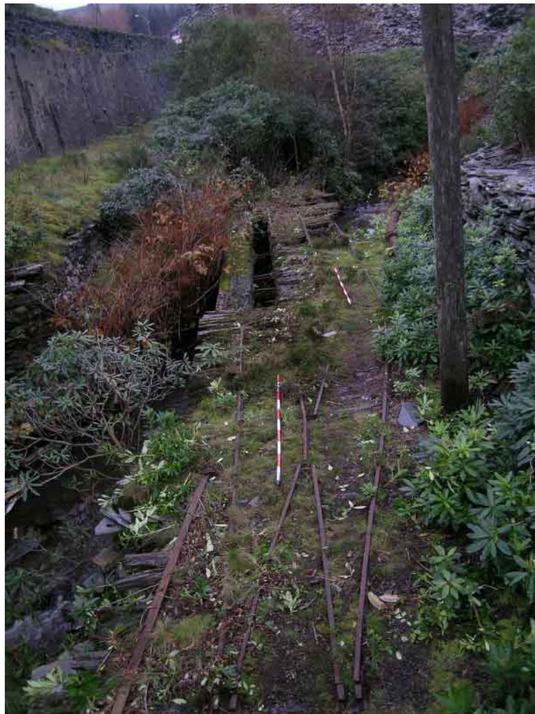
Plate 42 Site 3(4) Railway bridge