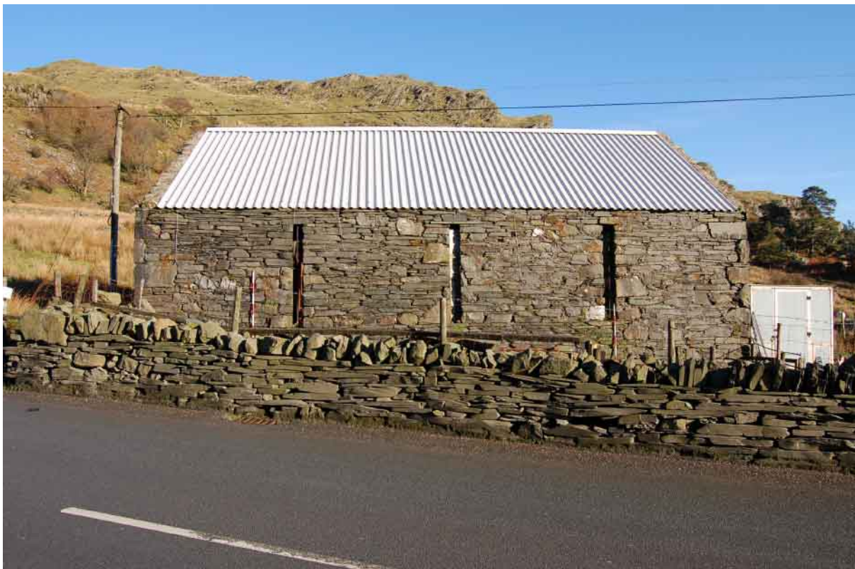
Plate 44 Site 10 Field barn Tal-y-Waenydd