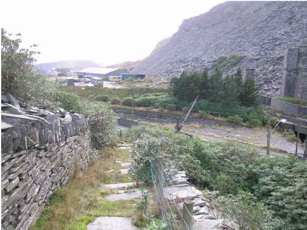
Plate 48 Site 4 Footpath