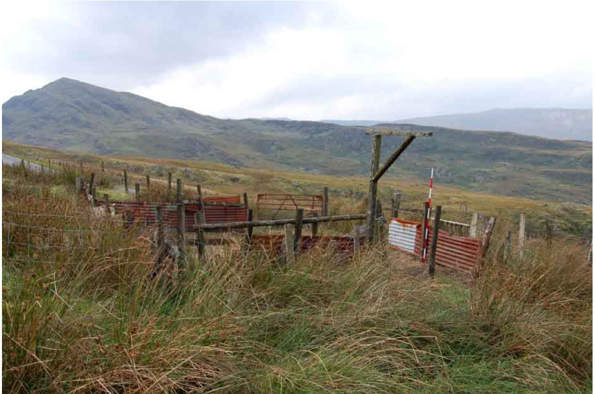
Plate 79 Site 40 Sheepfold