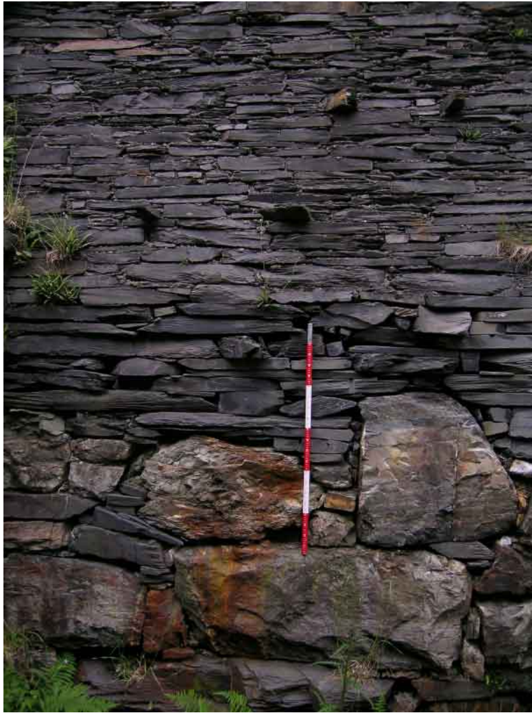
Plate 29 Masonry styles; mixed stone below, slate above