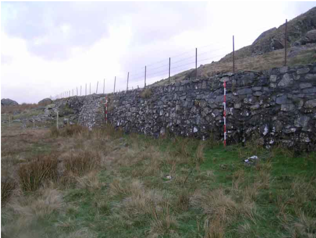
Plate 50 Site 5 Road revetment Crimea Road