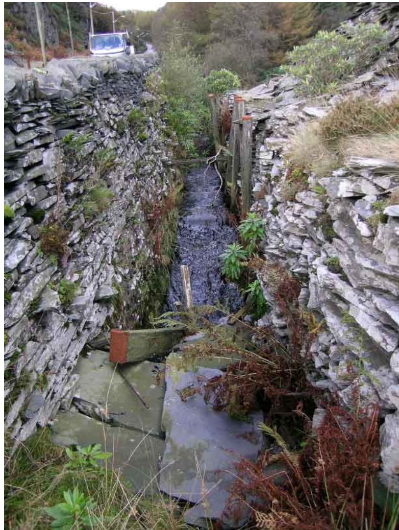
Plate 54 Site 6 Afon Barlwyd culvert, north end