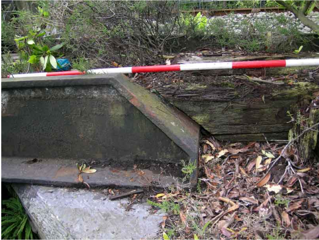
Plate 19 Bridge 67, girder end fitted to baulk