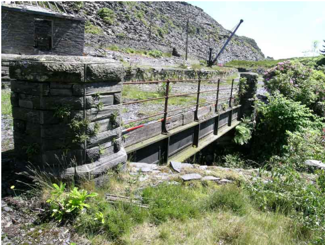
Plate 20 Bridge 68, general view