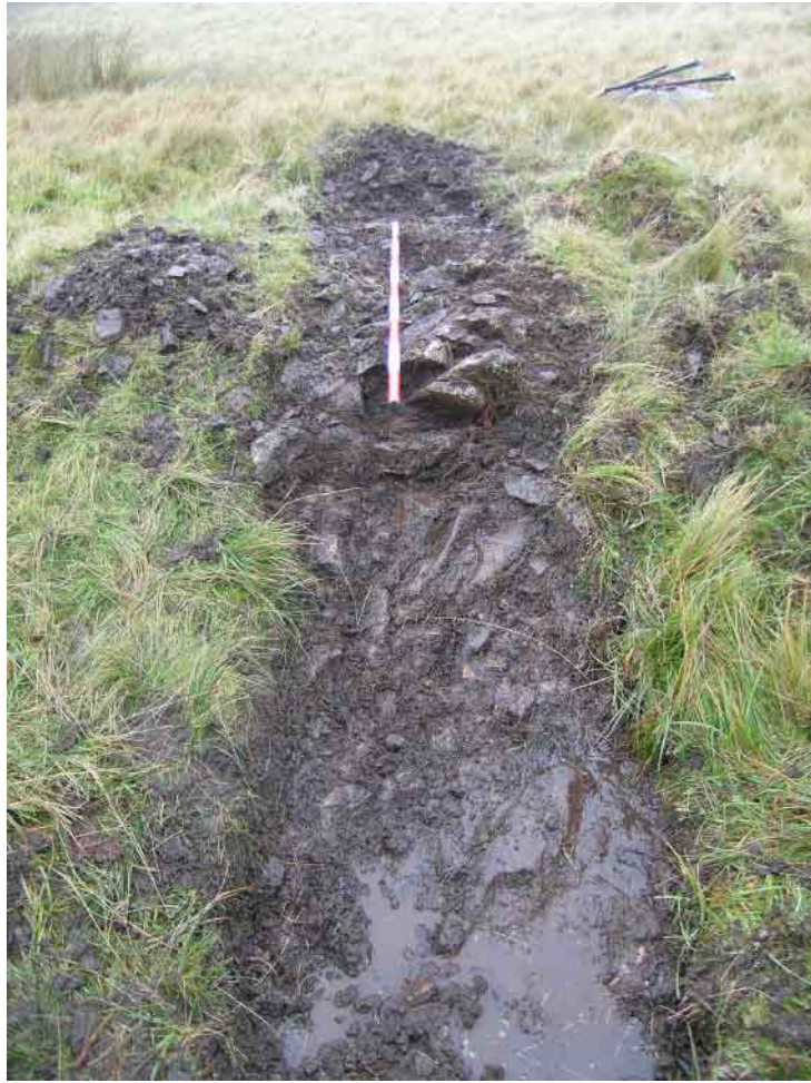
Plate 9 Site 33b Possible cairn, excavation showing bedrock