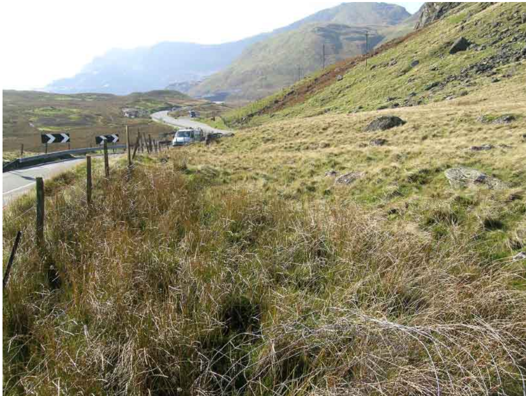
Plate 92 Site 26a Pre-turnpike road