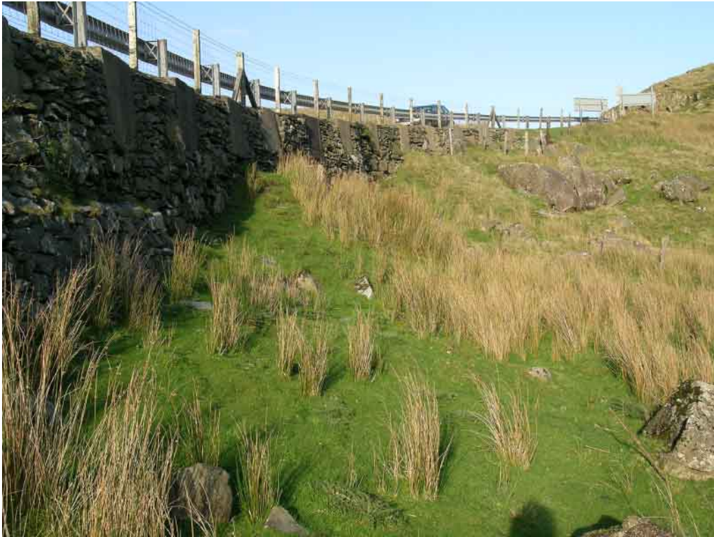
Plate 49 Site 5 Road revetment Crimea Road