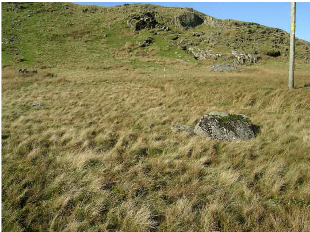
Plate 46 Site 27 Peat cutting