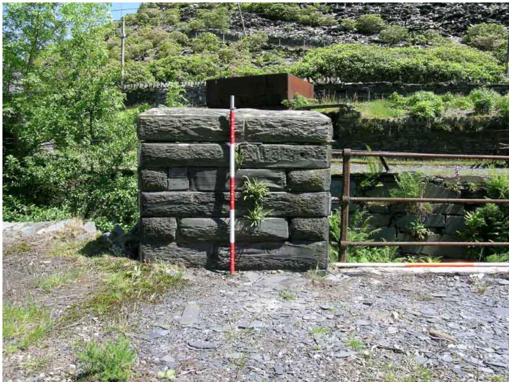
Plate 26 Bridge 68, parapet turret E side , W facing