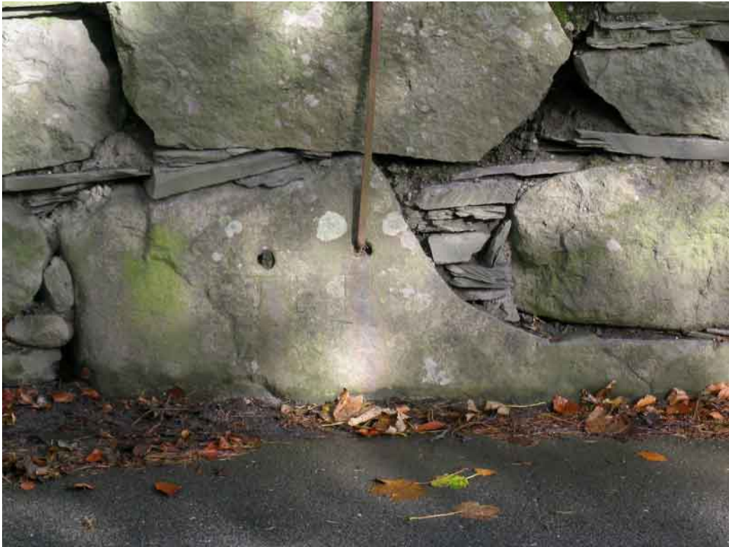
Plate 57 Site 9 Graffiti stones