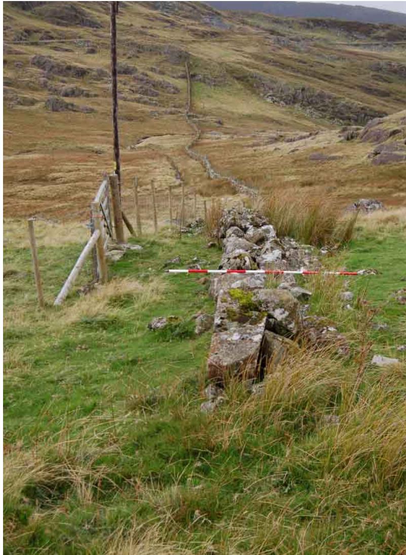
Plate 77 Site 37 Dry-stone field boundary