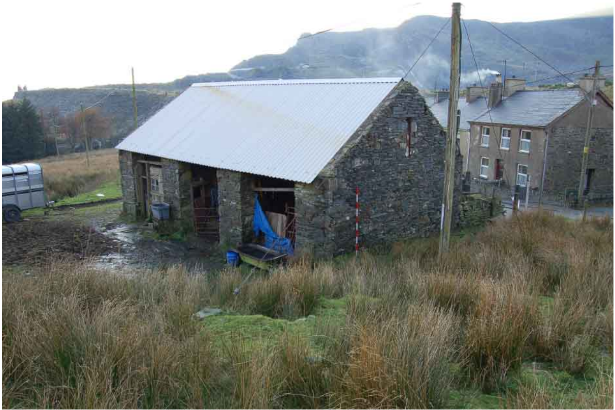
Plate 45 Site 10 Field barn Tal-y-Waenydd