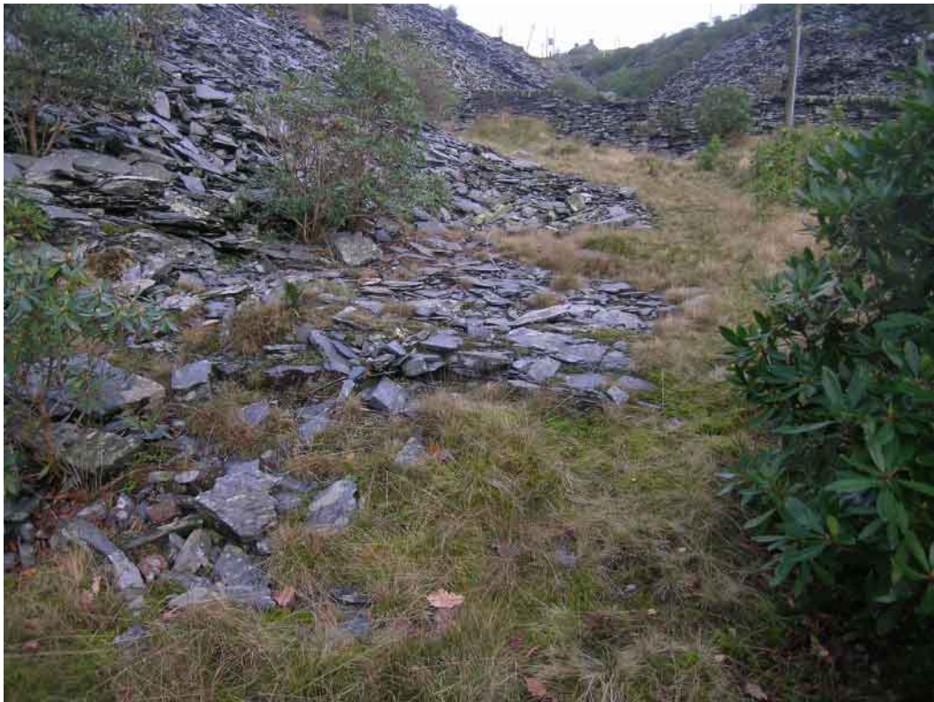
Plate 51 Site 5b Area with stone footings