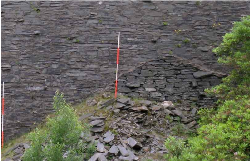
Plate 32 Masonry styles; earlier drystone masonry exposed by erosion