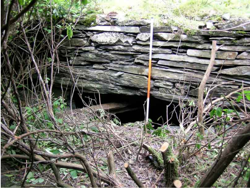
Plate 35 Incline tunnel, E side