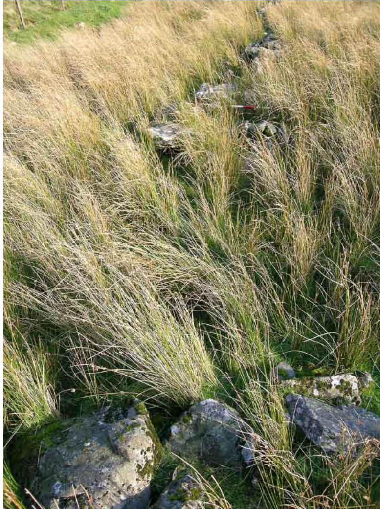
Plate 71 Site 23 Field boundary