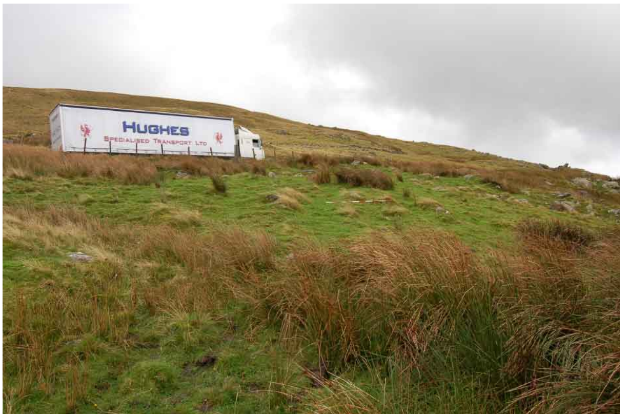
Plate 84 Site 38 Pre-turnpike road