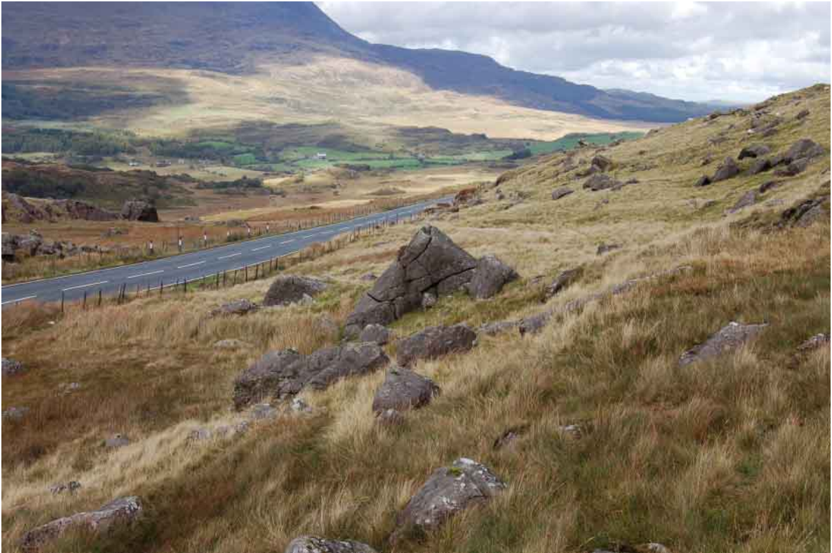
Plate 85 Site 35 Pre-turnpike road