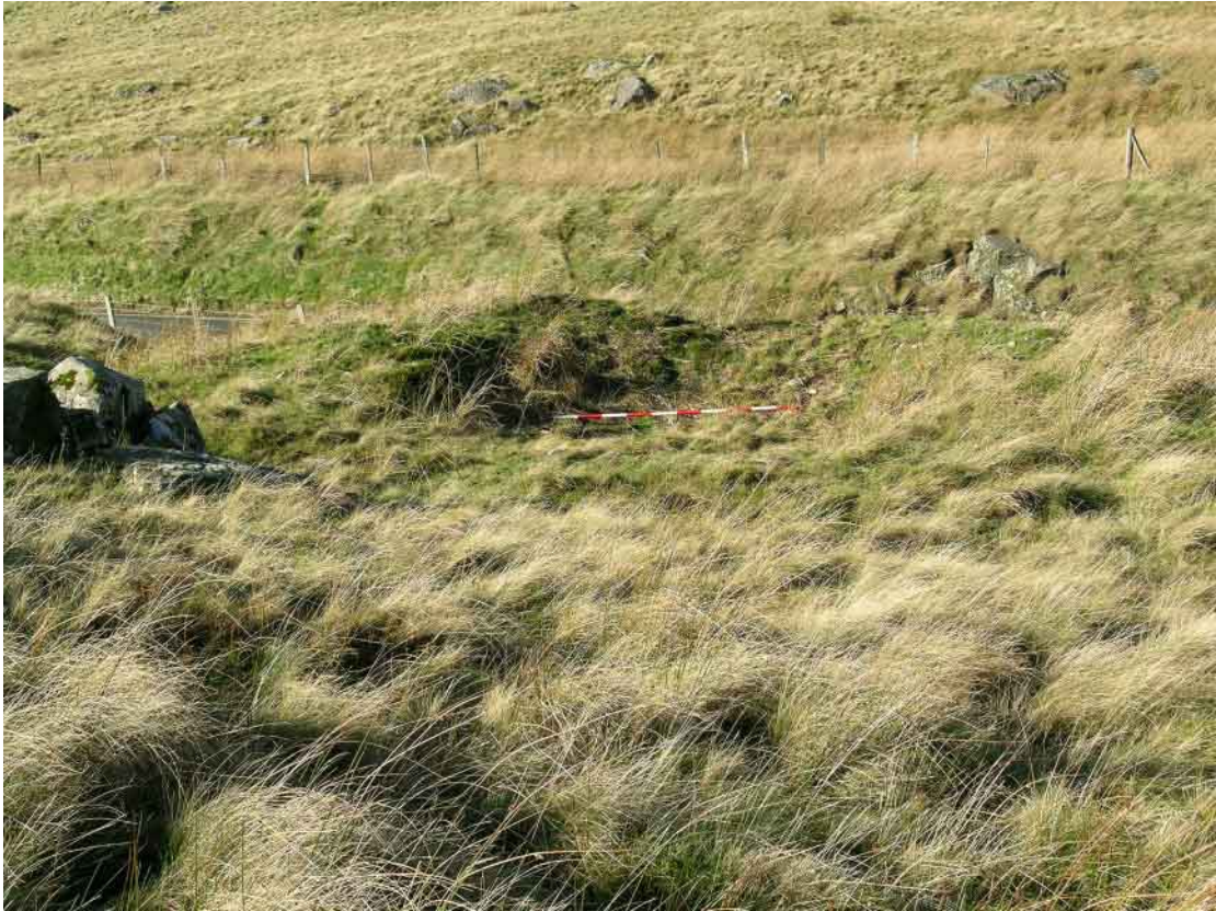
Plate 3 Site 25 Small circular feature