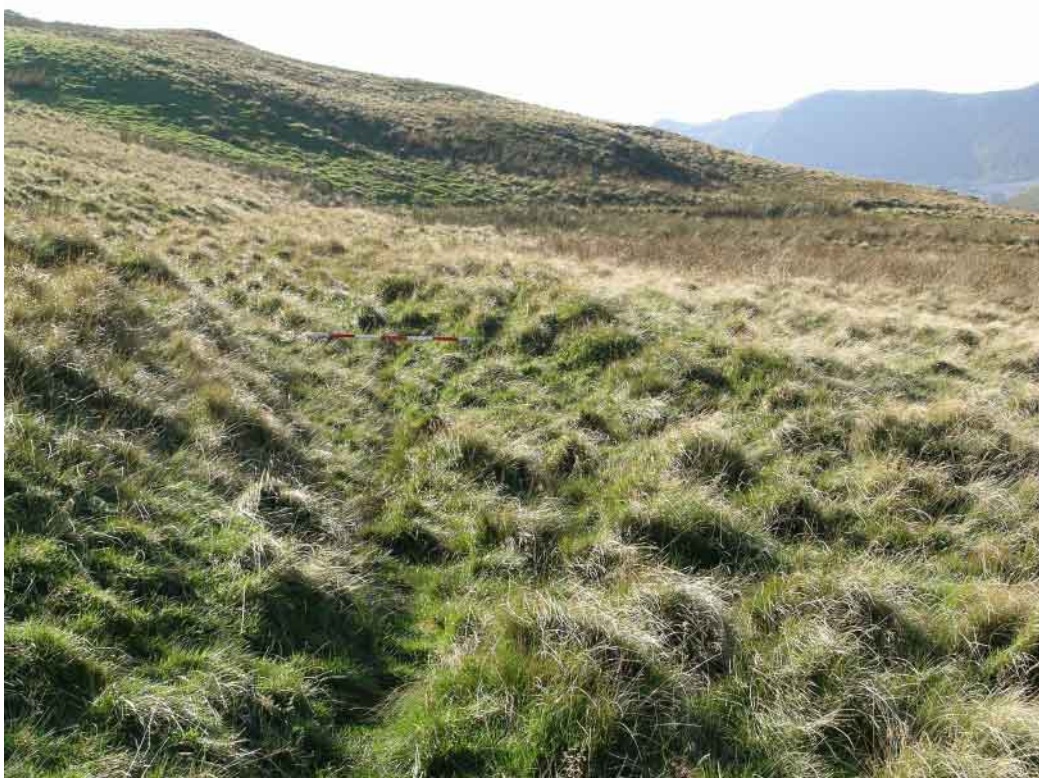
Plate 91 Site 26 Pre-turnpike road