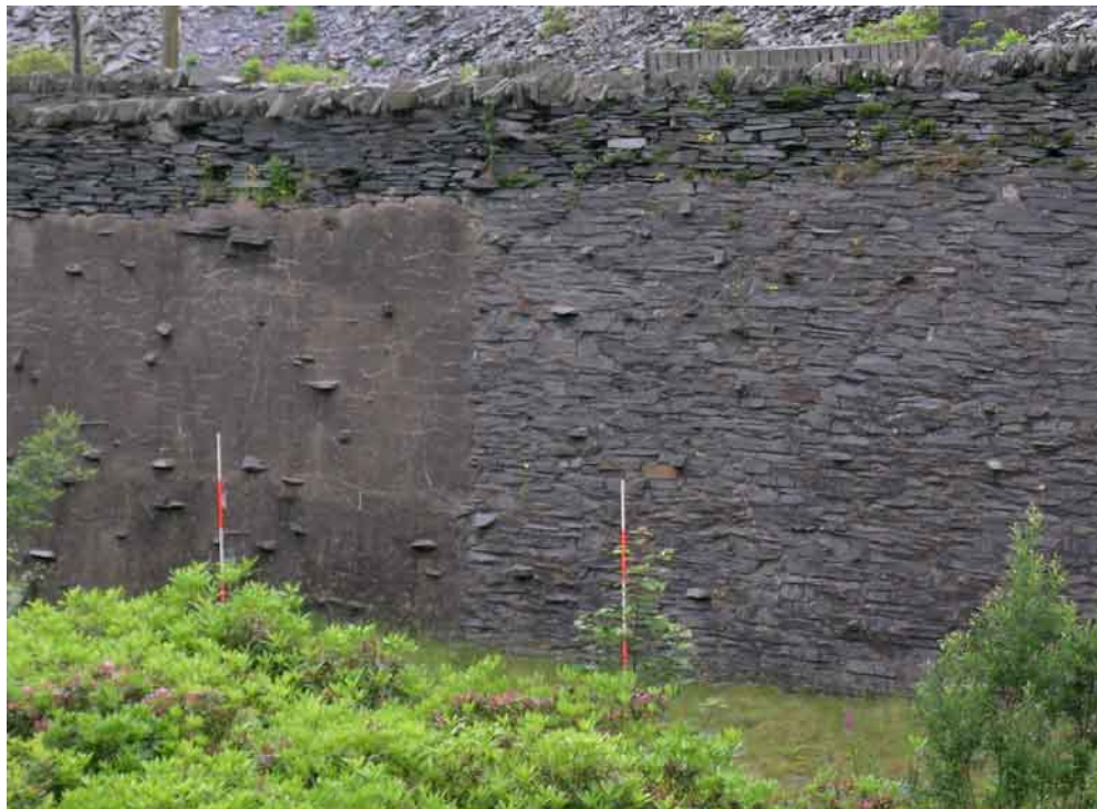
Plate 30 Masonry styles; slate with spray concrete render and pointing