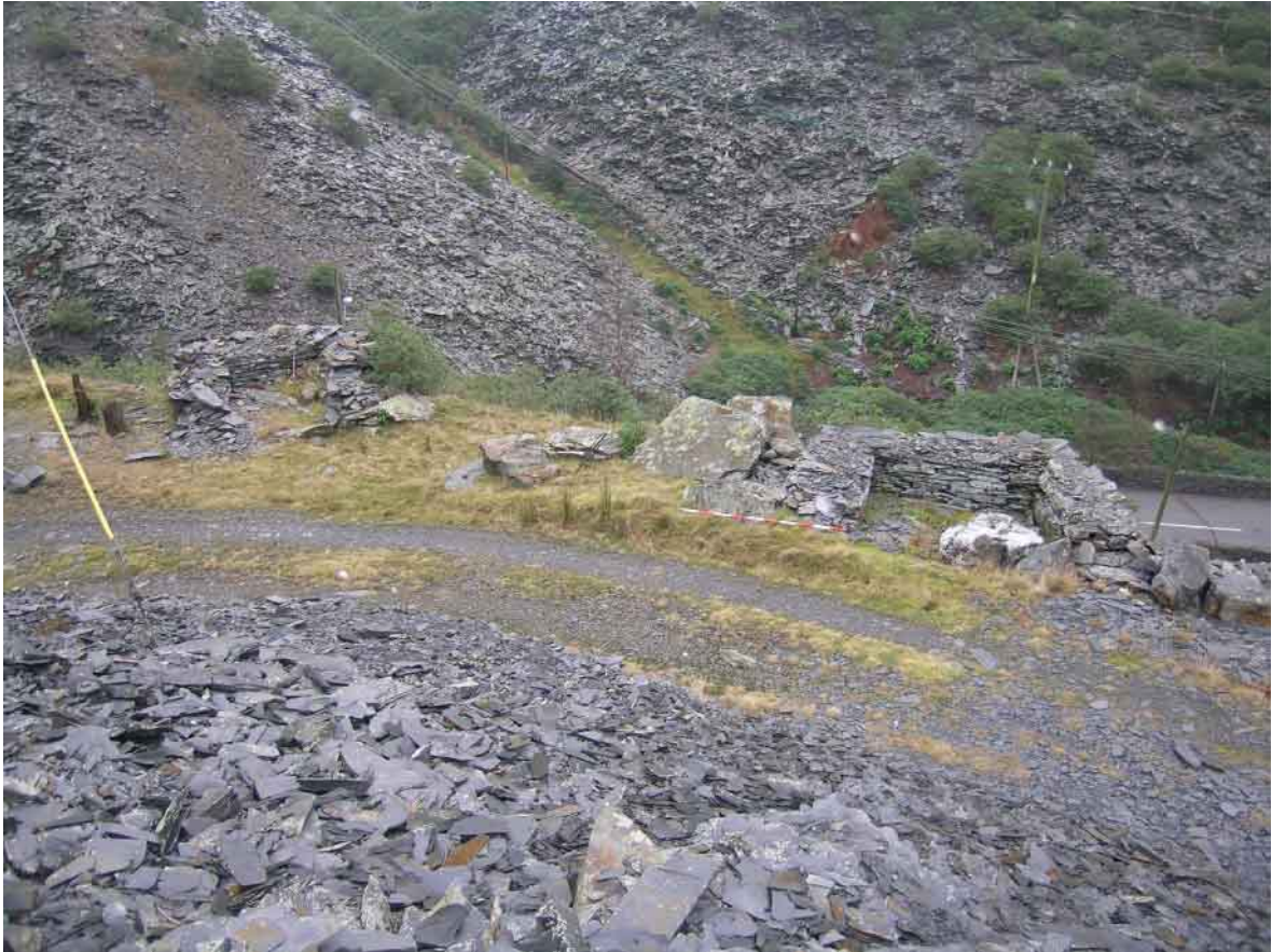
Plate 81 Site 43 Slate tips, Oakeley Complex (shelters)