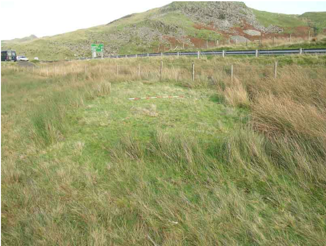
Plate 65 Site 19 Slate dump