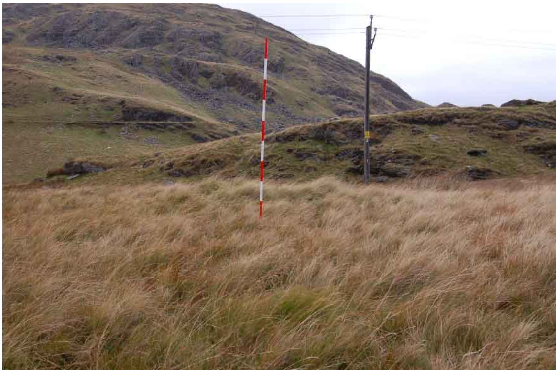
Plate 8 Site 33b Possible cairn