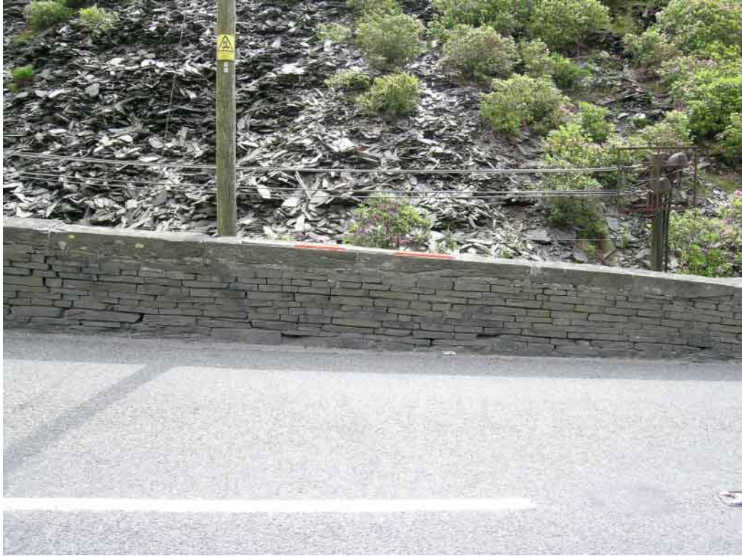
Plate 31 Masonry styles; roadside parapet, dry laid slate