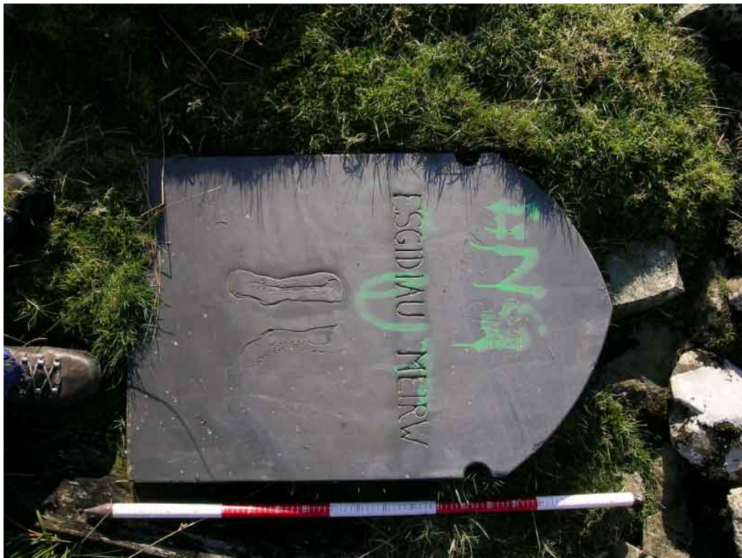
Plate 68 Site 20 Esgidiau Meirw, stone