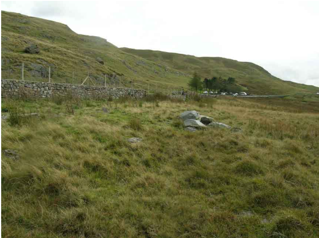
Plate 6 Site 33a Embanked curvilinear enclosure in 2005