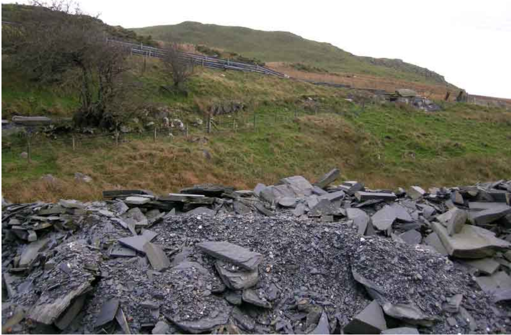
Plate 63 Site 15 Track to Fridd-y-bwlch reservoir