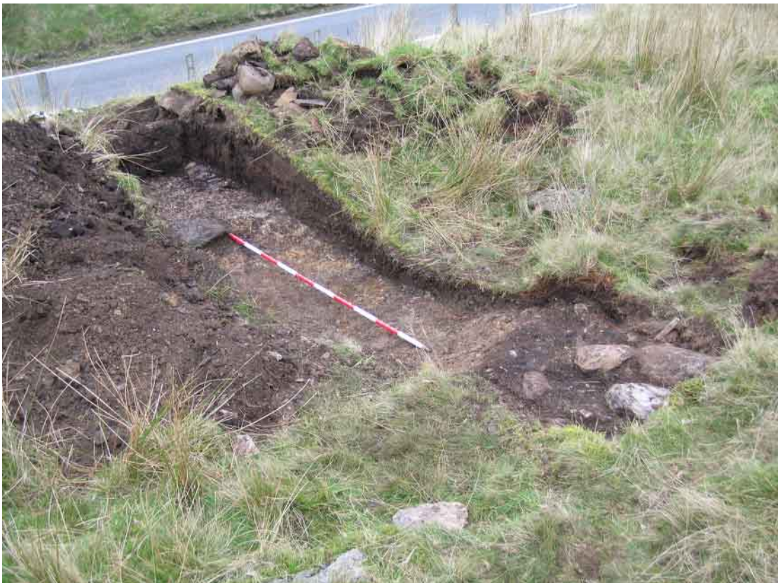
Plate 4 Site 25 Small circular feature, excavation trench