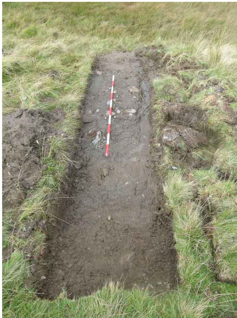
Plate 12 Site 39b Road, excavation trench