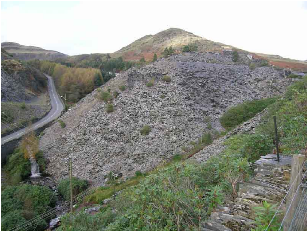
Plate 55 Site 7 Slate tip Llechwedd quarry