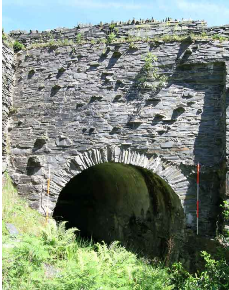
Plate 33 Incline tunnel, W side