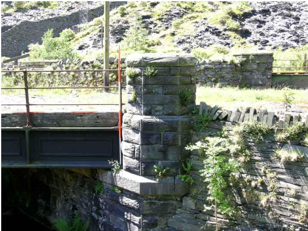
Plate 25 Bridge 68, parapet turret E side , E facing