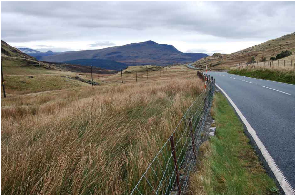
Plate 74 Site 29 Small slate dump