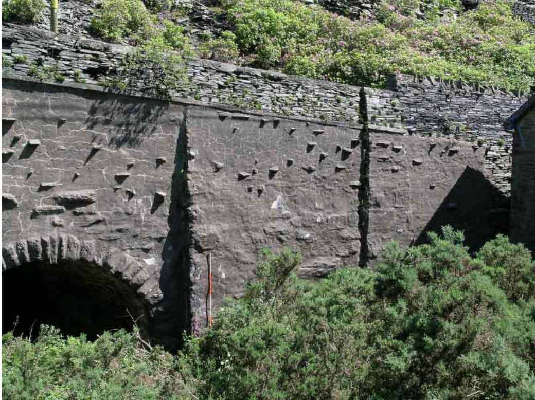
Plate 27 Road embankment, W side