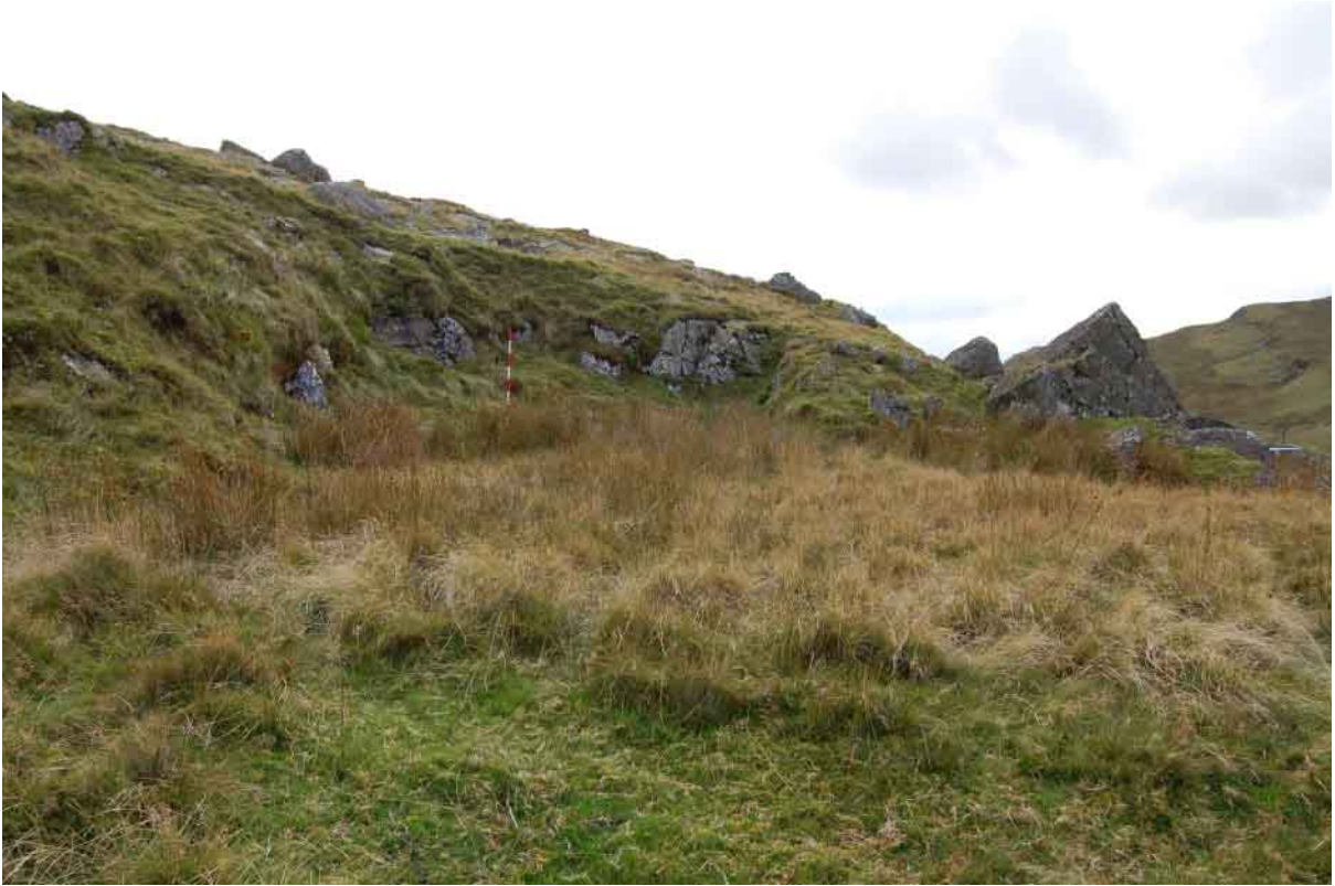
Plate 87 Site 61 Pre-turnpike road quarry