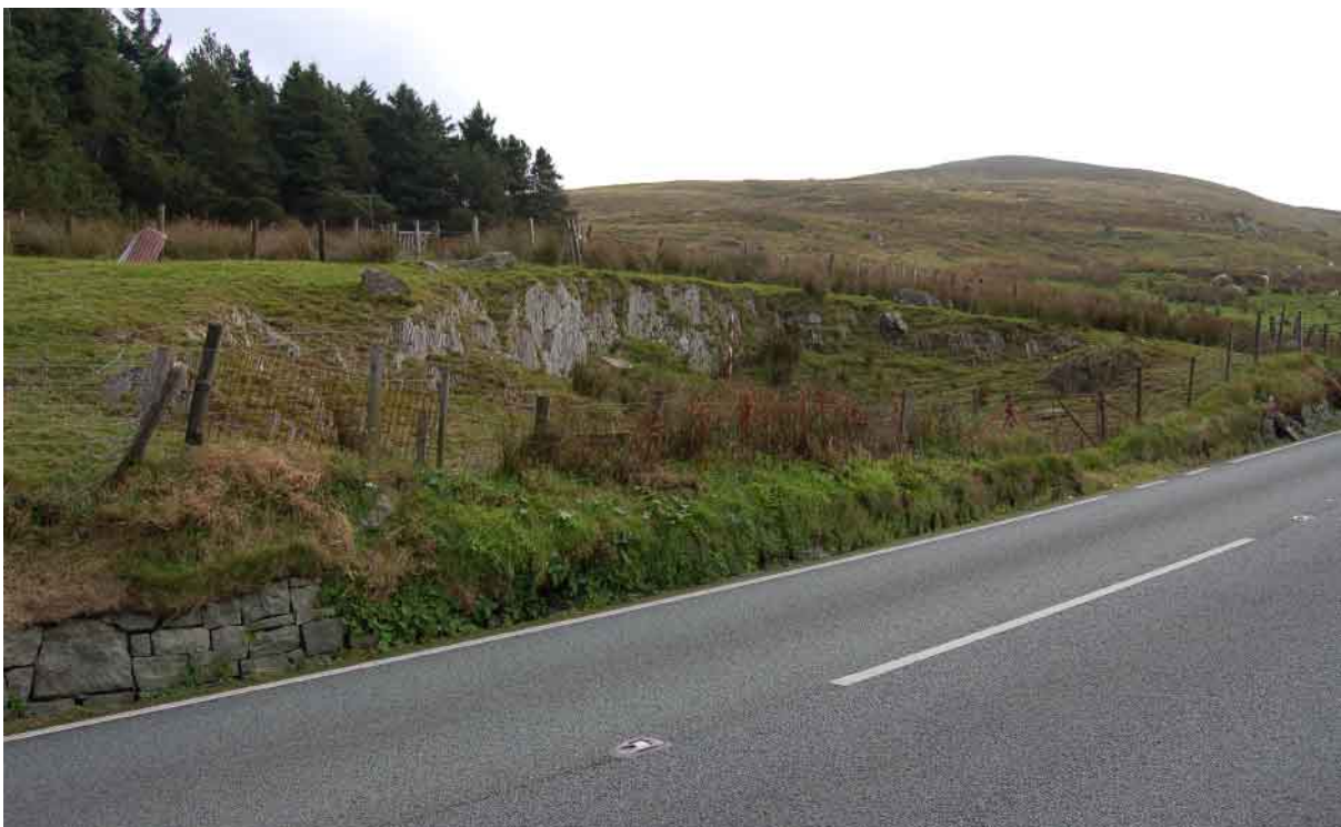
Plate 78 Site 40 Small quarry