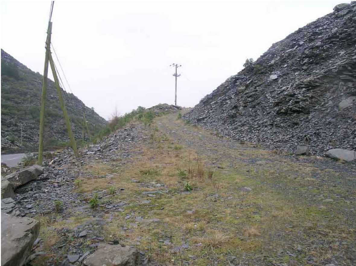
Plate 82 Site 43 Slate tips, Oakeley Complex (track)