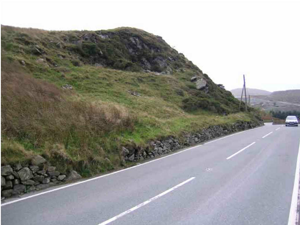
Plate 62 Site 14 Roadside quarry scoops