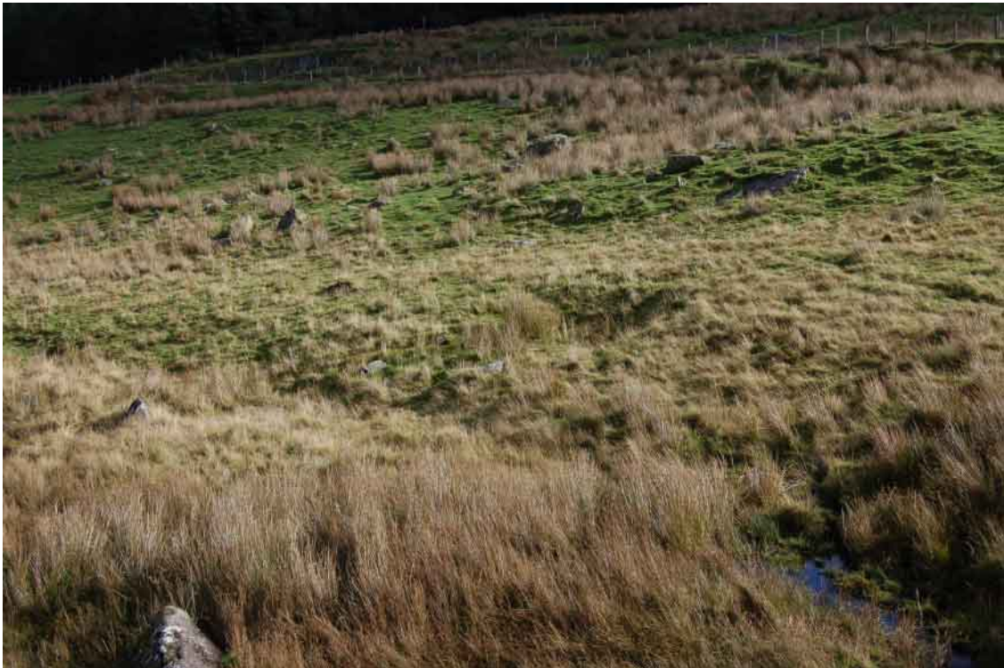
Plate 10 Site 39 a and b Settlement and road