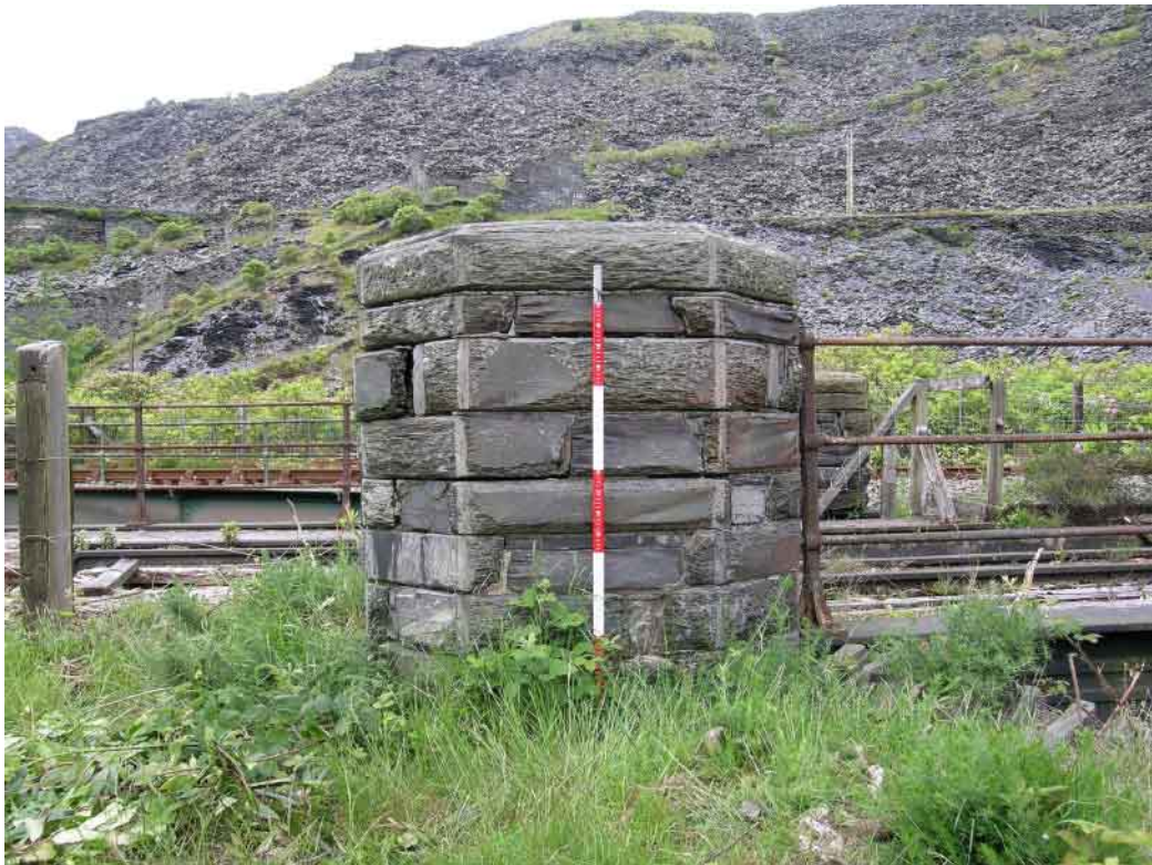
Plate 18 Bridge 67, parapet turret W side, E facing