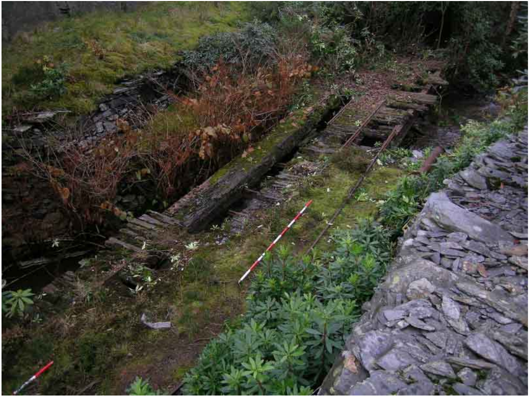
Plate 41 Site 3(3) Railway bridge