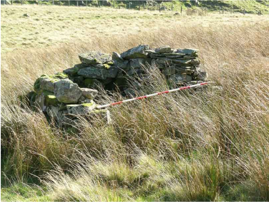
Plate 47 Site 27 Peat cutting, associated shelter