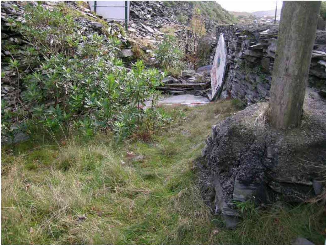
Plate 53 Site 6 Afon Barlwyd culvert, central covered part