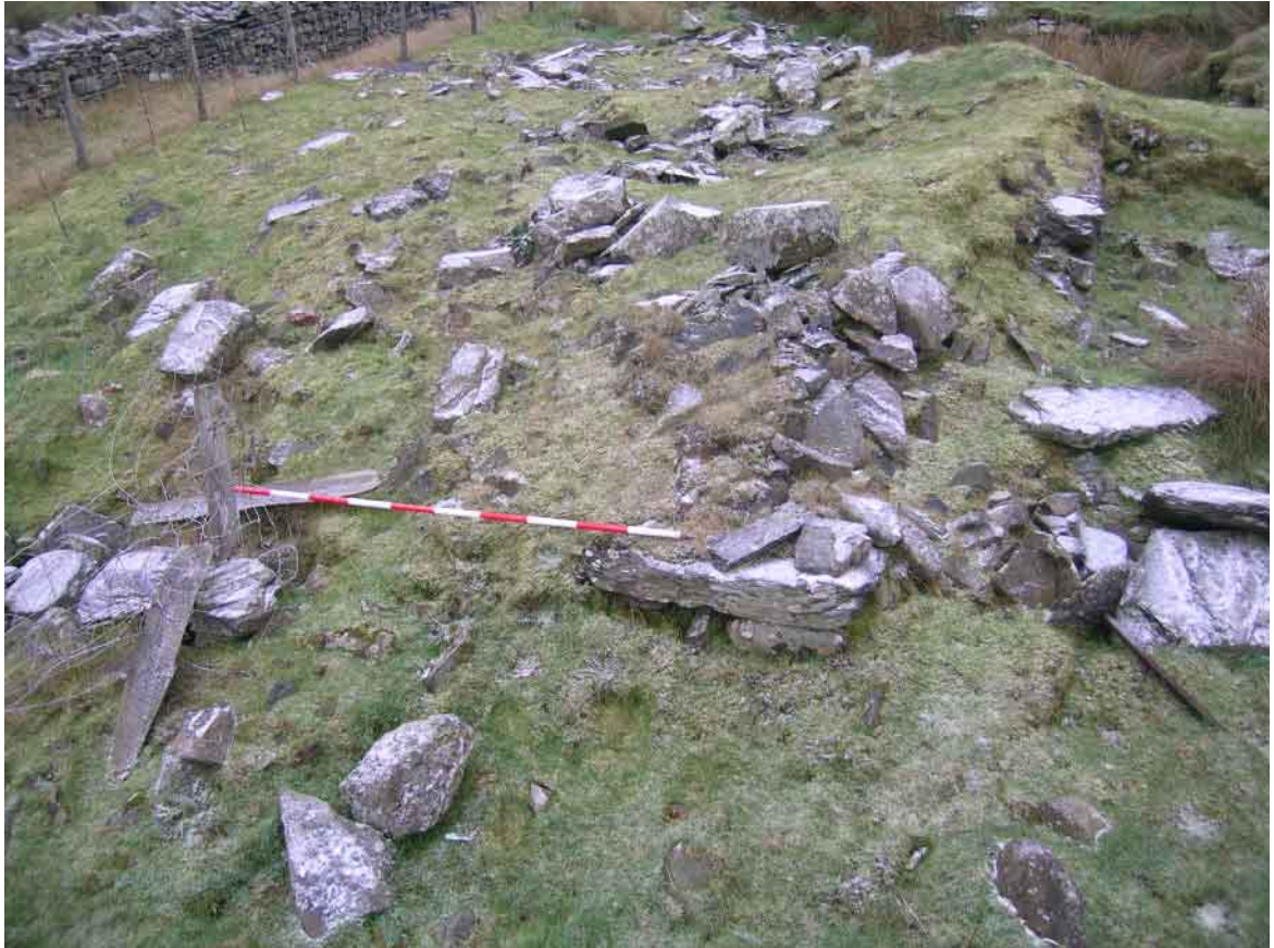
Plate 75 Site 31 Remains of the Crimea Inn