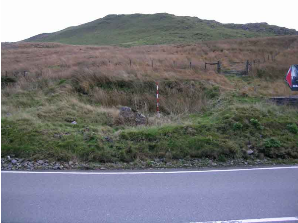
Plate 61 Site 14 Roadside quarry scoops