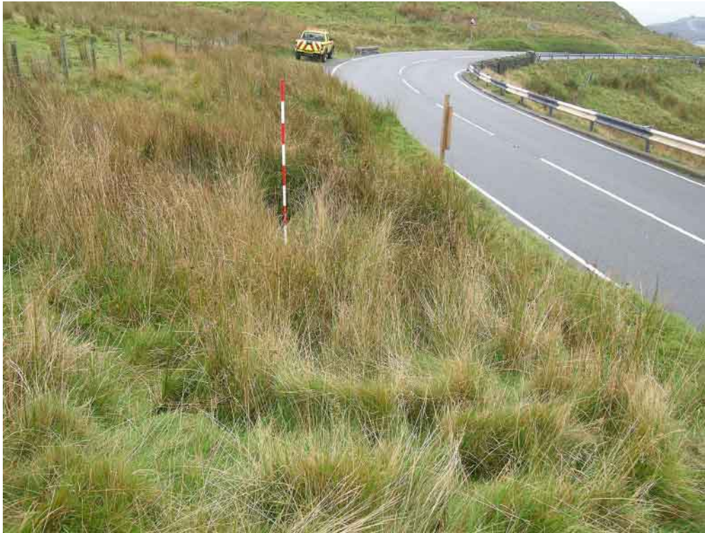
Plate 1 Site 17 Sub-rectangular scoop