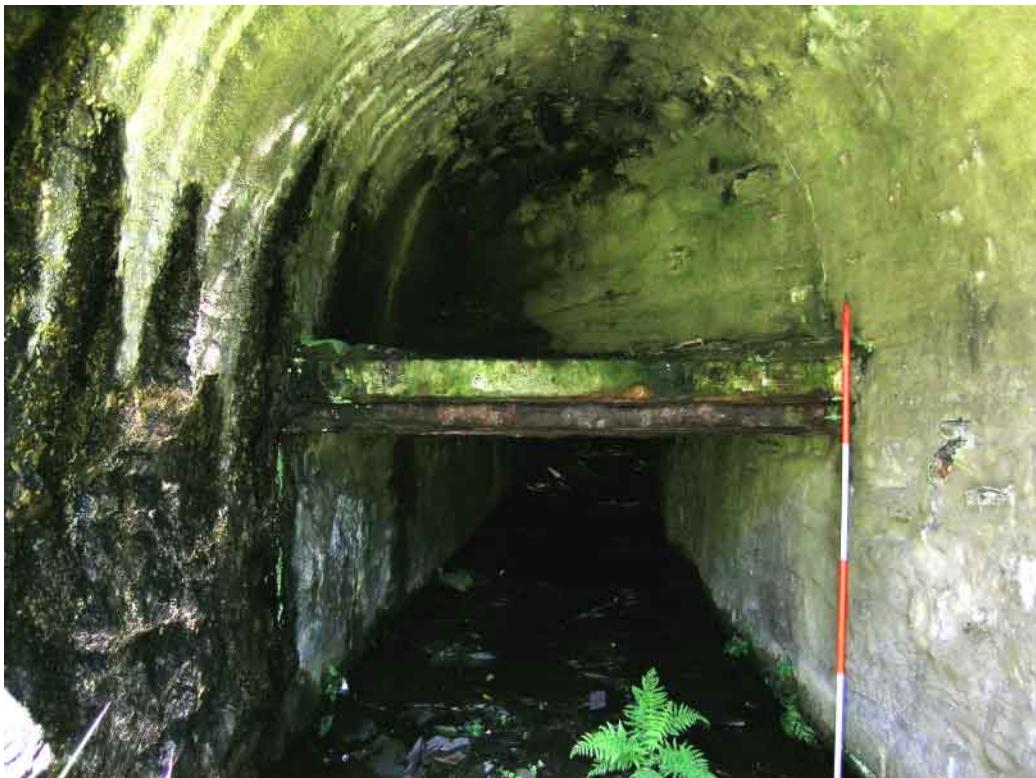
Plate 34 Incline tunnel, W side, partial blocking within tunnel