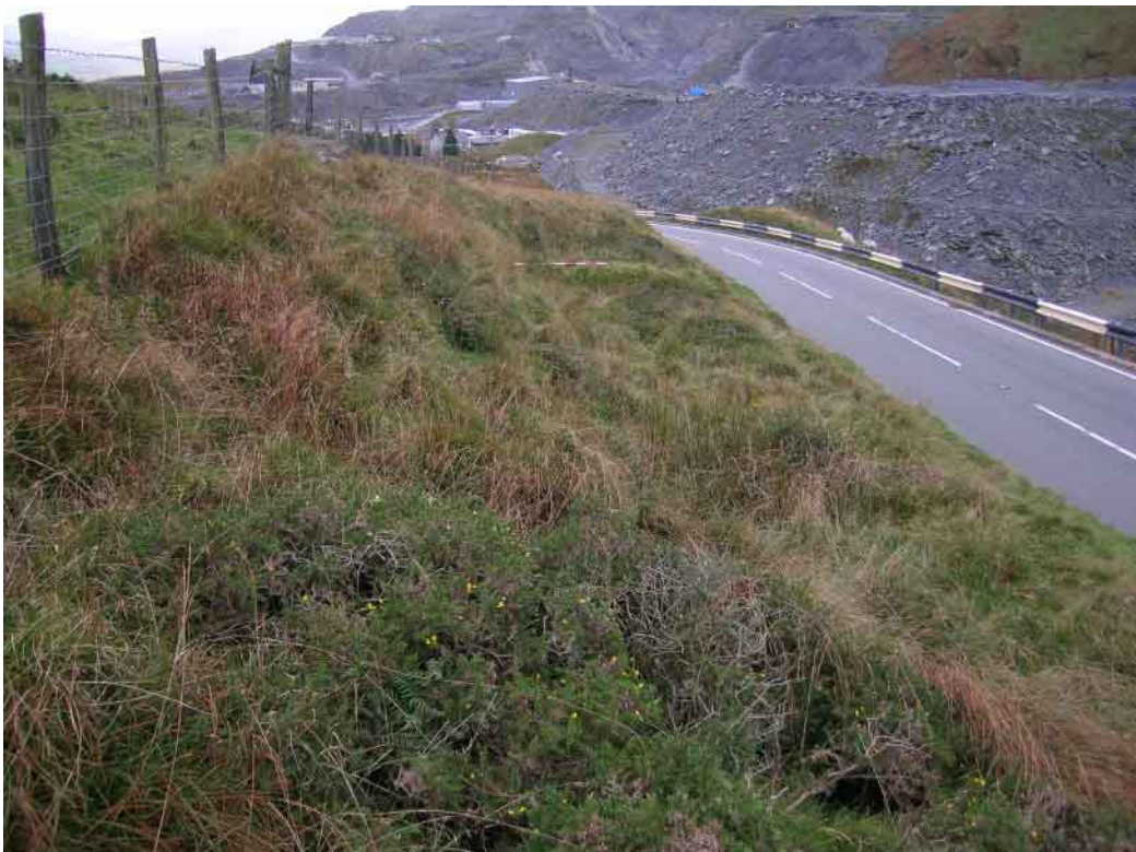
Plate 94 Site 16 Pre-turnpike road