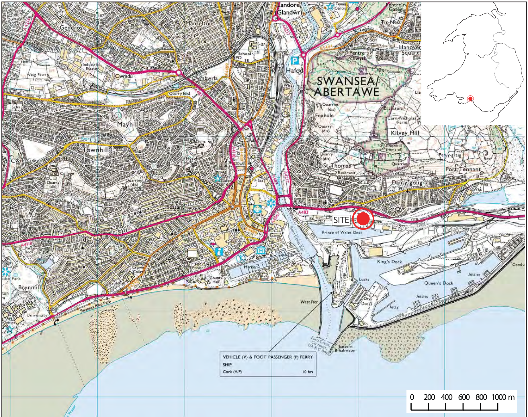
Figure 1: Location map, 1:25,000 @ A4

The Ordnance Survey has granted Archaeology Wales Ltd a Copyright Licence (No. 100055111) to reproduce map information; Copyright remains otherwise with the Ordnance Survey