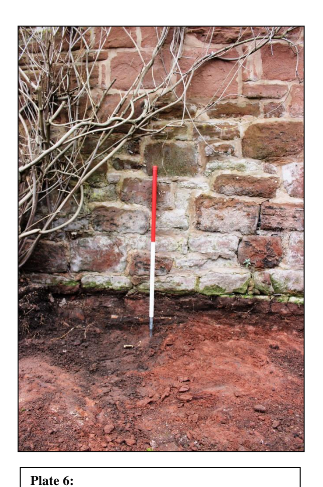
Removal of cobblestones exposed bedrock at 250mm below former surface level, against the north boundary wall