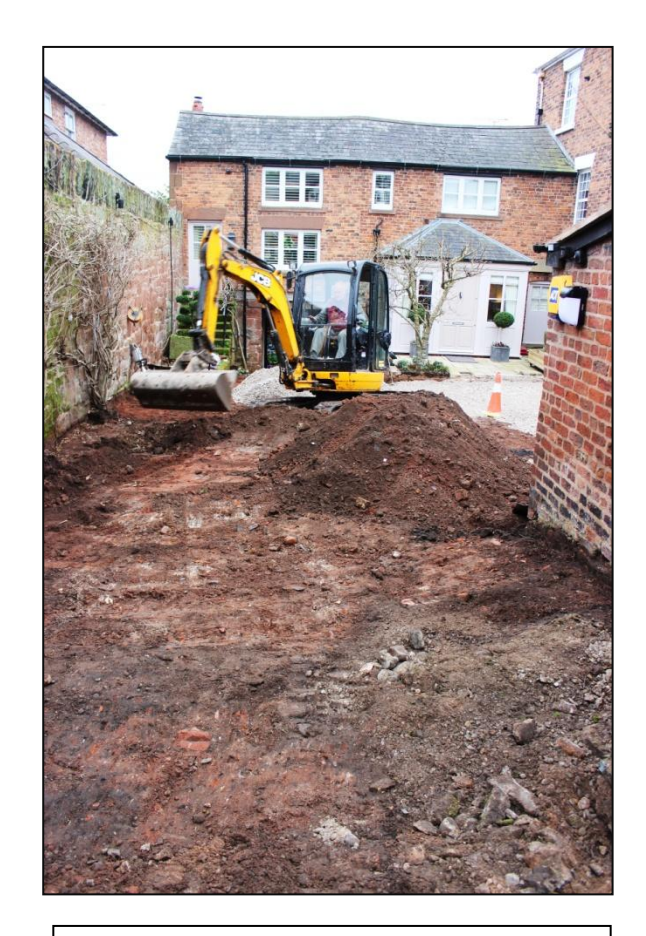
Plate 7: Removal of cobblestones and excavation from the pavement into the courtyard, view from the west