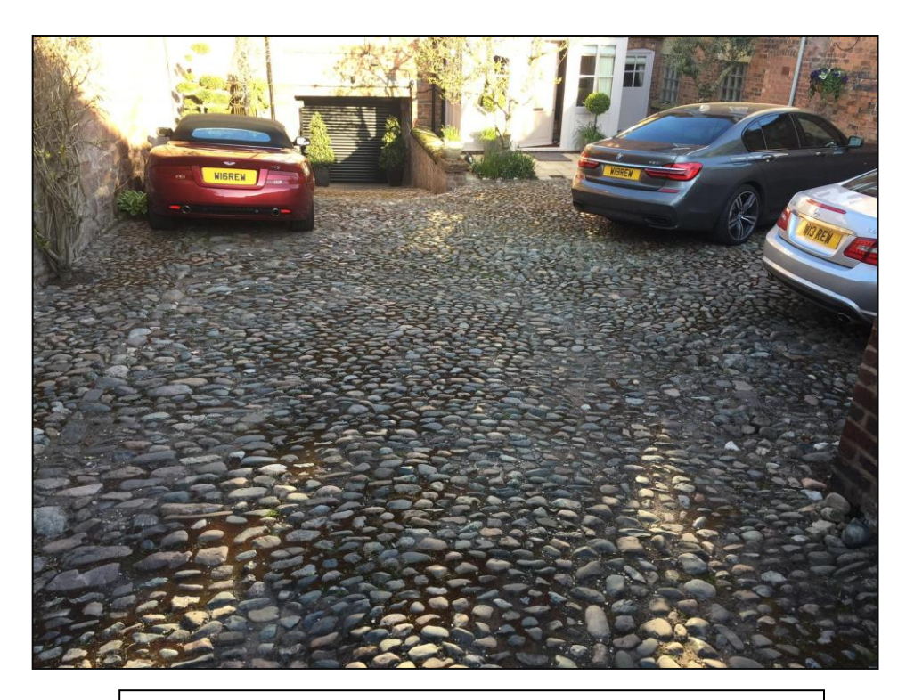
Plate 1: Cobbled driveway to be replaced, September 2018