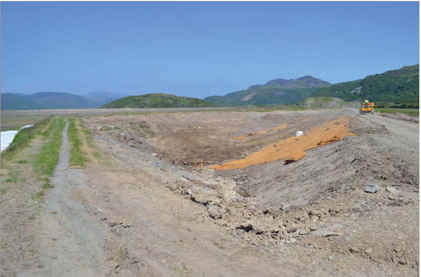
Plate 16: New section of Fairbourne Embankment removing the right-angled junction at the west end of the scheme.