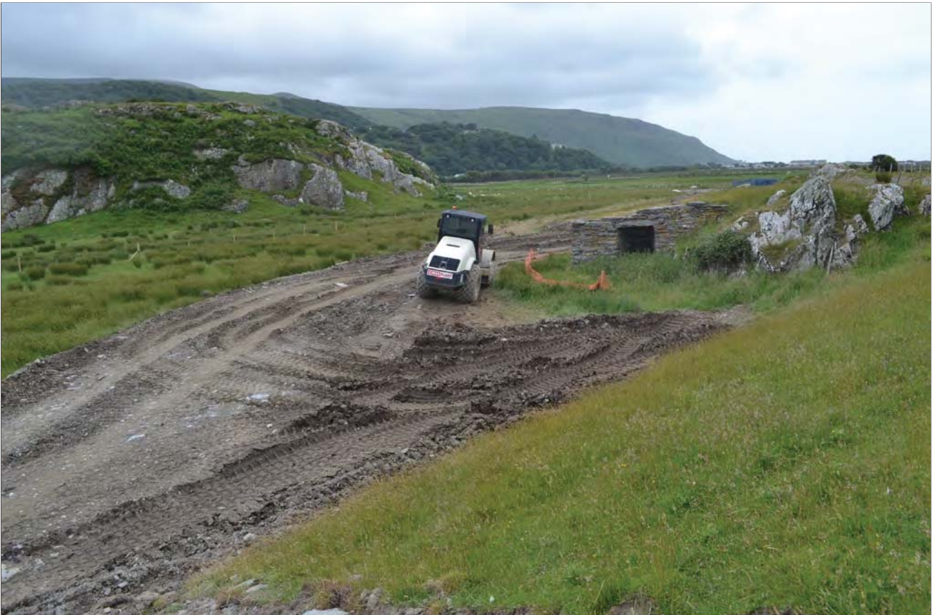
Plate 14: Use of the haul road adjacent to the lime kiln and Fairbourne Embankment. Scale 1m