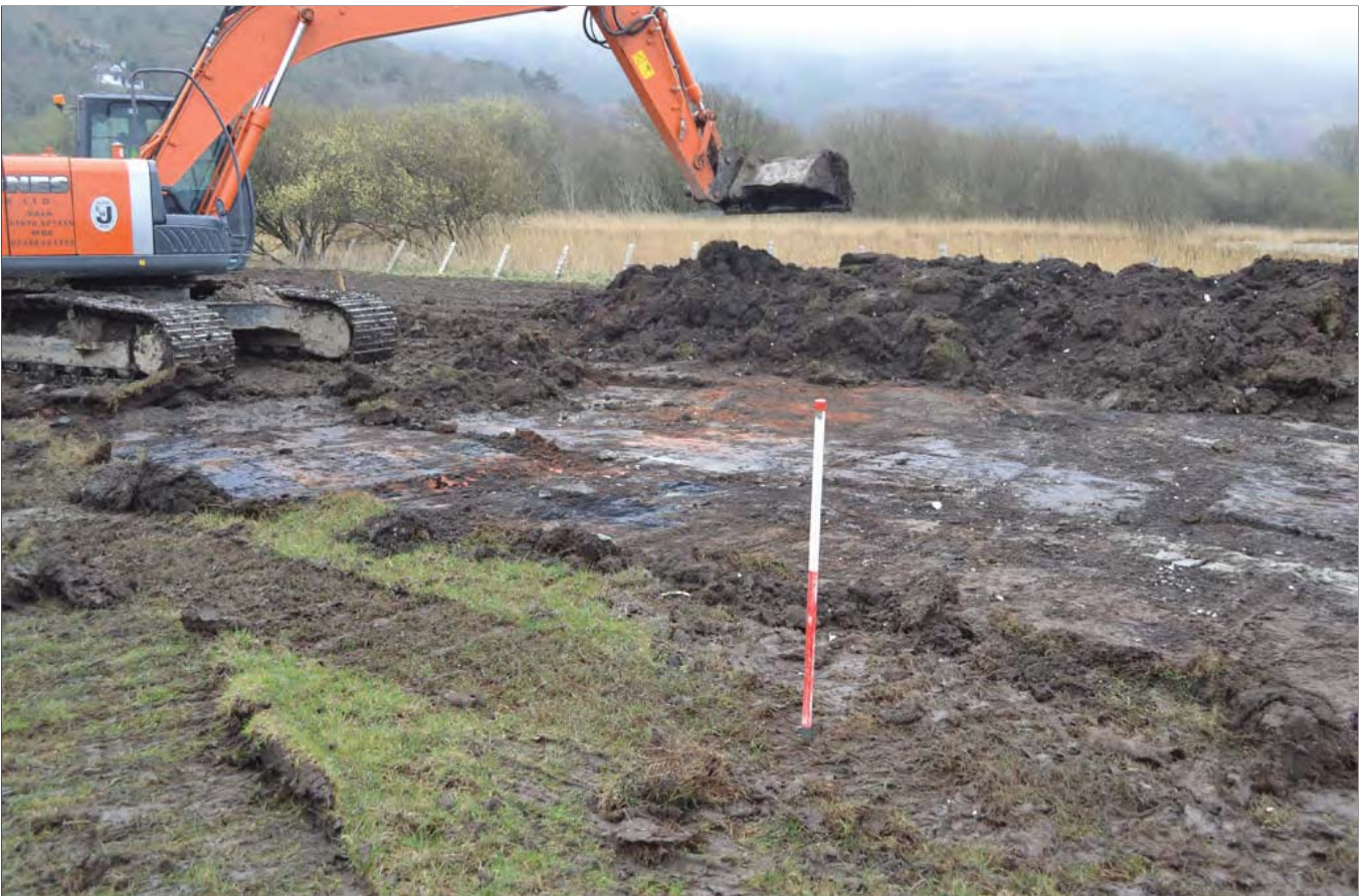
Plate 08: Evidence of brick rubble within the topsoil, presumably related to the works at the Fairbourne Brickworks. Scale 1m