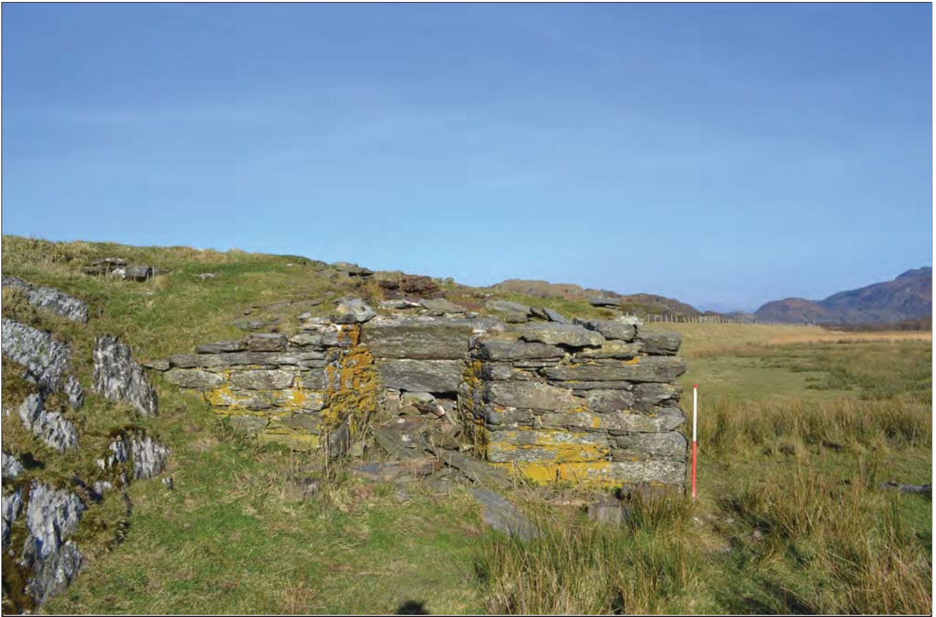
Plate 03: The Lime Kiln on the Fairbourne Embankment, viewed from the west. Scale 1m