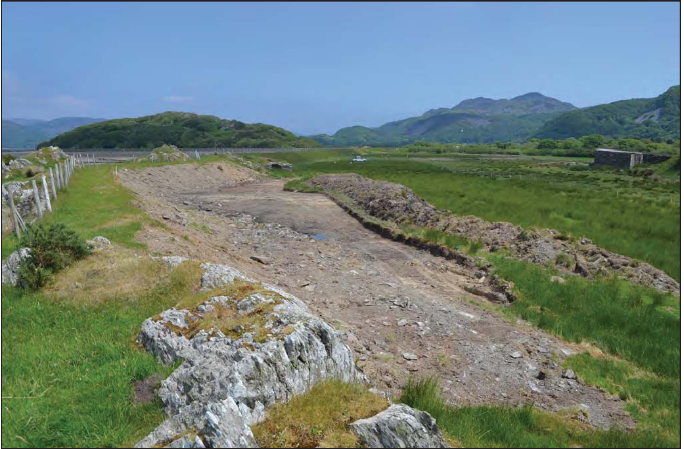
Plate 11: Topsoil strip adjacent to the embankment. View looking east