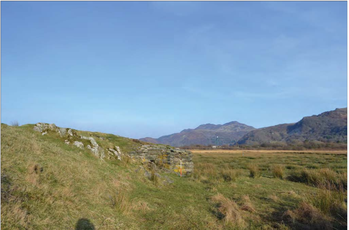
Plate 05: The Lime Kiln on the Fairbourne Embankment, viewed from the west, showing relationship with the rock outcrop built into the Fairbourne embankment. Scale 1m