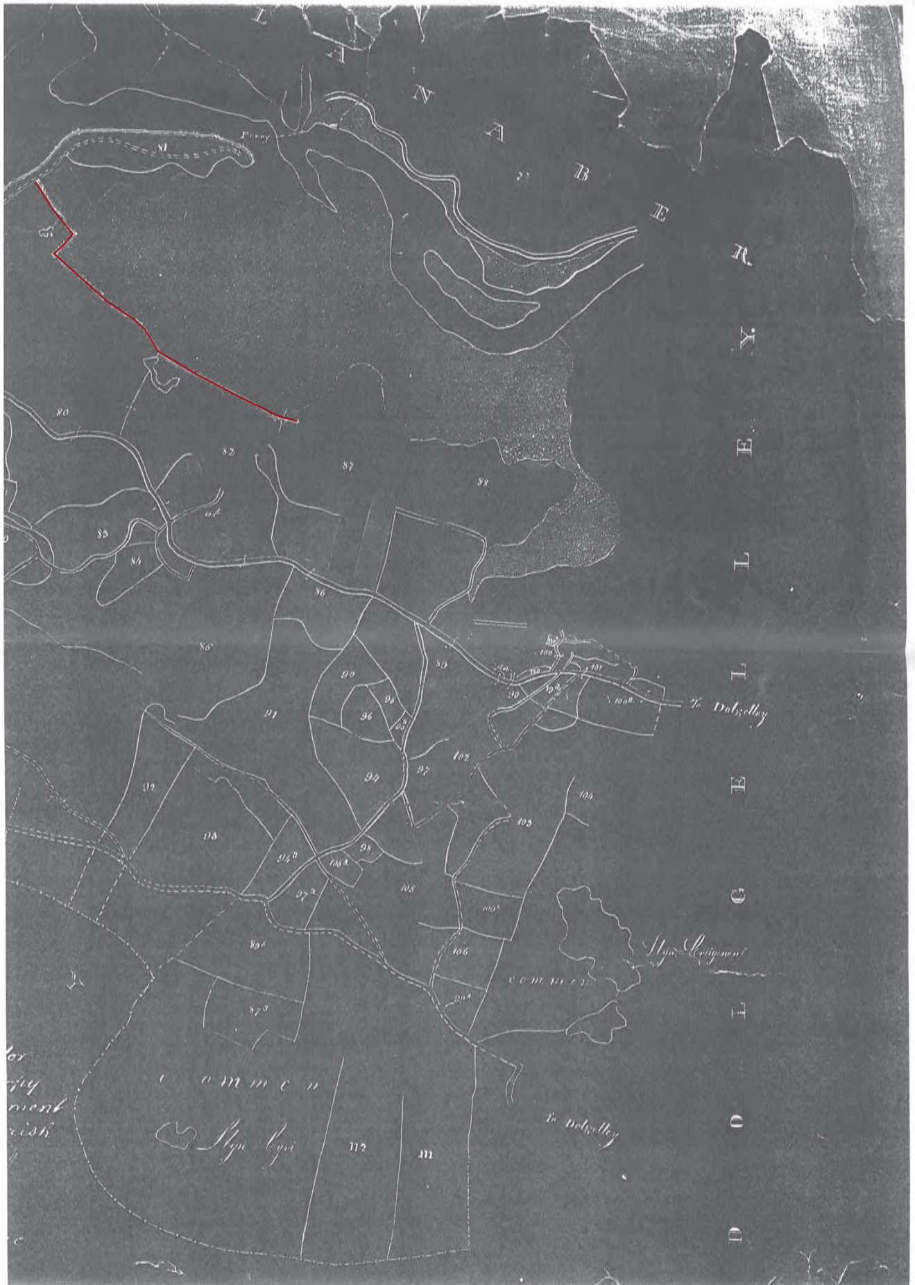
Figure 03: Tithe Map of the parish of Llangelynin of 1839 showing the Fairbourne Embankment (highlighted in red)