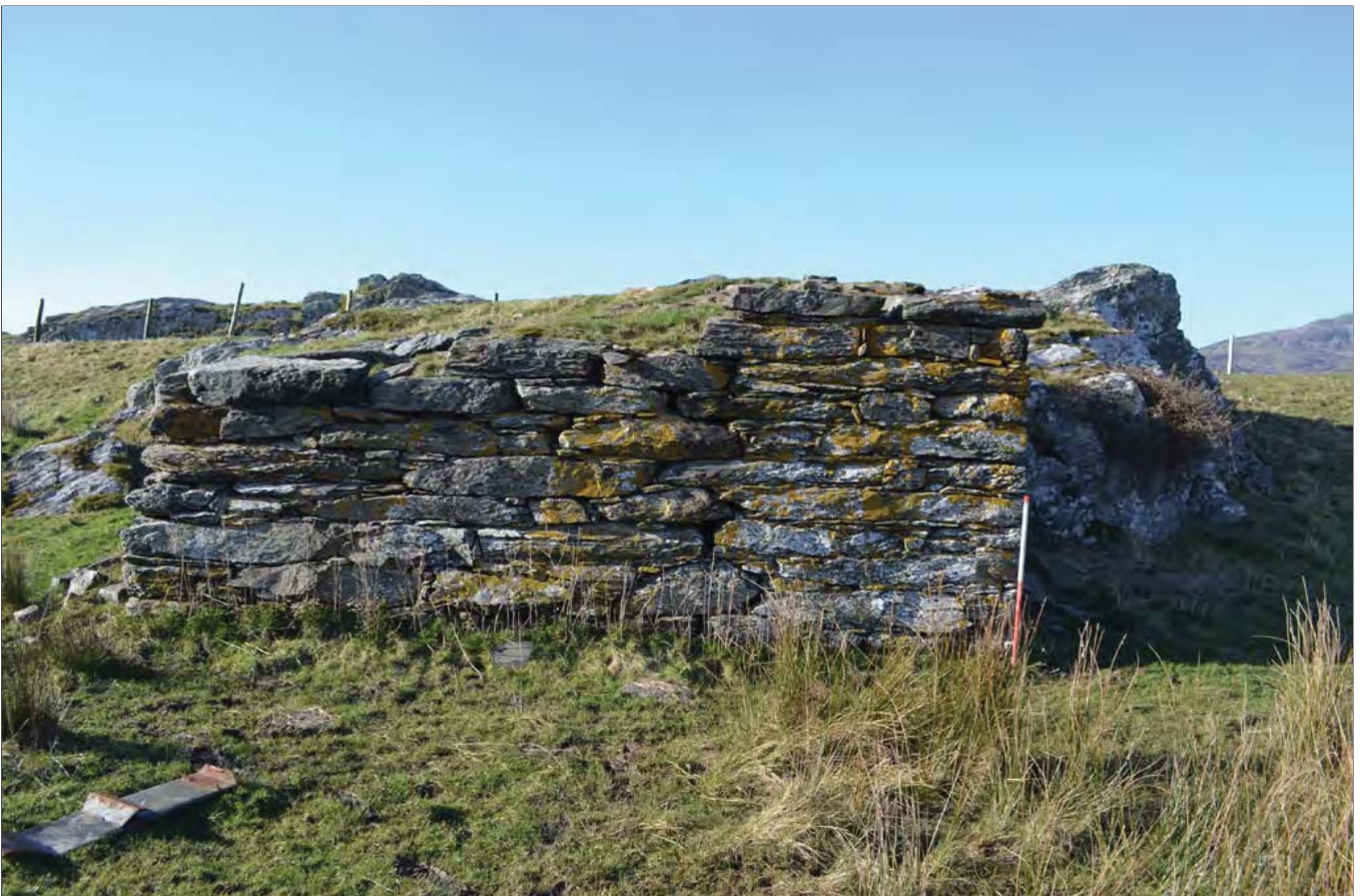
Plate 02: The Lime Kiln viewed from the south. Scale 1m