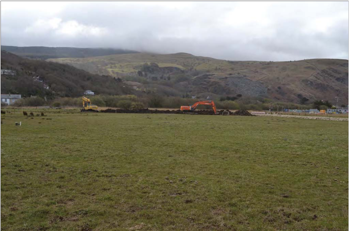
Plate 07: Excavation work on the borrow pit adjacent to the former brickworks site