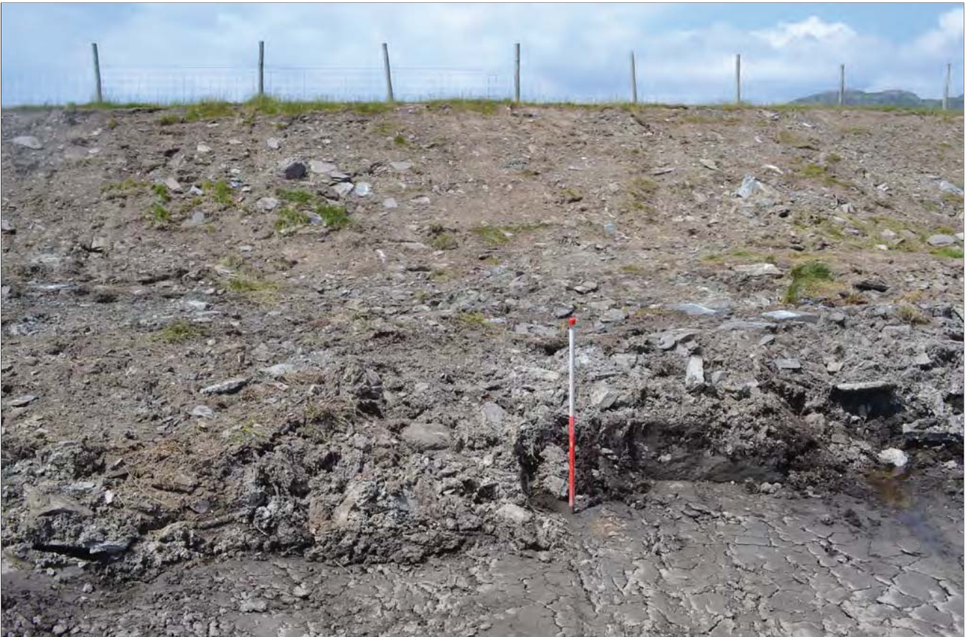
Plate 12: Fairbourne embankment, showing shale and clay make-up. View from the north. Scale 1m