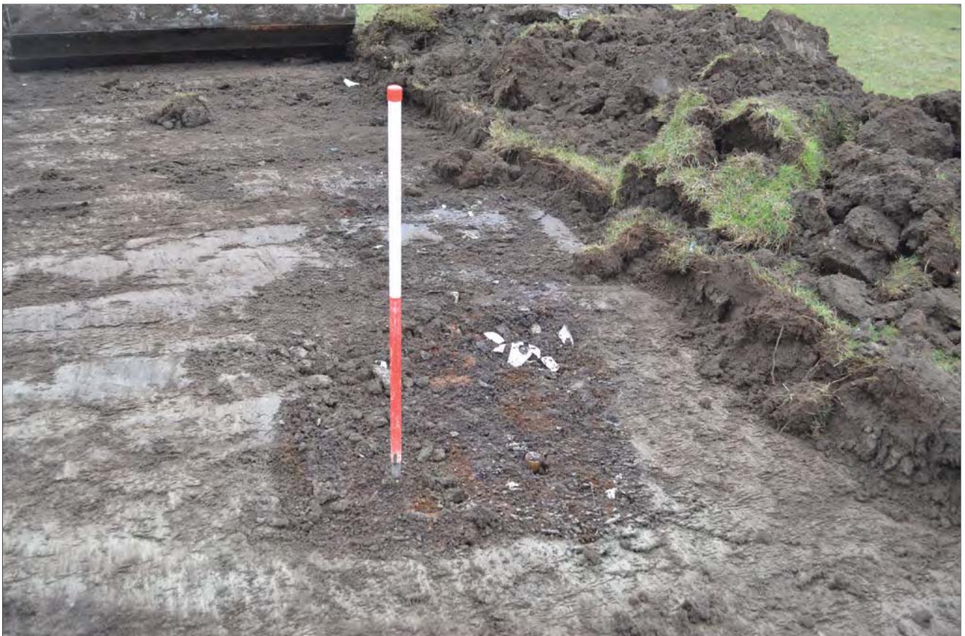
Plate 10: Evidence of a rubbish pit at the former Fairbourne Brickworks site. Scale 1m