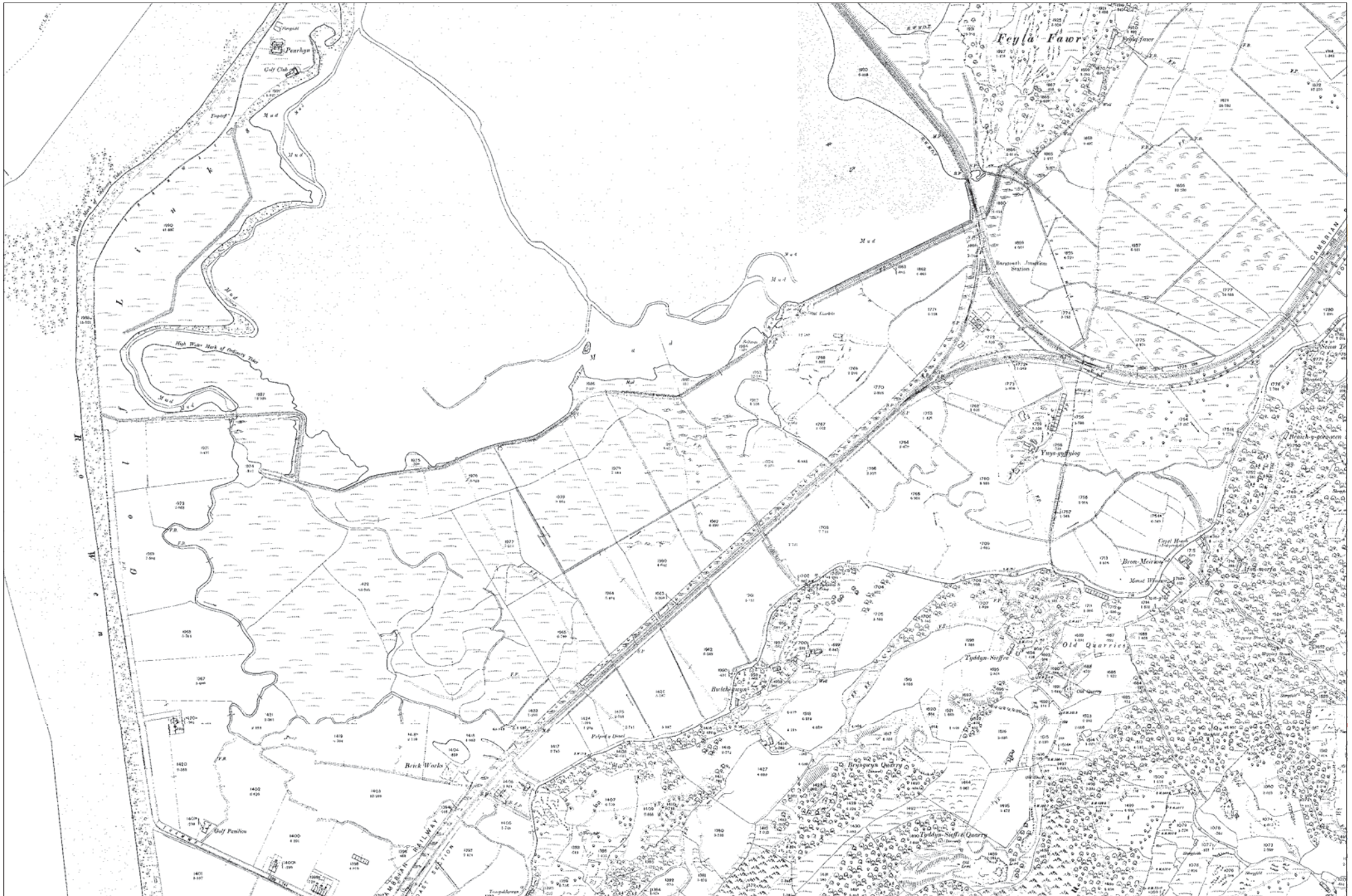
Figure 04: The Fairbourne Embankment in 1901, shown on the 25 inch 2nd edition Ordnance Survey Merioneth County Series Map, sheet XXXVI.10-11,14-15. Scale 1:10000@A4.