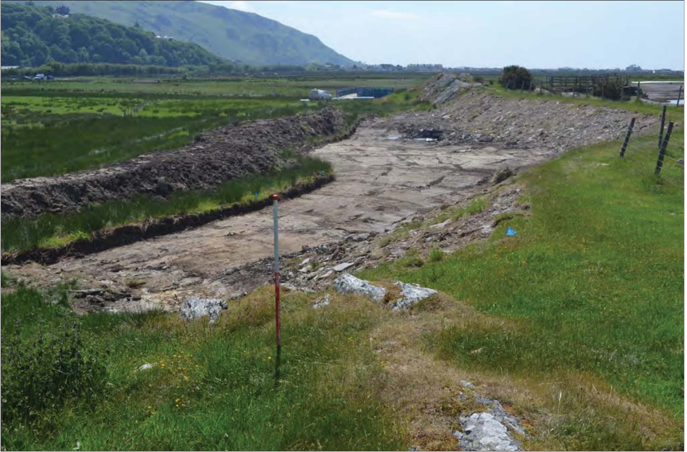
Plate 13: Topsoil strip of haul road east of the lime kiln. View looking west. Scale 1m