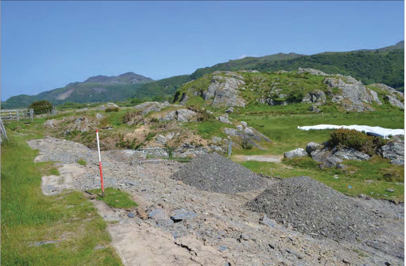
Plate 15: Stripped Topsoil showing clay and shale make-up of the embankment. View looking west. Scale 1m