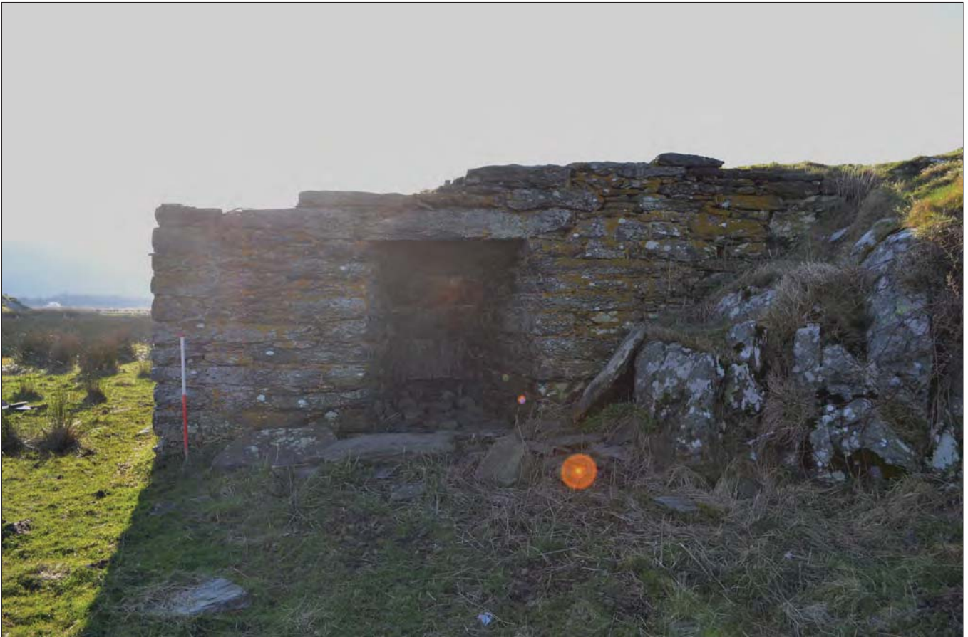
Plate 01: The Lime Kiln on the Fairbourne Embankment, viewed from the east. Scale 1m