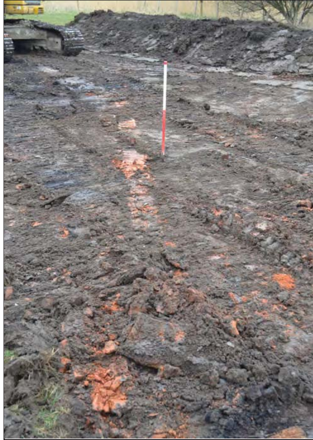
Plate 09: Excavation work on the borrow pit adjacent to the former brickworks site, showing double thickness of brickwork, which does not appear to be structural