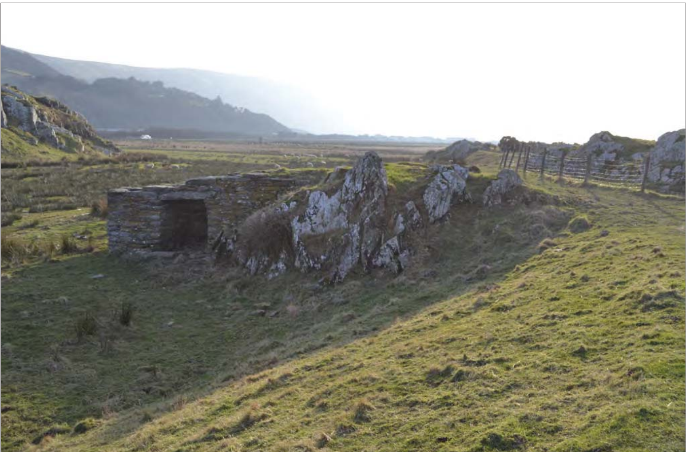
Plate 06: The Lime Kiln viewed from the east south east, showing hole into which the lime and fuel was shovelled. Scale 1m