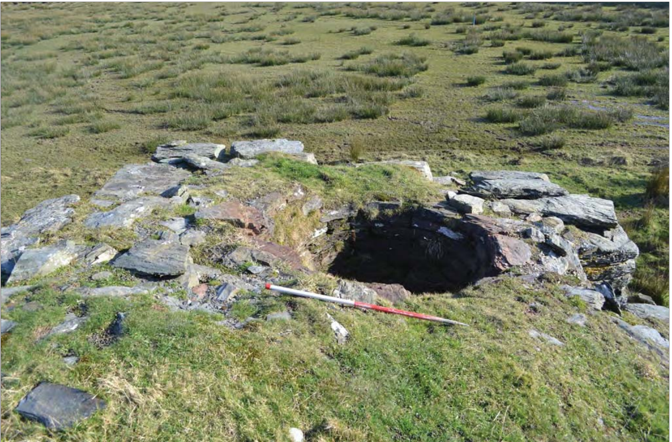
Plate 04: The Lime Kiln viewed from the north, showing hole into which the lime and fuel was shovelled. Scale 1m