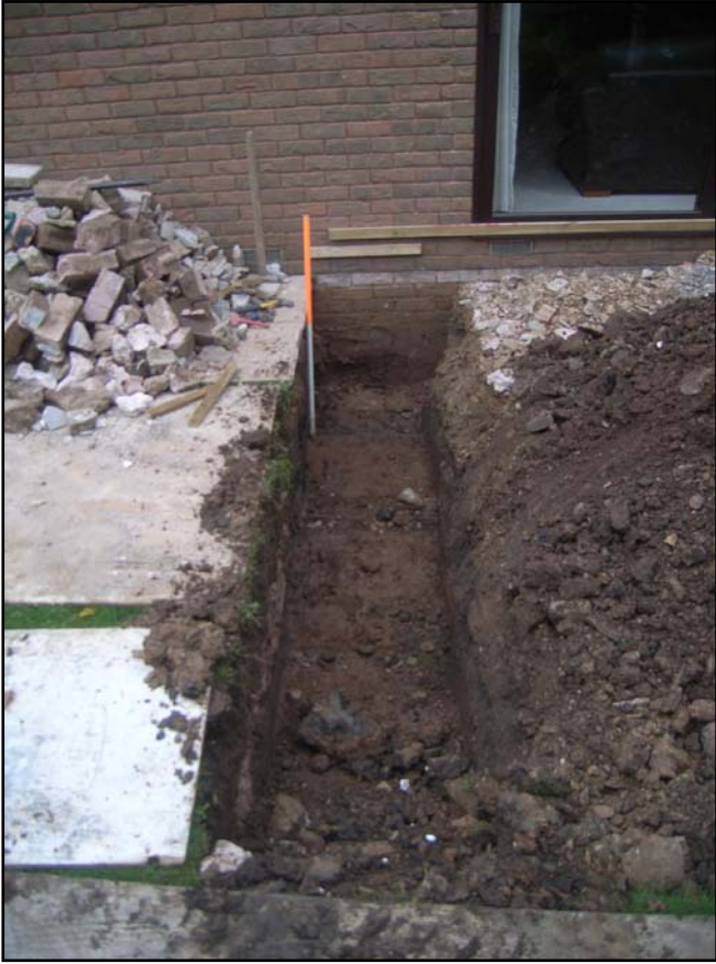
Plate 1 Trench 1A, looking north-west