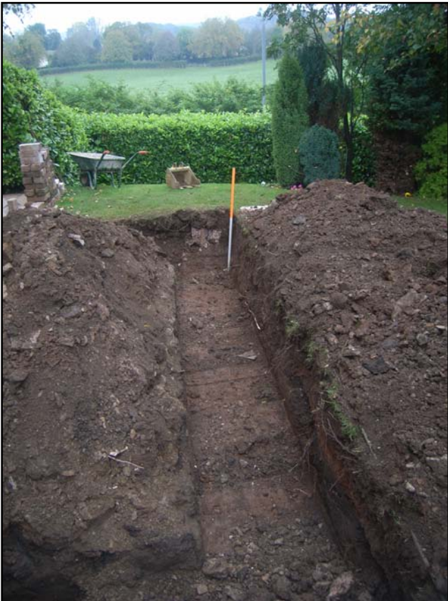
Plate 3 Trench 1 C, looking north-east