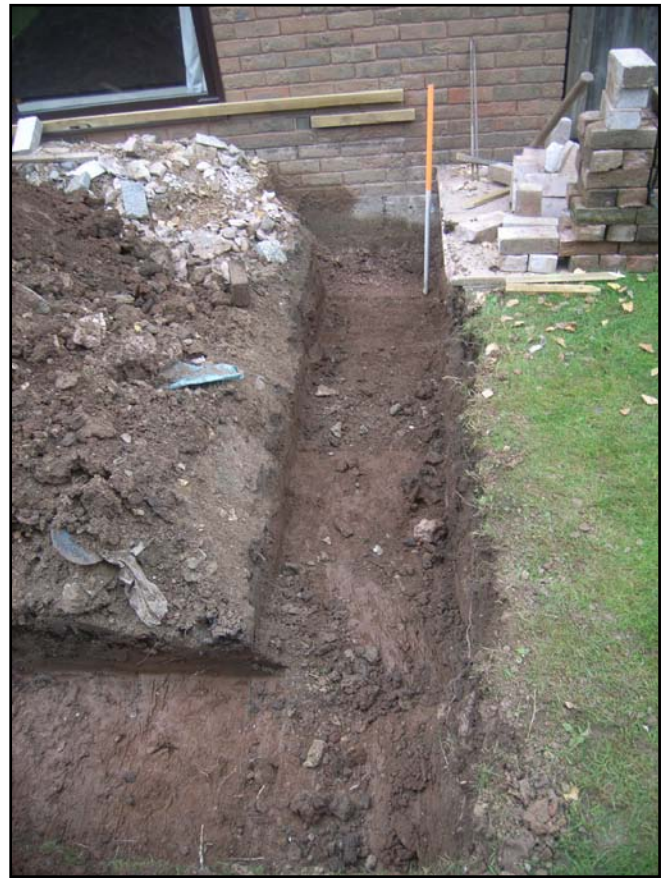
Plate 2 Trench 1B, looking north-west