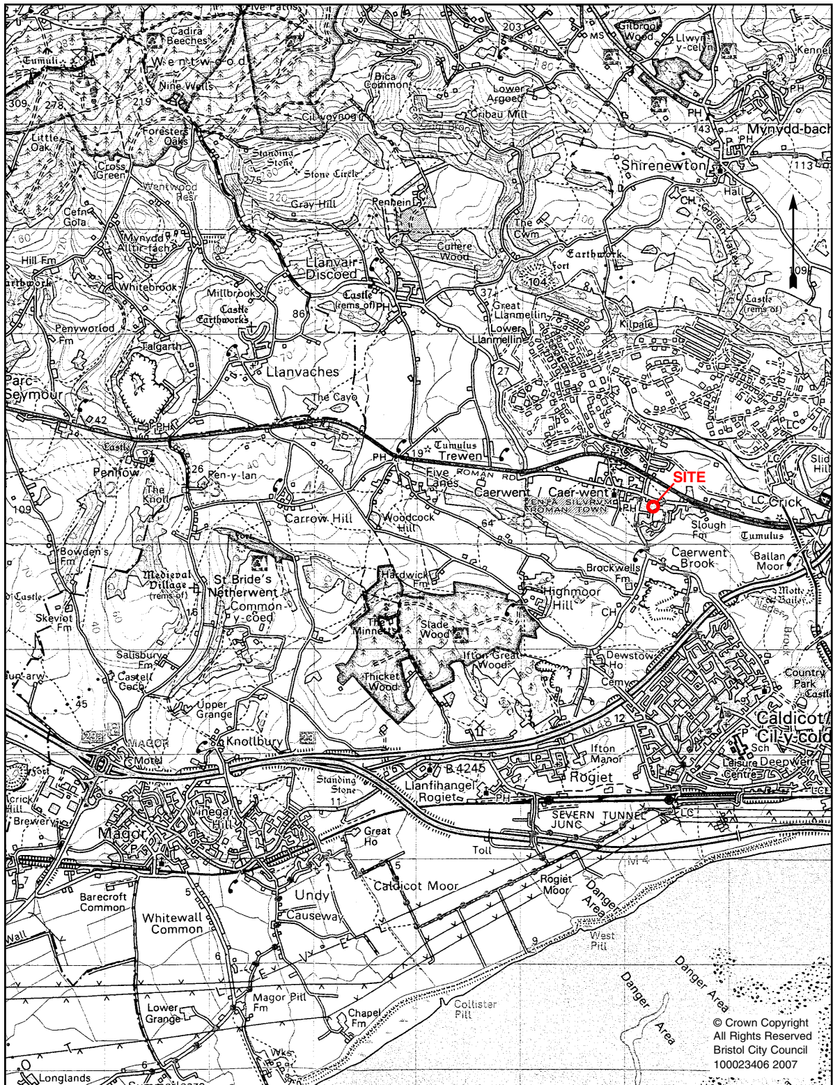
Fig.1 Site location plan, scale 1:50,000