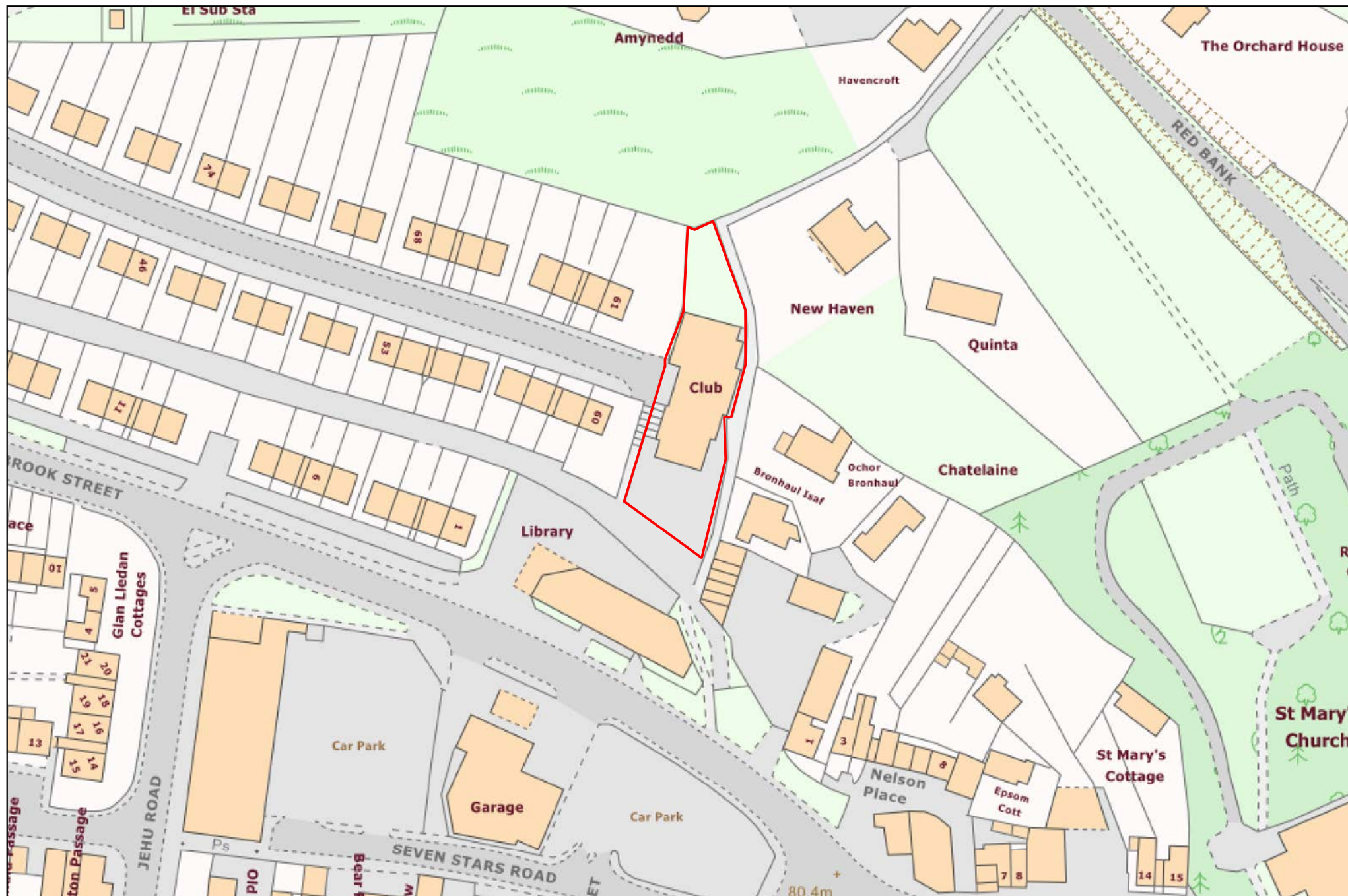
Figure 1. Location plan