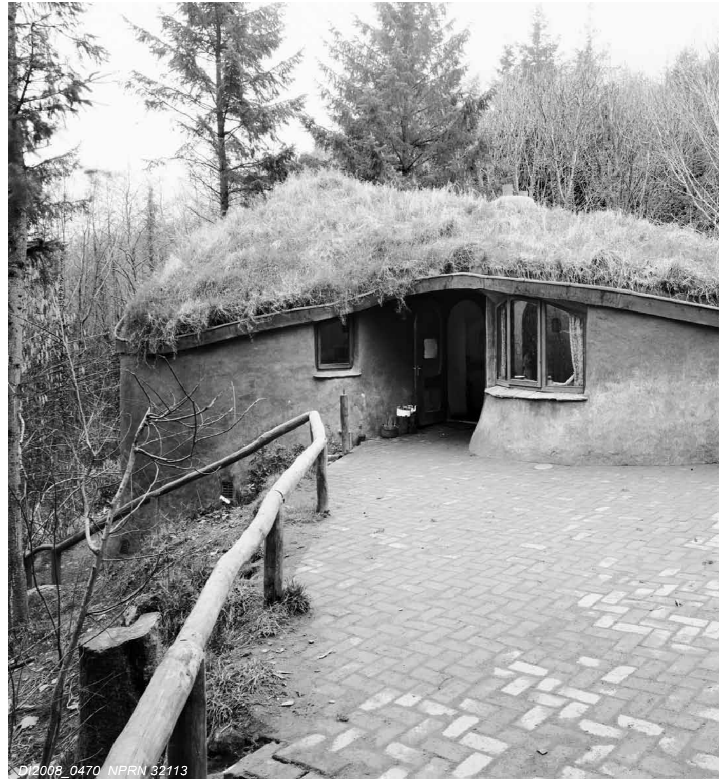
DI2008_0470 NPRN 32113

Above: Malator (Nolton, Pembrokeshire) by Future Systems (1998) is an appealingly contemporary house matching futuristic design with the environmentally friendly.