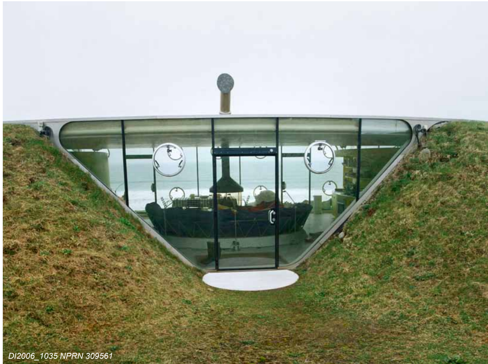
DI2006_1035 NPRN 309561

Understanding the history of Welsh architecture has led to a greater appreciation of the use of vernacular building materials, particularly timber, clay and turf. It coincides today with a growing interest in sustainability and eco-friendly buildings.