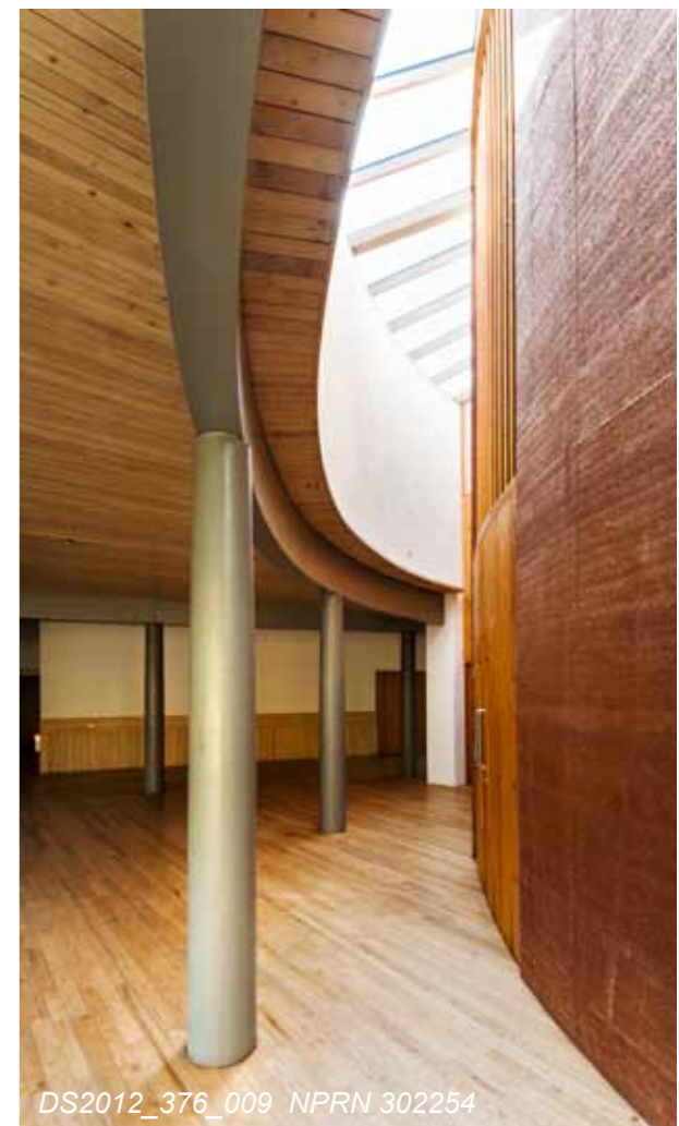
DS2012_376_009 NPRN 302254

Wales has a record of innovative work in sustainability, with the Centre for Alternative Technology (CAT) at Machynlleth playing an important role in developing and demonstrating new approaches since 1997.