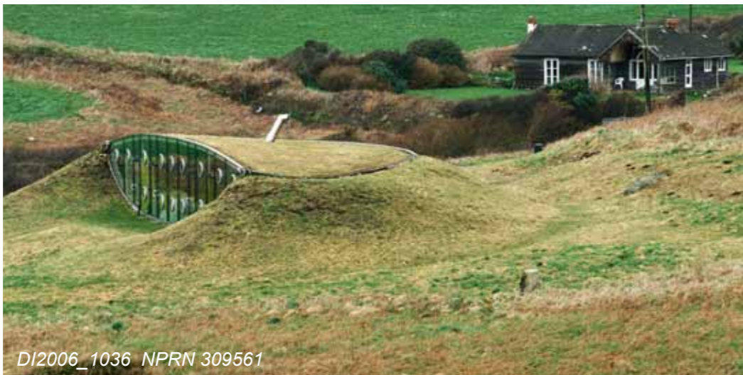
DI2006_1036 NPRN 309561

Uchod: Tŷ deniadol o gyfoes sy'n cyfuno dylunio dyfodolaidd a nodweddion sy'n gyfeillgar i'r amgylchedd yw Malator (Nolton, Sir Benfro) gan Future Systems (1998).