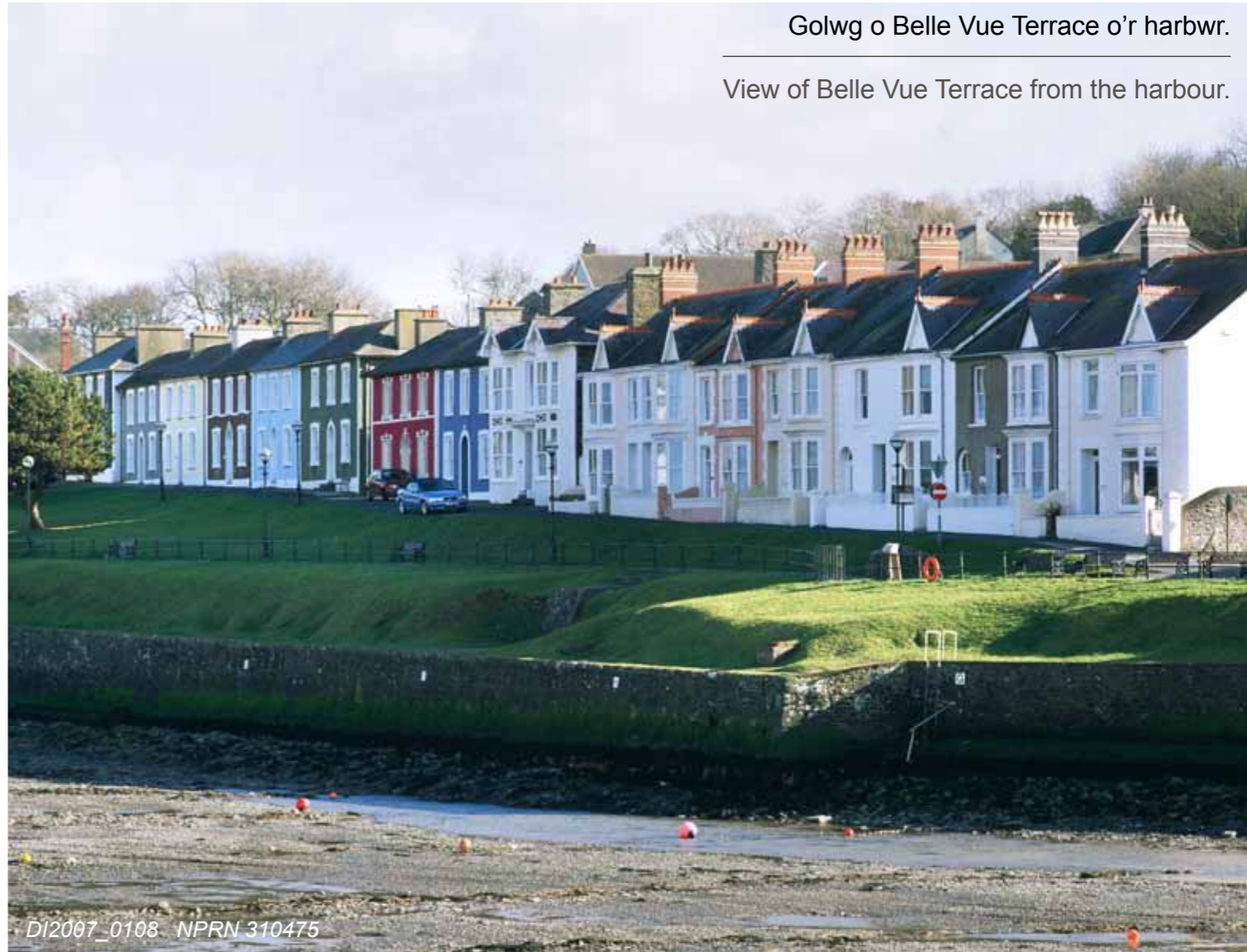
Golwg o Belle Vue Terrace o'r harbwr. View of Belle Vue Terrace from the harbour.