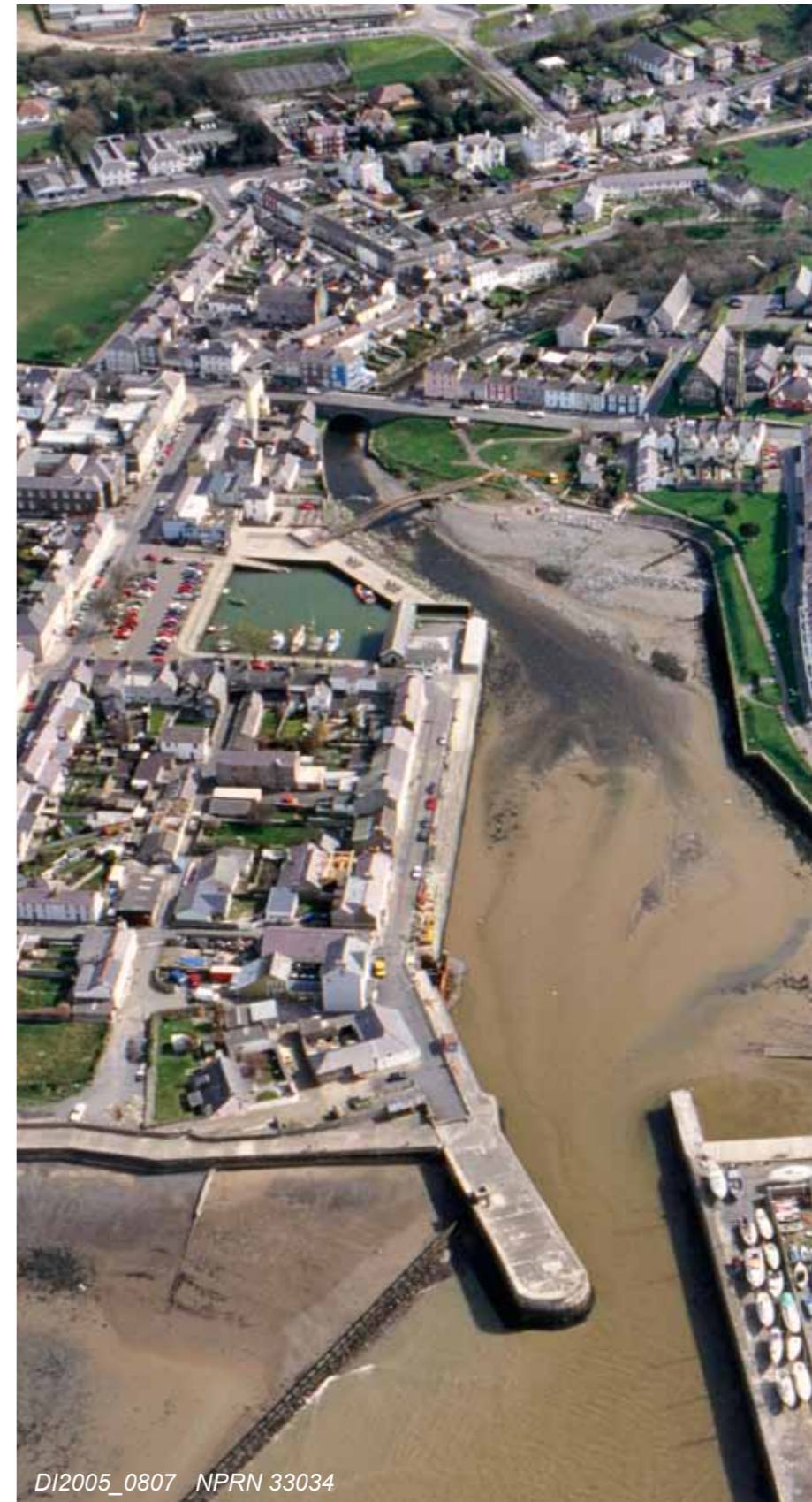
DI2005_0807 NPRN 33034

Left: The brightly painted houses of Aberaeron are a product of post-war enthusiasm for colour and possibly influenced by Portmeirion; previously most houses had a grey render.