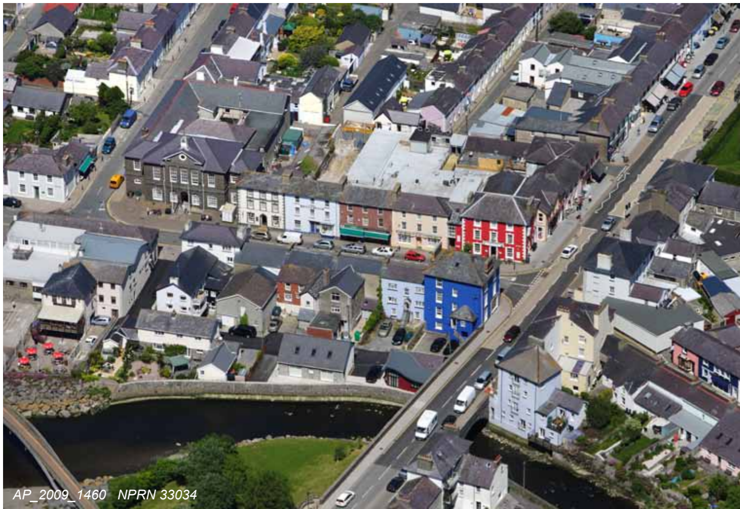
AP_2009_1460 NPRN 33034

John Nash, the most influential Regency architect, discovered the Picturesque during his period in Wales in the 1790s. He is credited - erroneously - with planning Aberaeron. His great contribution to the design of planned settlements were his picturesque estate buildings, which influenced the garden village movement of the early twentieth century.