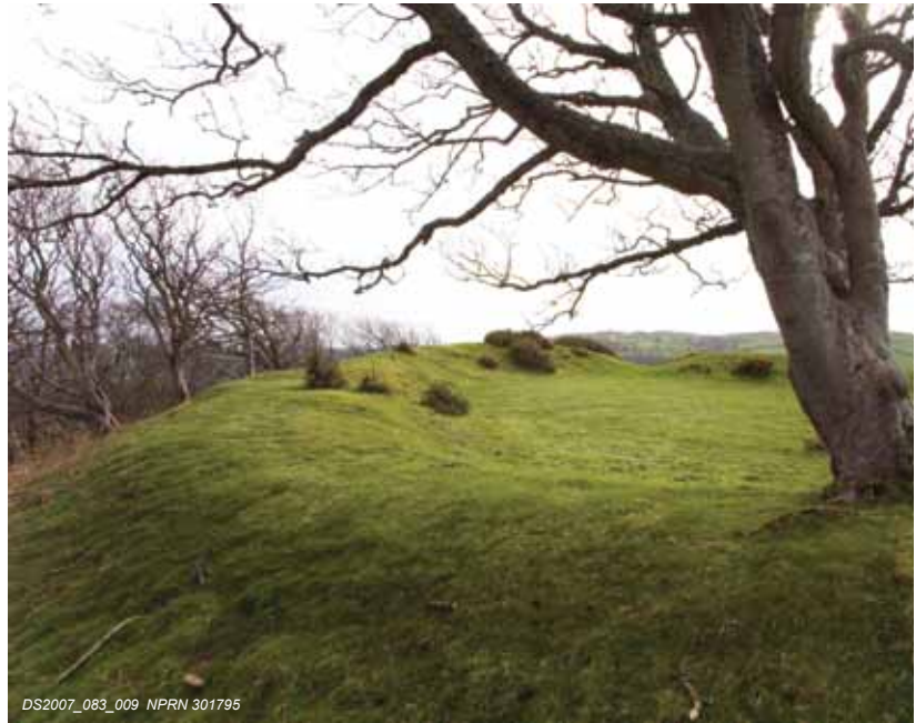
DS2007_083_009 NPRN 301795

Left: Aberystwyth Castle: the North-west Gate.