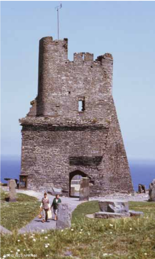
DI2010_0023 NPRN 86

Codwyd y castell cyntaf yn Aberystwyth yn Nhan-y-bwlch, ger aber afon Ystwyth, a hynny gan y Norman, Gilbert de Clare, ym 1110. Cafodd y castell ei ddinistrio a'i ailgodi sawl gwaith rhwng hynny a 1221. Adeiladwyd castell mawr Edward I ar aber afon Rheidol o 1277 ymlaen, gan gael ei ddymchwel i raddau helaeth gan y Senedd ym 1649.