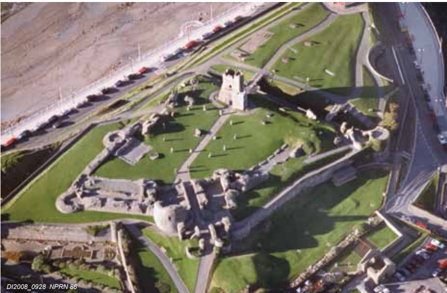
DI2008_0928 NPRN 86

Above: Aberystwyth Castle at Tan-y-bwlch: detail of upper ringwork bank from north.