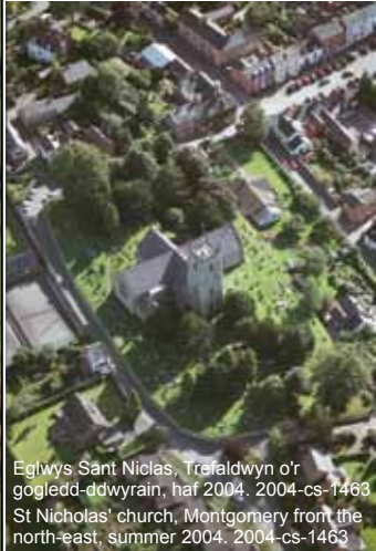
Eglwys Sant Nicolas, Trefaldwyn o'r gogledd-ddwyrain, haf 2004. 2004-cs-1463 St Nicholas' church, Montgomery from the north-east, summer 2004. 2004-cs-1463