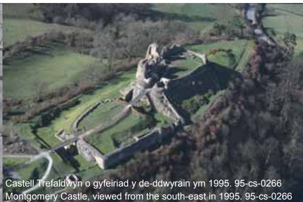
Castell Trefaldwyn o gyfeiriad y de-ddwyrain ym 1995. 95-cs-0266 Montgomery Castle, viewed from the south-east in 1995. 95-cs-0266