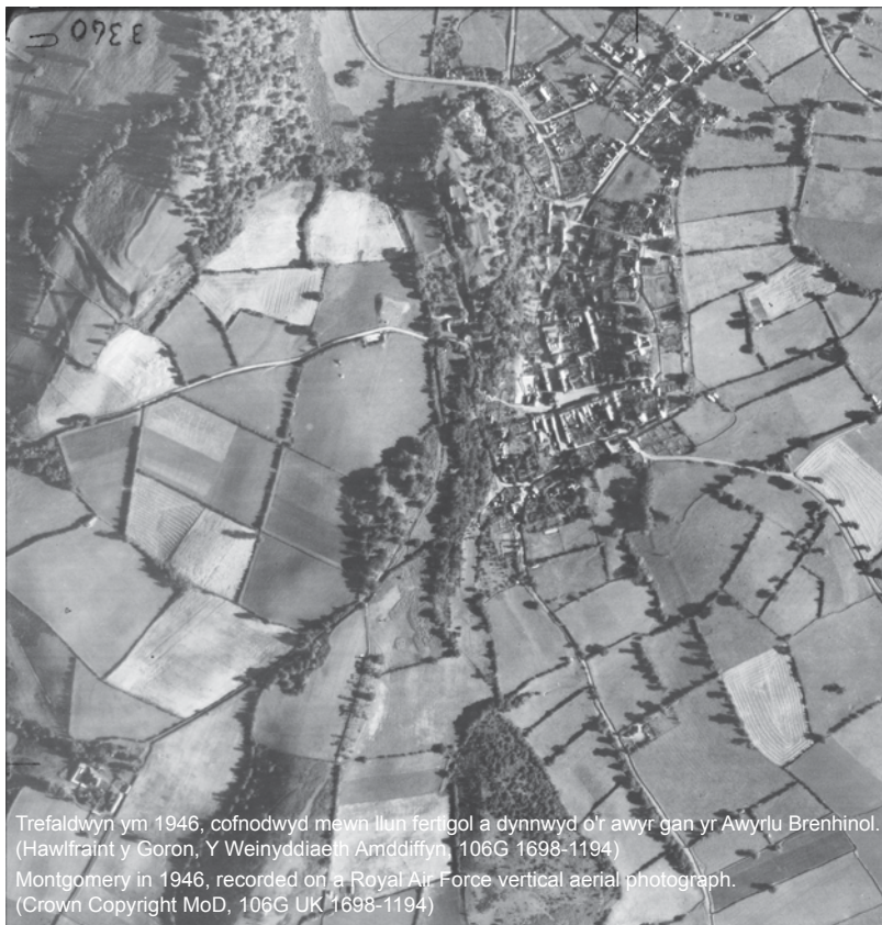
Trefaldwyn ym 1946, cofnodwyd mewn llun fertigol a dynnwyd o'r awyr gan yr Awyrlu Brenhinol. Montgomery in 1946, recorded on a Royal Air Force vertical aerial photograph.