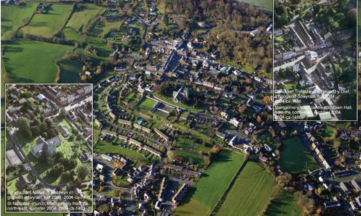
Cano tref Trefaldwyn a Neuadd y Dref, o'r gogledd-ddwyrain, haf 2004. 2004-cs-1466 Montgomery town centre and Town Hall, from the north-east, Summer 2004. 2004-cs-1466