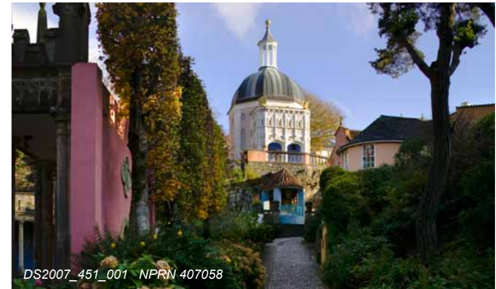
Below. Shape: the Pantheon, or Dome, was built in 1960-61 to remedy what Williams-Ellis described as the village's 'dome deficiency.'