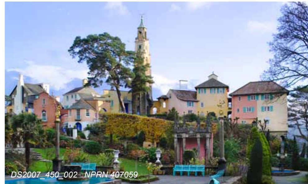
Below. Drama: the Campanile - Clough's opening "dramatic gesture" of 1928.