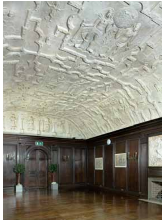
Chwith. Hanes: Neuadd Ercwliff: y nenfwd o'r ail ganrif ar bymtheg a achubwyd o Neuadd Emral, Sir y Fflint.