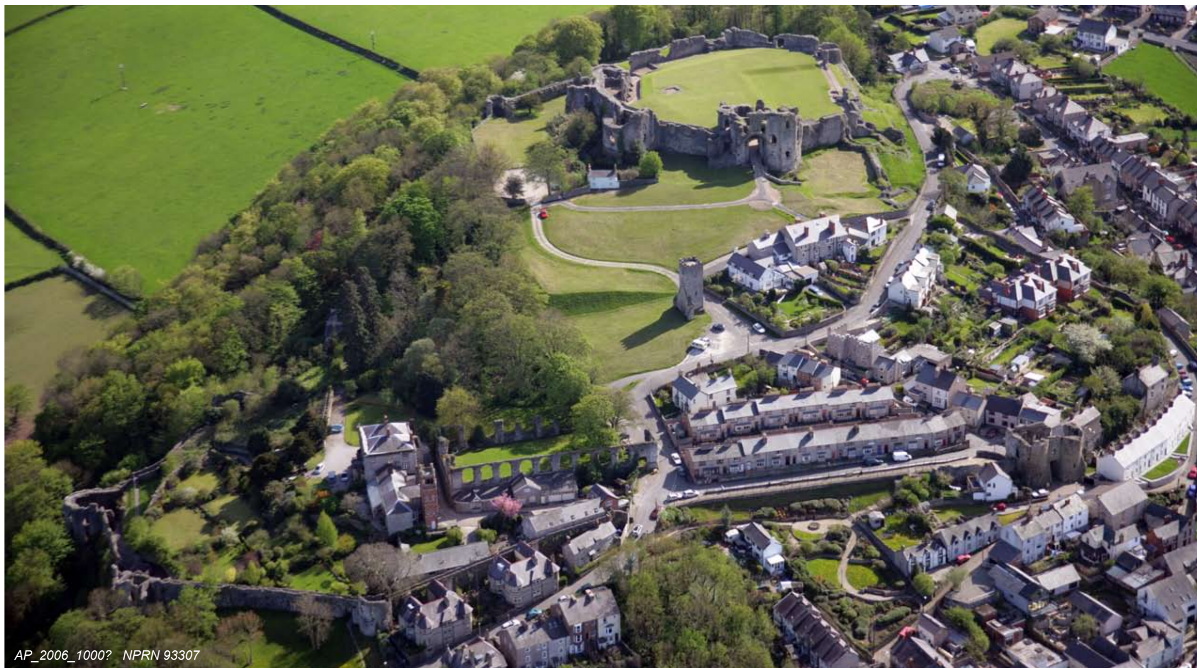
AP_2006_1000? NPRN 93307

Above: Early view of Leicester's Church, Denbigh.