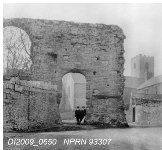
Uchod: Llund cynnar o Eglwys Leicester, Dinbych.

Above: A plan of the church. The church was a hall of 10 bays, with large classical arches separating the aisles from the nave.