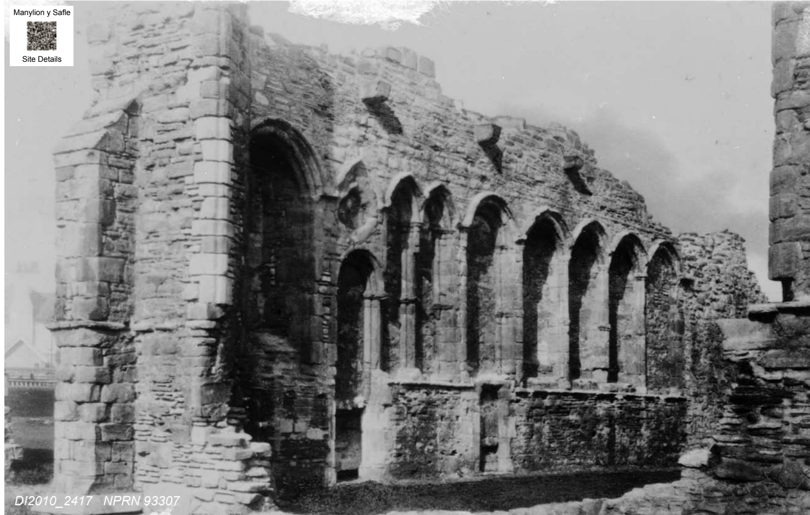
Uchod: Llund a dynnwyd ym 1949 o'r arcêd pengaead ym mhen dwyreiniol Eglwys Leicester.

Above: A view of the blind arcading at the east end of Leicester's Church, taken in 1949.