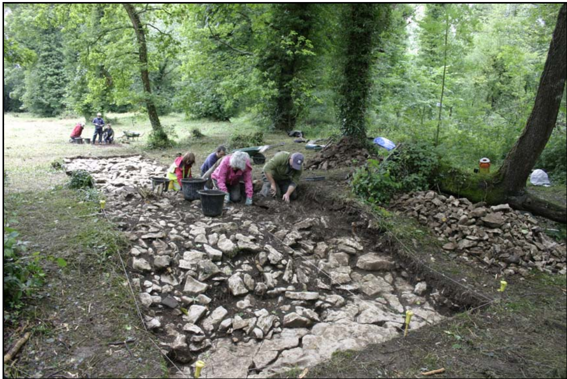
Fig 2 The excavation across the enclosure bank from the south-east. CPAT 3321-0029

Stripping the bank of its thin surface cover of roots and humic material exposed the limestone rubble of the bank which initially appeared to have a core of small stone with larger blocks forming a potential edge on the outside, but less convincingly so on the inner face, and collapsed rubble spreading out on both sides. The bank was then sectioned in a narrower cutting, 1.5m wide, demonstrating that any indications of a wall here were illusory. It resolved itself into a bank of dumped rubble with some evidence of larger lumps of rubble forming the front and back faces, although differentiating these from the collapsed material proved difficult. The section through the bank was not completely excavated, but hopefully it may be possible to return to this in a future year.