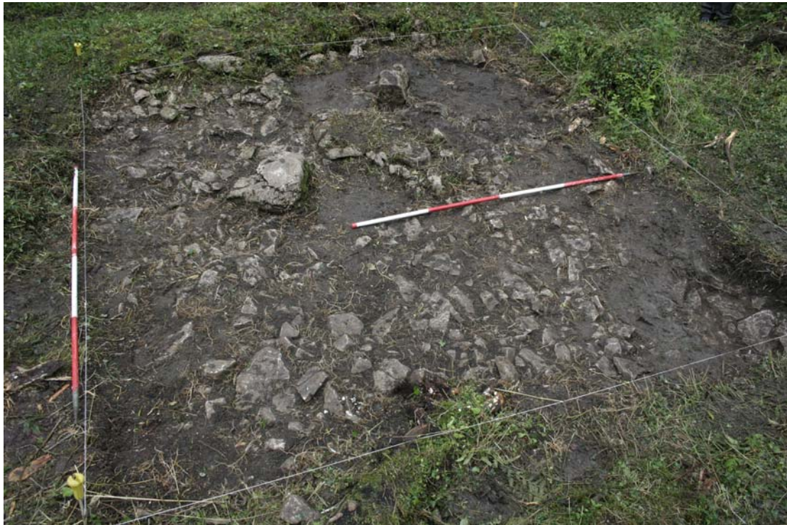
Fig 4 The excavation across the southern end of House 2.

A trench, 4m by 4m, was opened up on the platform where a small patch of limestone rubble projected above the general ground level, on the presumed line of the eastern wall of the building. Removal of the surface layer of humic material and roots exposed a general spread of limestone rubble across the entire area at a depth of around 0.15m below the ground surface. In the north-west corner of the trench, a small sondage 0.4m square was taken to a lower level. This revealed more rubble some of it tipping downwards at a slight angle as if to suggest subsidence into a feature or natural dip. Beneath the stones, but also in places lapping up against them was a red-brown sandy clay which was provisionally identified as a natural subsoil.