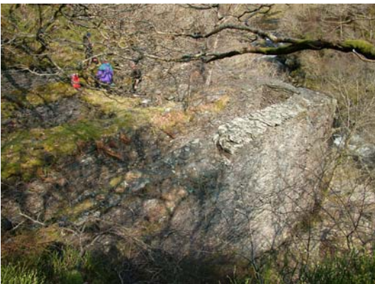
063) 40ft x 4ft wheel-pit – from tramway level