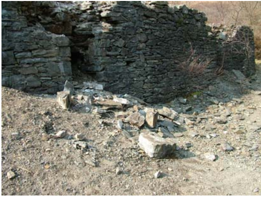
043) Dressing Floors – ore slide