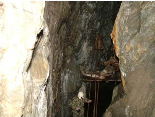
093) Deep Adit - shaft headgear looking west