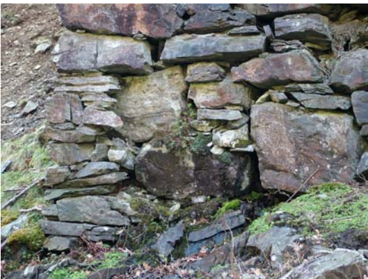
057) 40ft x 4ft wheel-pit – from river level (close up of damaged stone work)