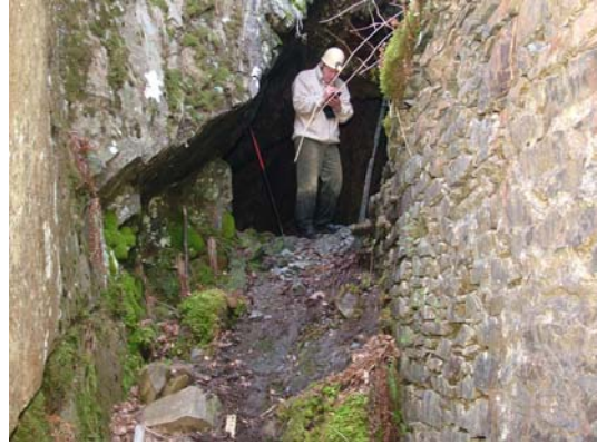
076) Deep Adit - entrance