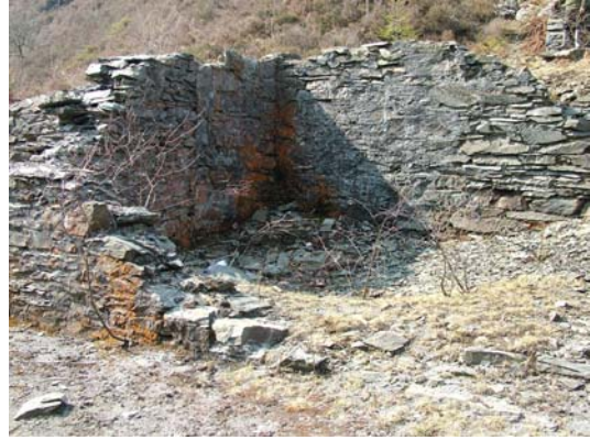
040) Dressing Floor – Crushing Mill