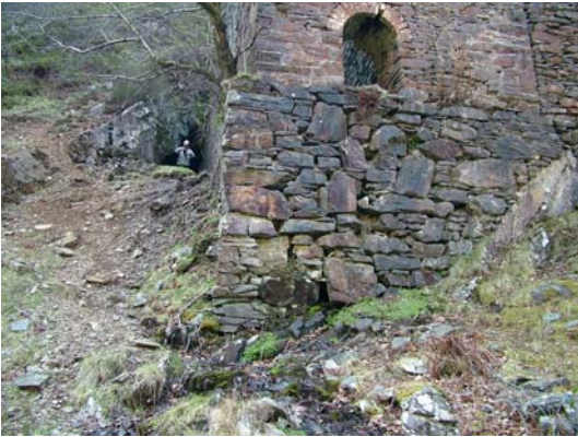
049) 40ft x 4ft wheel-pit – from river level, Deep Adit entrance on left