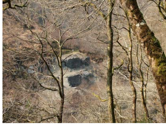
106) –Temple Mine viewed from top of path from Ysbyty Cynfyn