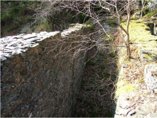
068) 40ft x 4ft wheel-pit – from tramway level (wheel compartment looking west)