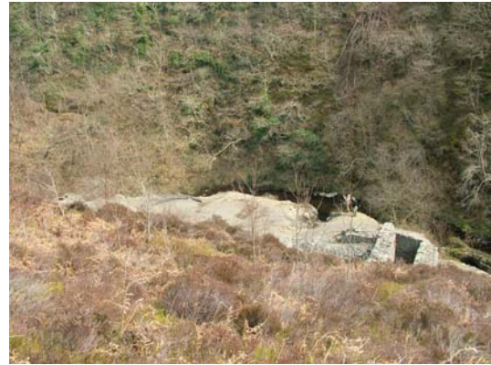
004) Dressing Floor - from above