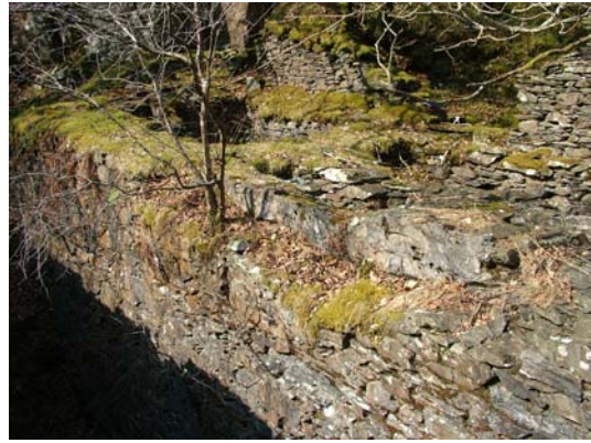
070) 40ft x 4ft wheel-pit – equipment compartments from south east corner