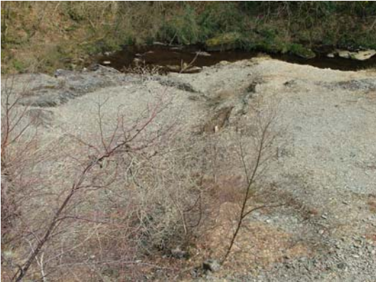
020) Dressing Floor – location of wooden launder (centre of photograph)