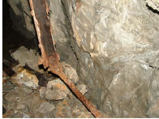
088) Deep Adit – pump-rod angle piece