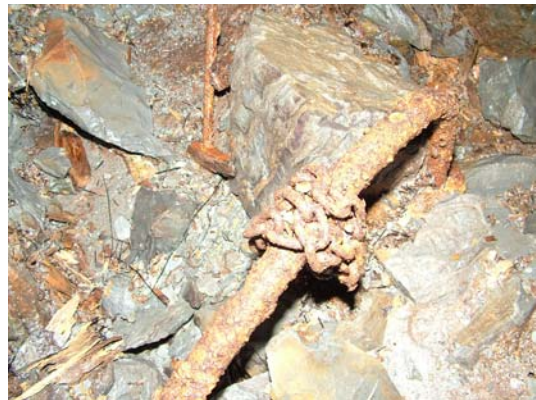
101) Deep Adit – remains on floor