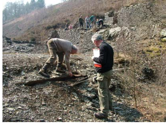
022) Dressing Floor – wooden launder