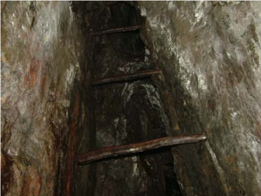
104) Deep Adit – Stopes above shaft looking east