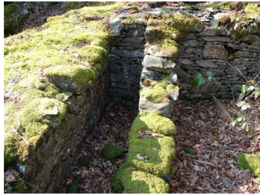
072) 40ft x 4ft wheel-pit – gearing pit on left, drum pit on right