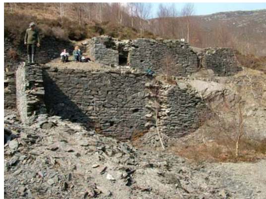
042) Dressing Floors – Ore slide