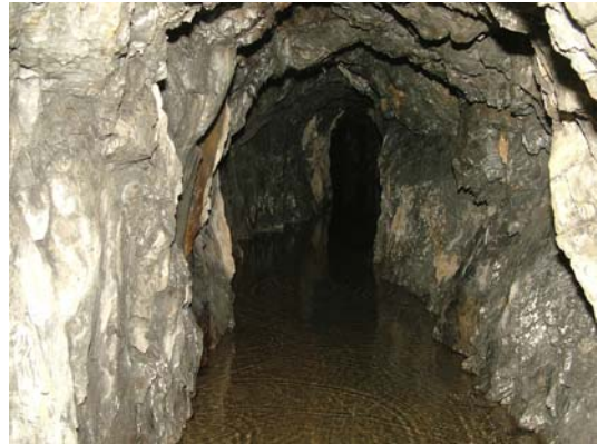
082) Deep Adit – flooded passage (looking west)