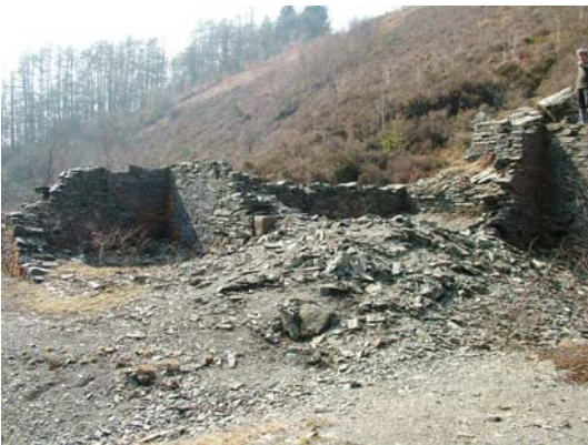
039) Dressing Floor – Crushing Mill