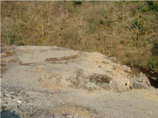
014) Dressing Floor – 14ft x 2ft wheel-pit