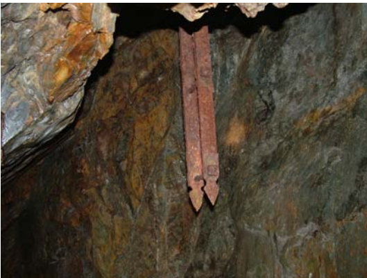
080) Deep Adit – pump-rod support