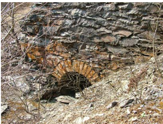
033) Dressing Floor – 30ft x 4ft wheel-pit (close up detail of drain arch)