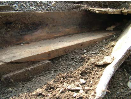
027) Dressing Floor – wooden launder