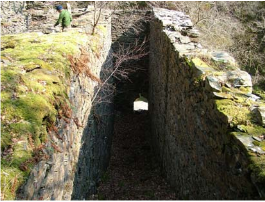
067) 40ft x 4ft wheel-pit – wheel compartment looking east