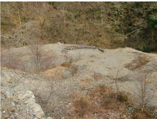
009) Dressing Floor - looking north, rock-cut buddle in centre