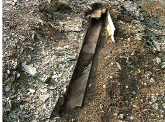
023) Dressing Floor – wooden launder