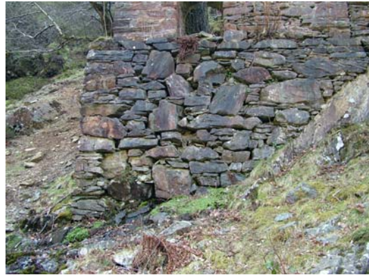
052) 40ft x 4ft wheel-pit – from river level (close up of damaged stone work)