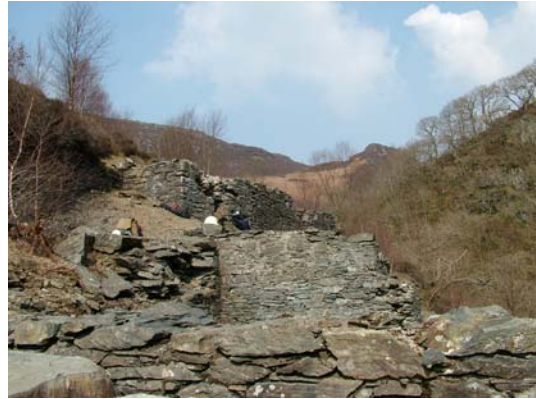
041) Dressing Floor – looking north towards ore bins from 30ft wheel-pit