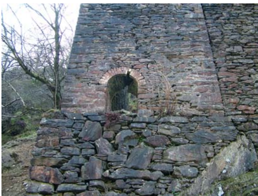
045) 40ft x 4ft wheel-pit – from river level