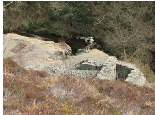
005) Dressing Floor - from above