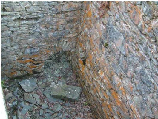
032) Dressing Floor – 30ft x 4ft wheel-pit (detail of drain arch)