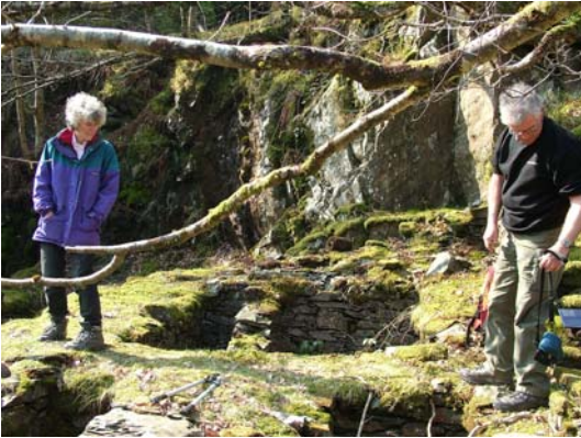
074) 40ft x 4ft wheel-pit gearing pit on left, drum pit on right