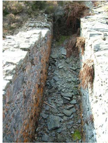
034) Dressing Floor – 30ft x 4ft wheel-pit (looking west)