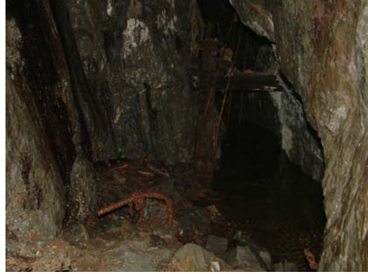
094) Deep Adit - shaft headgear looking east