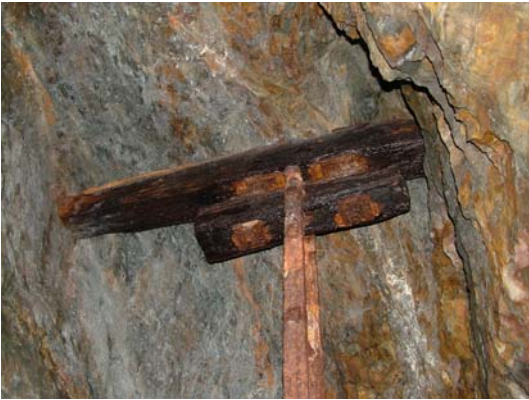
079) Deep Adit – pump-rod support