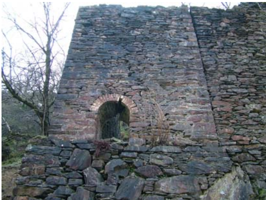
044) 40ft x 4ft wheel-pit – from river level