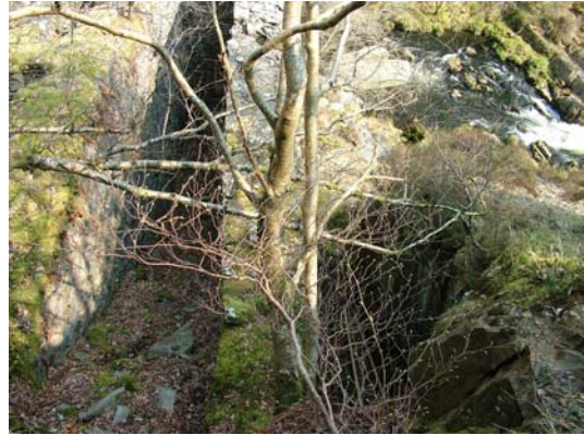
065) 40ft x 4ft wheel-pit – from tramway level (Deep Adit entrance to right)