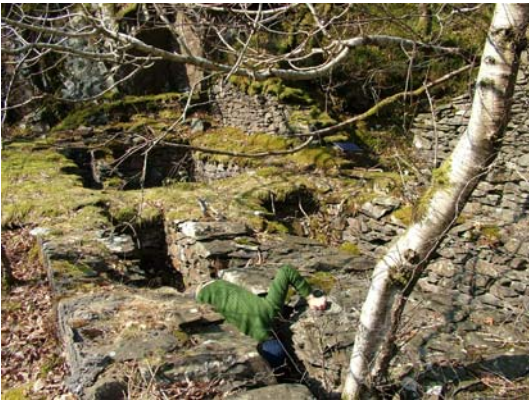
069) 40ft x 4ft wheel-pit –equipment compartments from south east corner