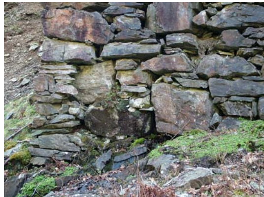
053) 40ft x 4ft wheel-pit – from river level (close up of damaged stone work)