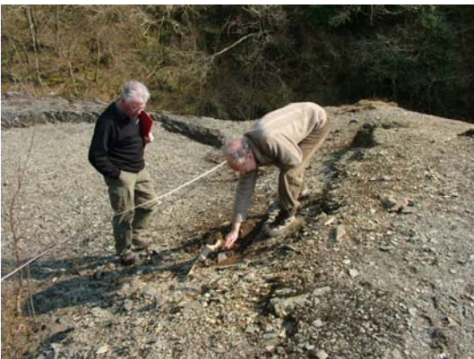
021) Dressing Floor – wooden launder