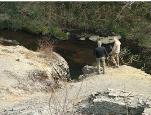
015) Dressing Floor – 14ft x 2ft wheel-pit