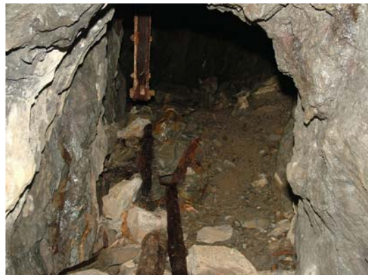
084) Deep Adit – looking into shaft chamber (west)