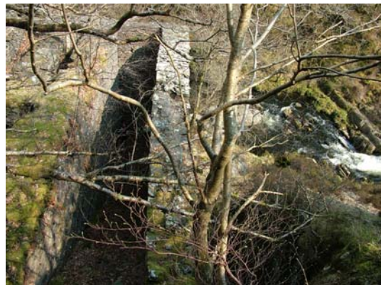
066) 40ft x 4ft wheel-pit – from tramway level