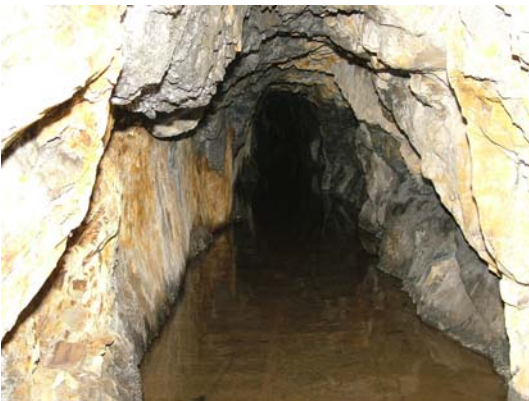
081) Deep Adit – flooded passage (looking west)