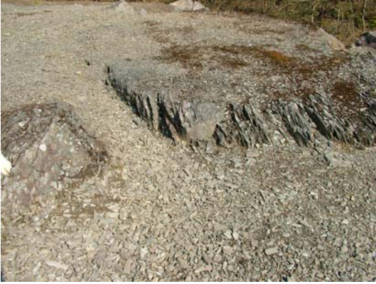
013) Dressing Floor- rock-cut buddle