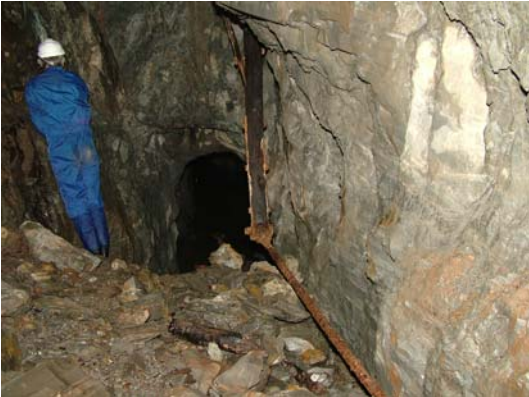
086) Deep Adit - shaft chamber looking west, pump-rod on right