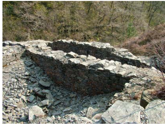
030) Dressing Floor – 30ft x 4ft wheel-pit (looking south)