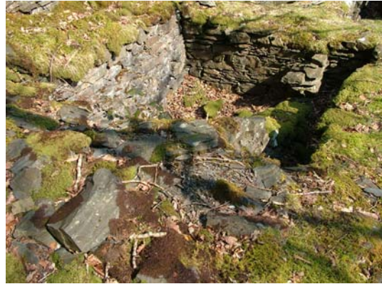
071) 40ft x 4ft wheel-pit – drum pit on left, gearing pit on right