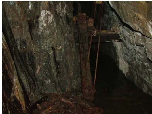
096) Deep Adit - shaft headgear looking east