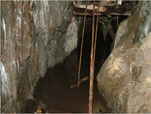
092) Deep Adit - shaft headgear looking west