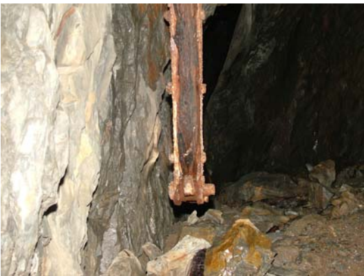
087) Deep Adit – pump-rod angle piece