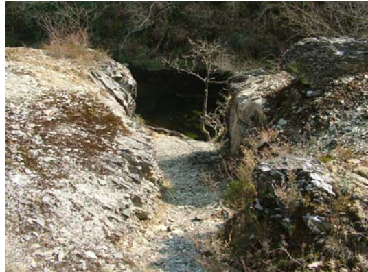
017) Dressing Floor – 14ft x 2ft wheel-pit