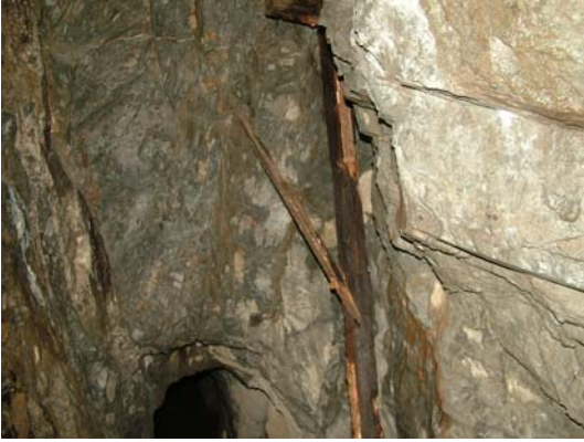
091) Deep Adit - pump-rod upright