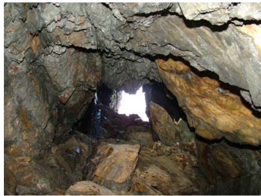
078) Deep Adit – entrance, looking out (east)