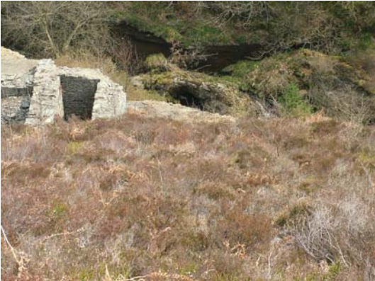
008) 30ft x 4ft wheel-pit and base of incline (on the right hand side)