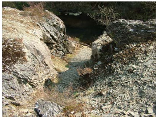
018) Dressing Floor – 14ft x 2ft wheel-pit