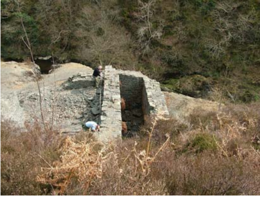
007) Dressing Floor - from above