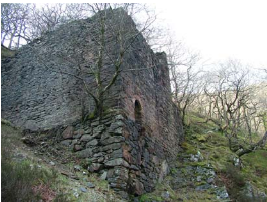
051) 40ft x 4ft wheel-pit – from river level