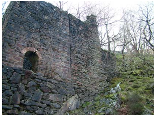
047) 40ft x 4ft wheel-pit – from river level