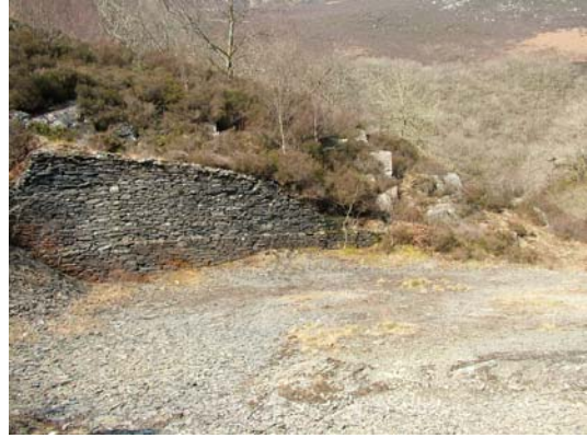
010) Dressing Floor – wall at north west corner