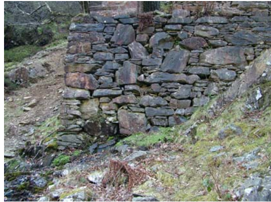
058) 40ft x 4ft wheel-pit – from river level (close up of damaged stone work)