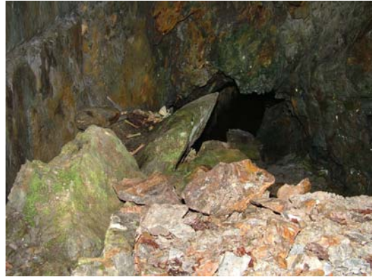
077) Deep Adit – entrance, looking in (west)