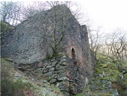
050) 40ft x 4ft wheel-pit – from river level