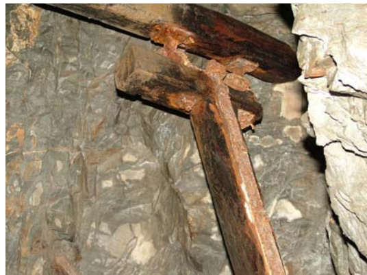
090) Deep Adit – pump-rod upright