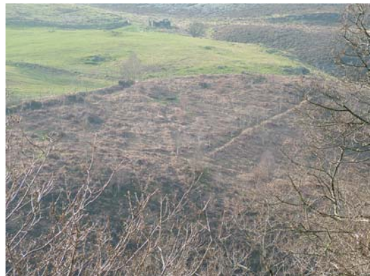
108) Temple Mine – inclined tramway route (centre) viewed from path from Ysbyty Cynfyn