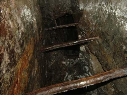
103) Deep Adit – Stopes above shaft looking east