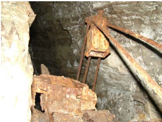
098) Deep Adit – shaft headgear (close up) looking east