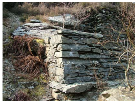
036) Dressing Floor – probable plinth for Blake's Stone Breaker (at west end of wheel-pit)