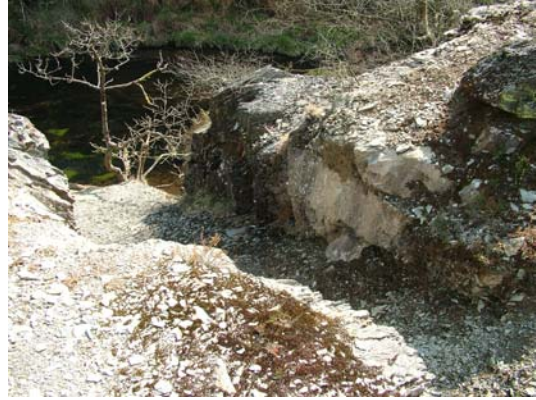
016) Dressing Floor – 14ft x 2ft wheel-pit