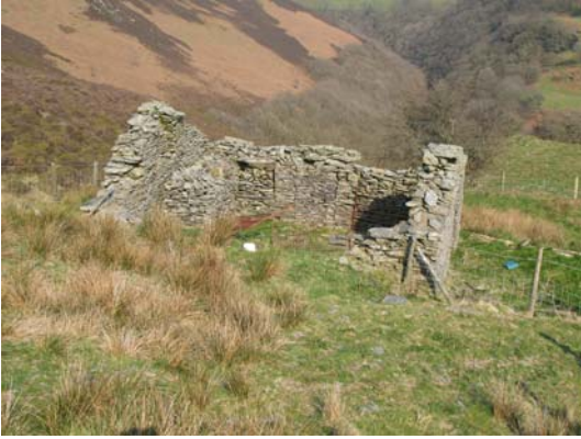
109) Blacksmith's building in field at top of inclined tramway