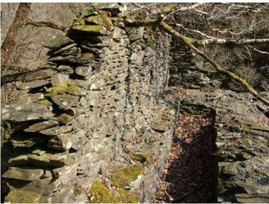
075) 40ft x 4ft wheel-pit – north east corner, compressor mounting base on right