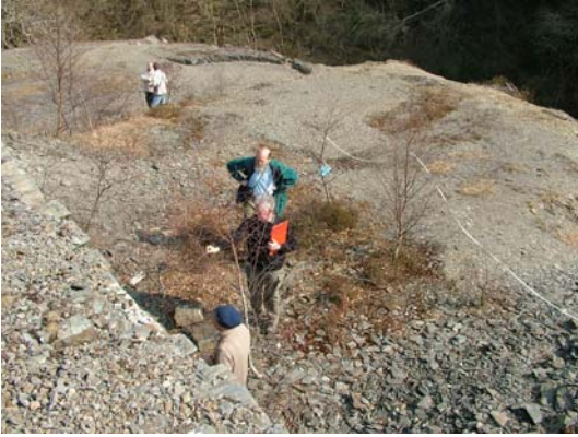
019) Dressing Floor – Survey in progress