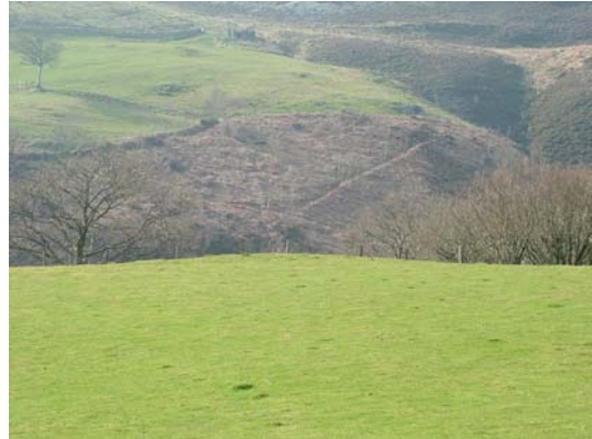
107) Temple Mine – inclined tramway route (centre) viewed from path from Ysbyty Cynfyn