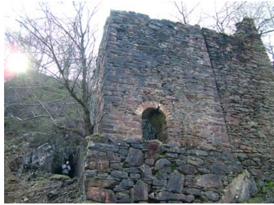
046) 40ft x 4ft wheel-pit – from river level, Deep Adit entrance on left