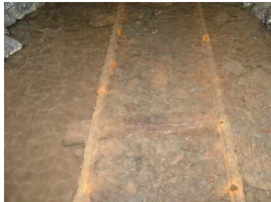
083) Deep Adit – tramway rails in situ (looking west)