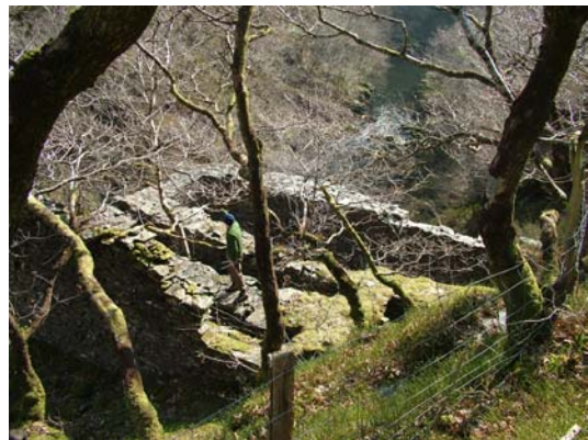
060) 40ft x 4ft wheel-pit – from tramway level