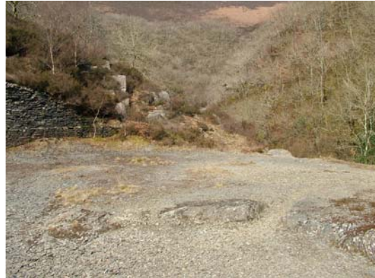
011) Dressing Floor – site of un-located buddle