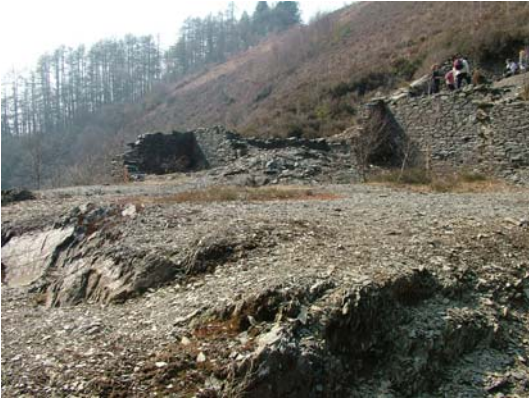
038) Dressing Floor – looking south towards Crushing Mill