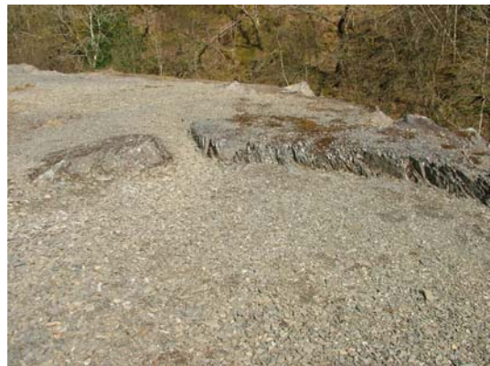
012) Dressing Floor- rock-cut buddle