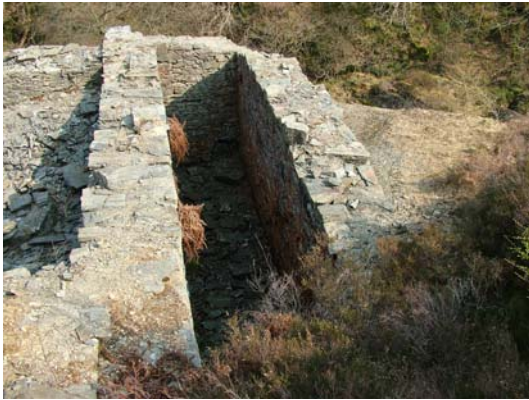
031) Dressing Floor – 30ft x 4ft wheel-pit (looking east towards drain arch)