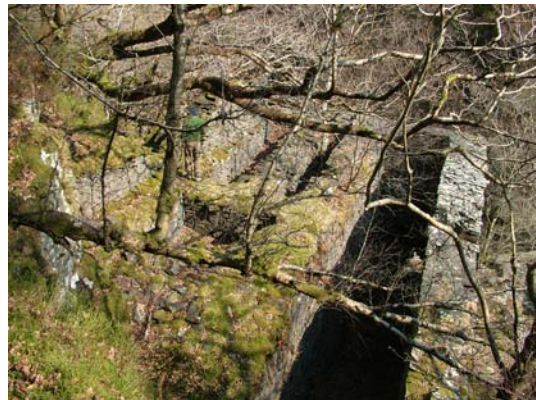
059) 40ft x 4ft wheel-pit – from tramway level