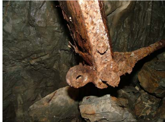
089) Deep Adit – pump-rod angle piece