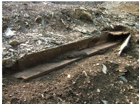
024) Dressing Floor – wooden launder