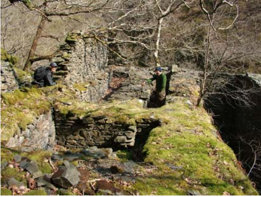
061) 40ft x 4ft wheel-pit – from tramway level