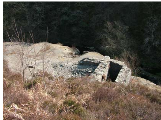
006) Dressing Floor - from above