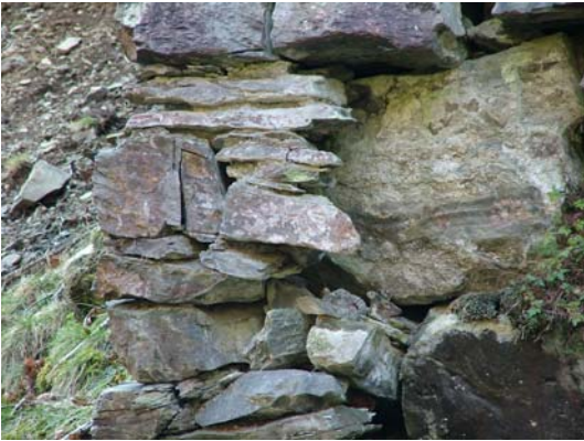
055) 40ft x 4ft wheel-pit – from river level (close up of damaged stone work)