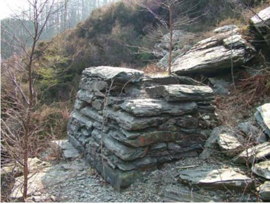
037) Dressing Floor – probable plinth for Blake's Stone Breaker (at west end of wheel-pit)