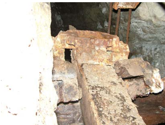
099) Deep Adit – shaft headgear (close up) looking east