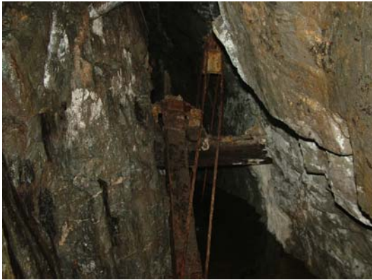
097) Deep Adit – shaft headgear looking east