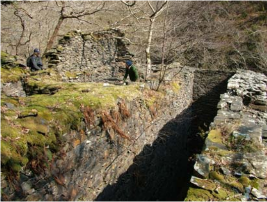
062) 40ft x 4ft wheel-pit – from tramway level