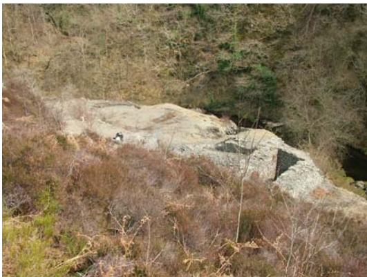
003) Dressing Floor - from above