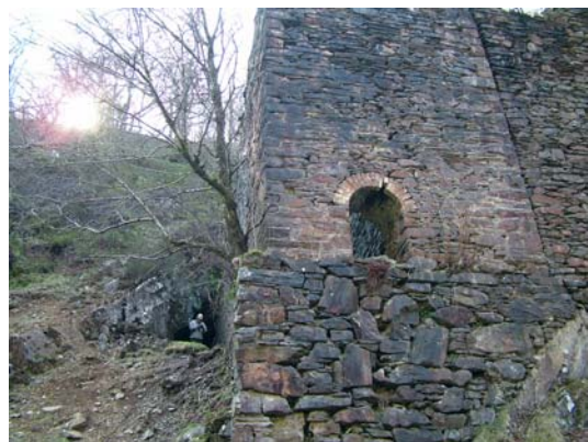
048) 40ft x 4ft wheel-pit – from river level, Deep Adit entrance on left