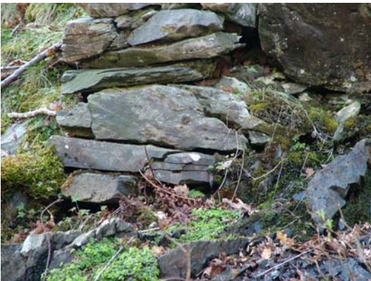
056) 40ft x 4ft wheel-pit – from river level (close up of damaged stone work)