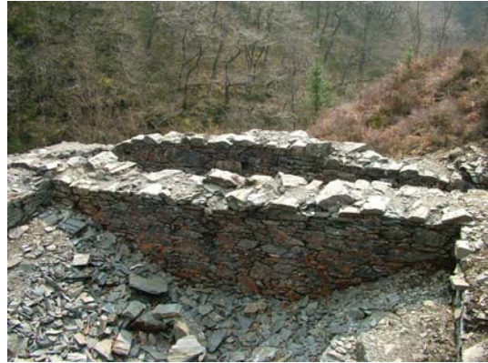
029) Dressing Floor – 30ft x 4ft wheel-pit (looking south)