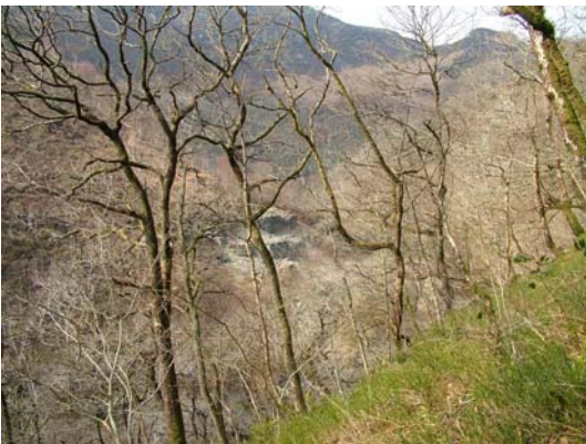
105) –Temple Mine viewed from top of path from Ysbyty Cynfyn