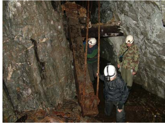
095) Deep Adit - shaft headgear looking east