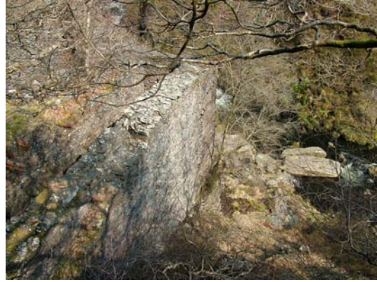
064) 40ft x 4ft wheel-pit – from tramway level