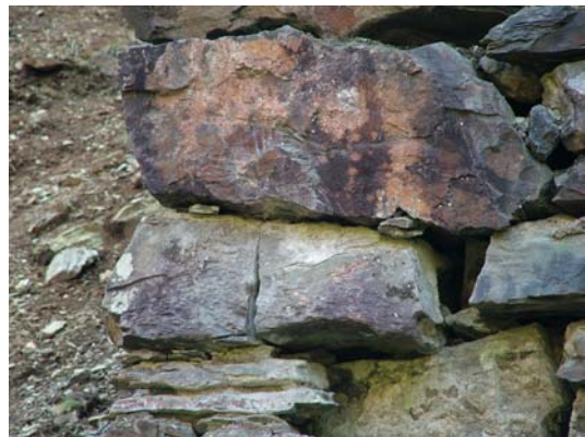
054) 40ft x 4ft wheel-pit – from river level (close up of damaged stone work)