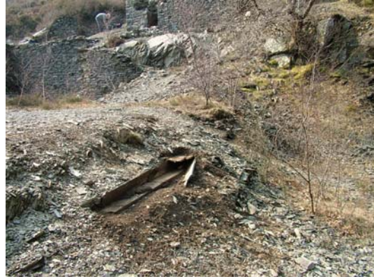
028) Dressing Floor – wooden launder