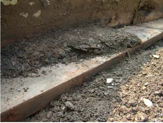
025) Dressing Floor – wooden launder