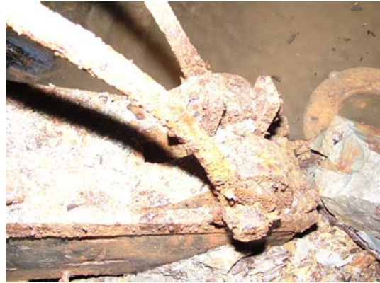
100) Deep Adit – shaft headgear (close up), rising main on right