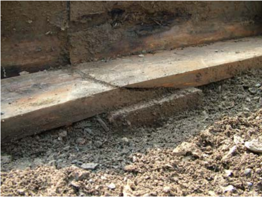
026) Dressing Floor – wooden launder