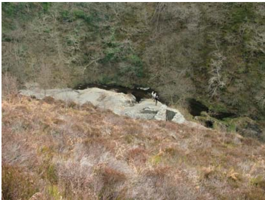
002) Dressing Floor - from above