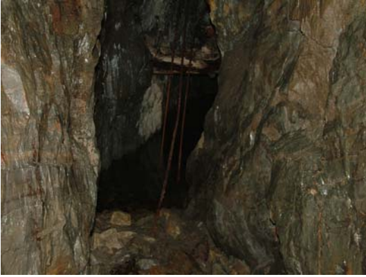
085) Deep Adit – shaft chamber looking west