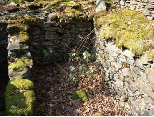
073) 40ft x 4ft wheel-pit drum pit