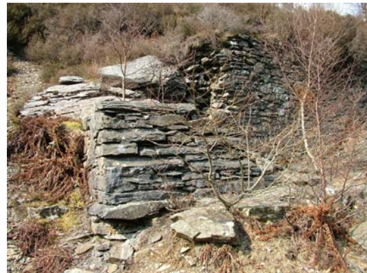
035) Dressing Floor – probable plinth for Blake's Stone Breaker (at west end of wheel-pit)