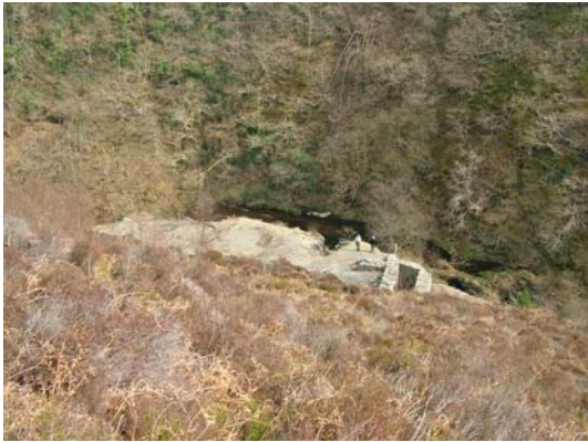
001) Dressing Floor - from above

31 st March / 1 st April 2007