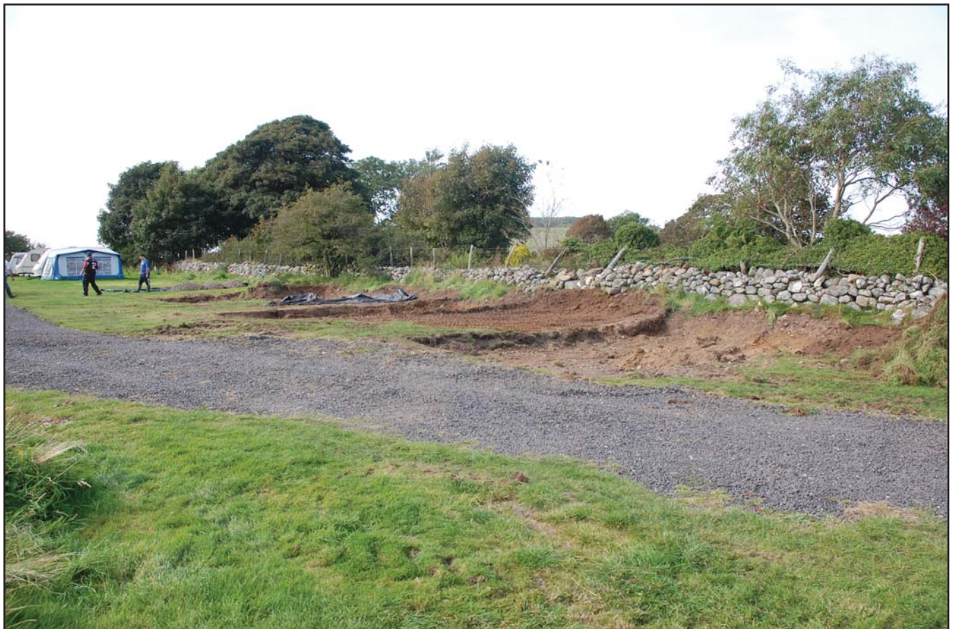
Plate 08 - General post excavation shot of the site from the south-east