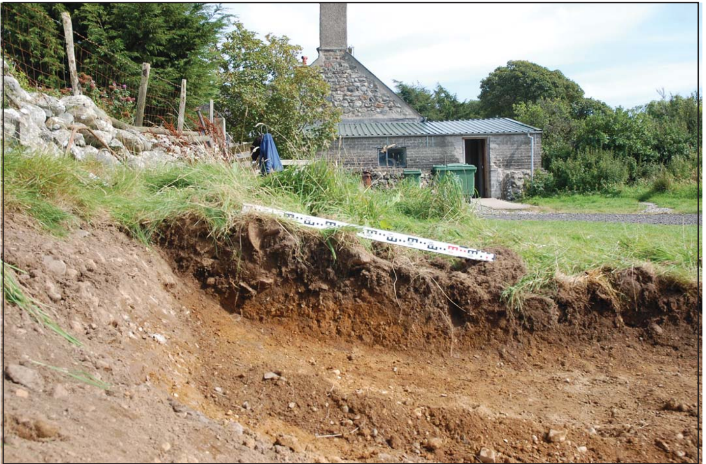
Plate 07 - West facing section through the bank, trench 4