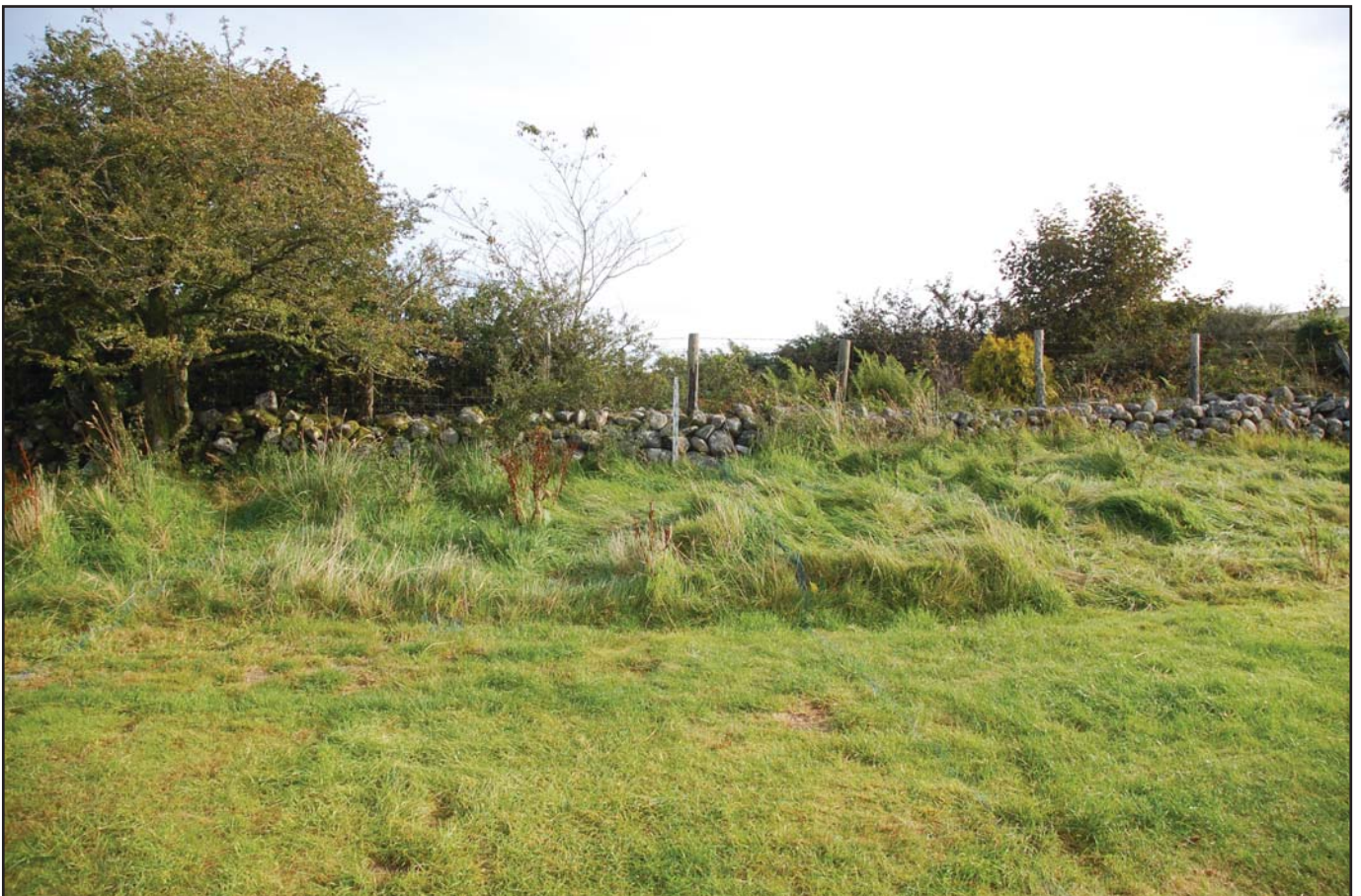
Plate 02 - View from the south showing detail of the middle section of the bank