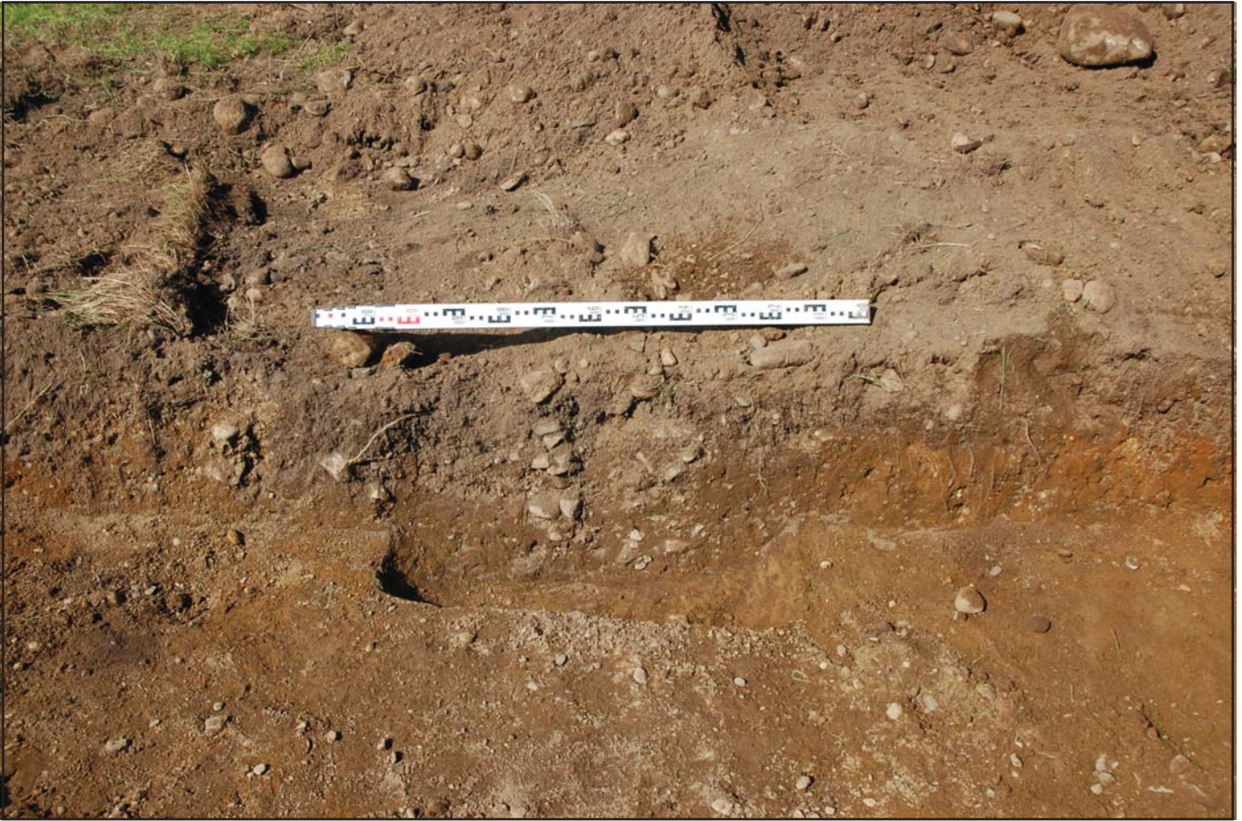
Plate 06 - East facing section in trench 3 showing an investigative slot through ditch [006].