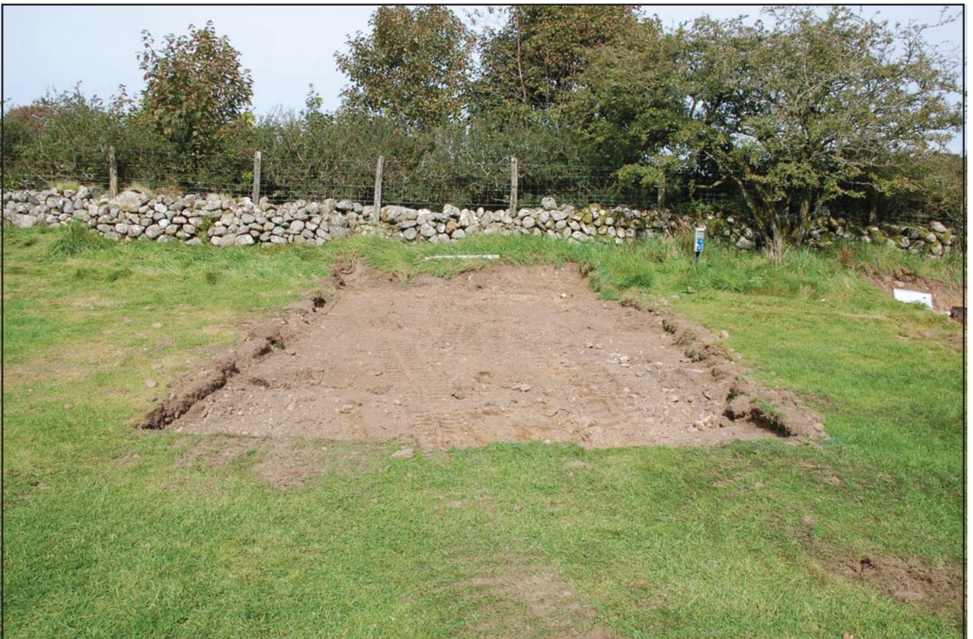
Plate 04 - Trench 1 post excavation. View from the south