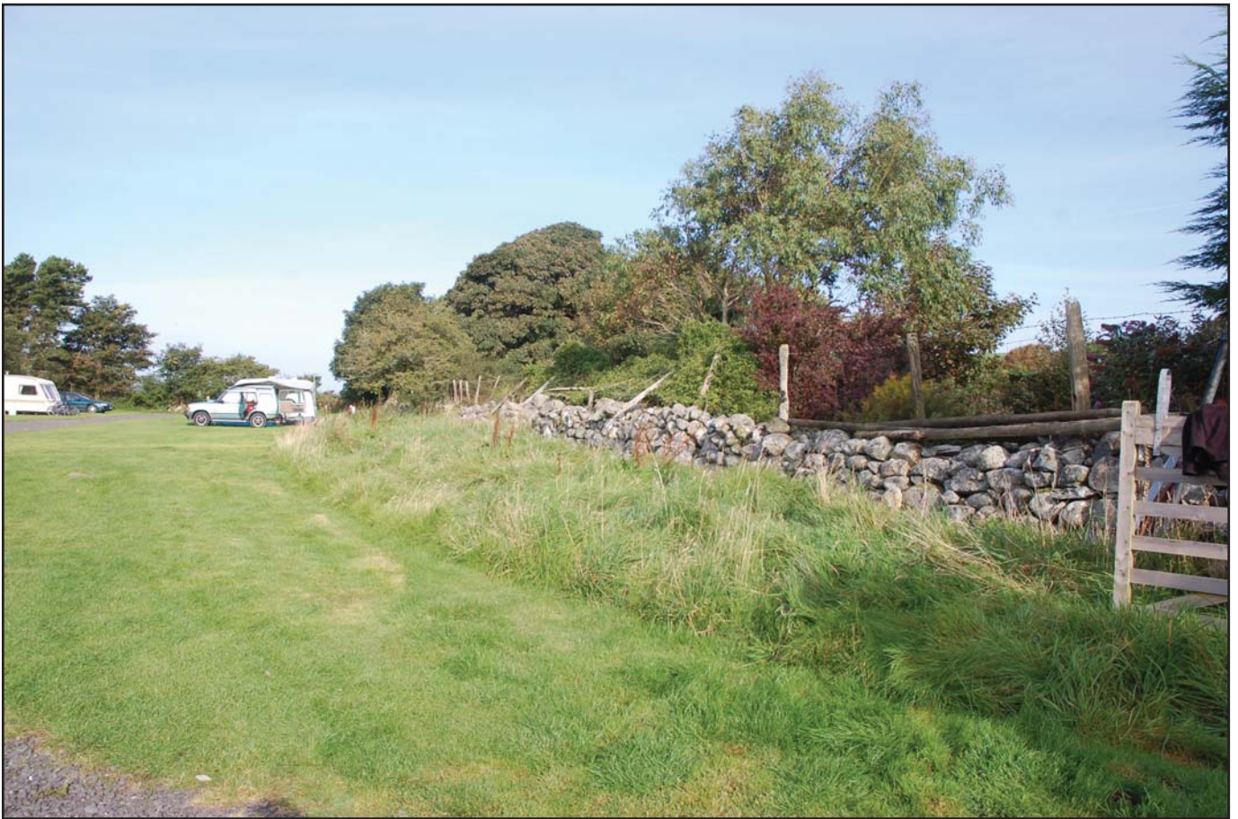
Plate 01 - View from the north east showing the bank prior to excavation