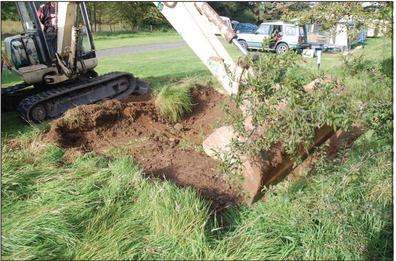
Plate 03 - Excavation of trench 1. View from the north-east.