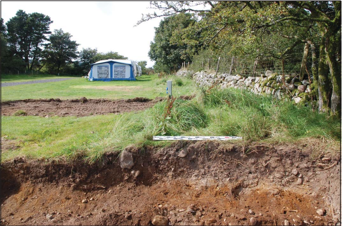
Plate 05 - East Facing section in Trench 2 showing the concentration of stone in the bank (005).