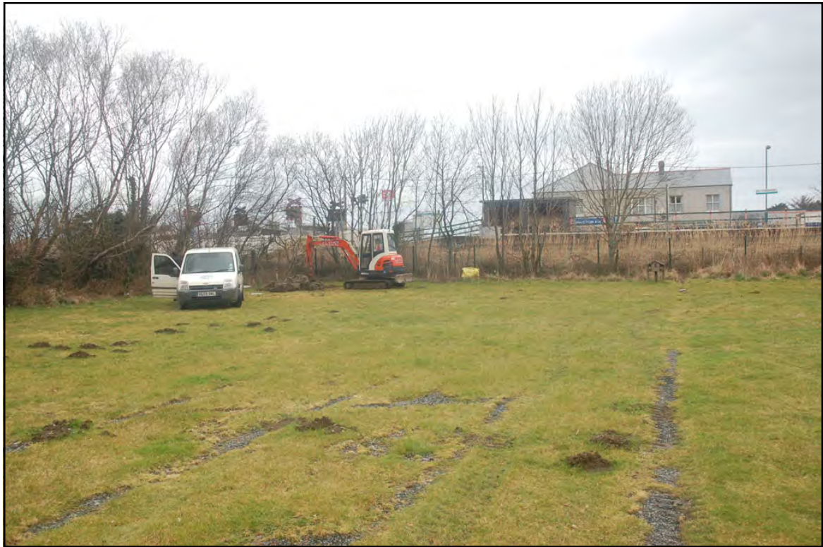
Plate 09 - test pit 10. Located on the southeastern outskirts of Fairbourne within a small caravan park, close to the former railway line