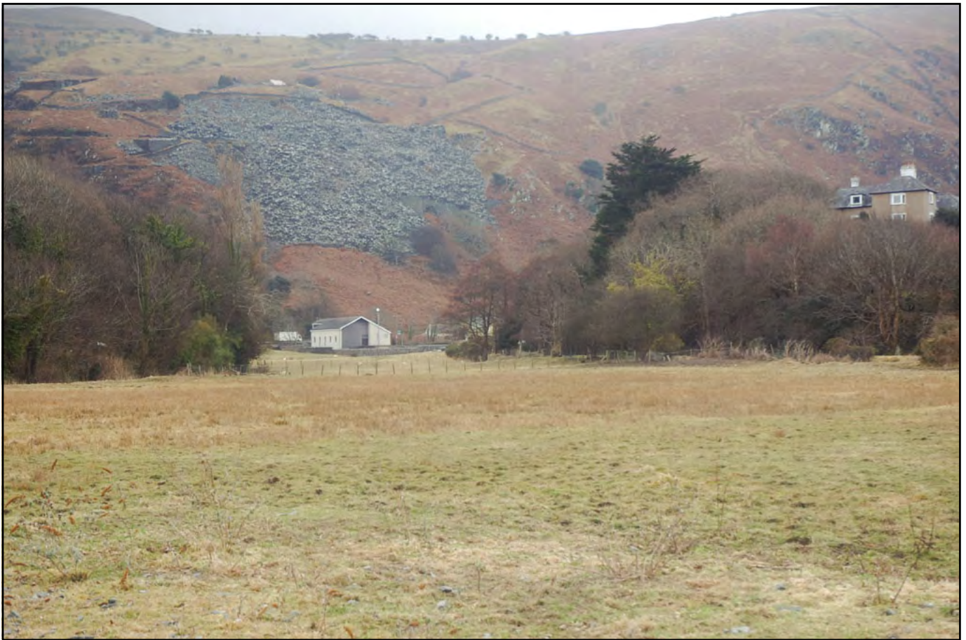
Plate 01 - General view of the location areas for TP01 to TP05: positioned along the flood plain from the building in the distance. The outcrop with the house is called Ynys y Bugail. Photo taken from the NW