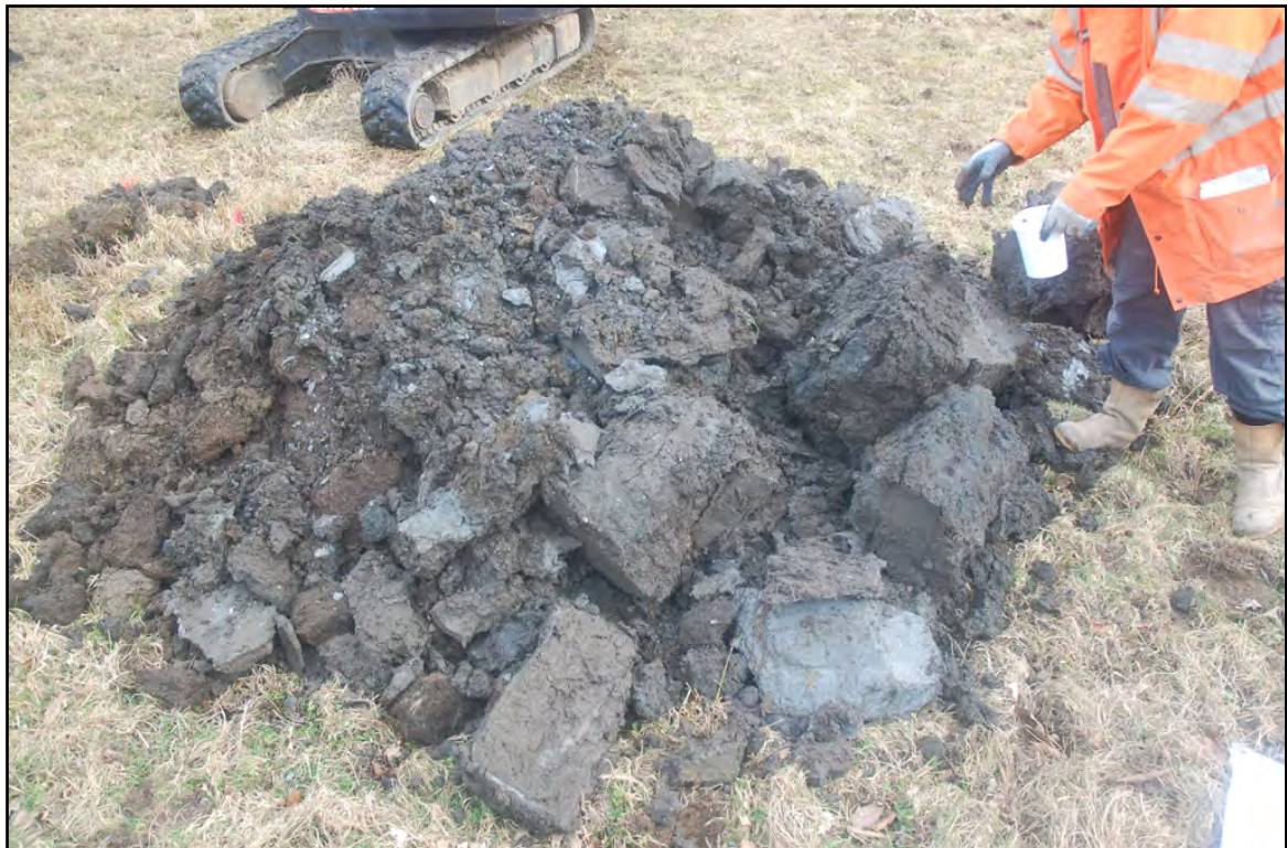
Plate 06 - test pit 05 spoil heap detailing upcast material, including the peat-rich organic deposits also identified in test pit 01 (located c.190.0m to the south).