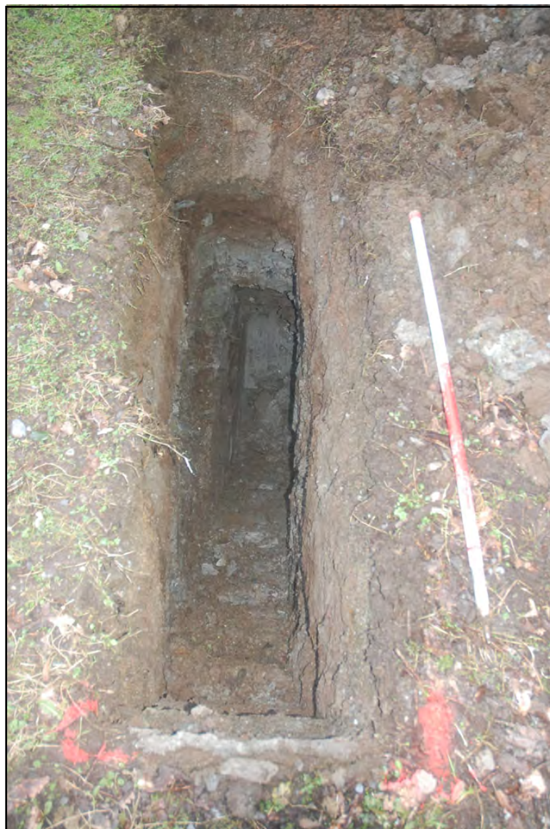
Plate 08 - test pit 04: detail of limit of excavation. The organic-rich deposits and the shale-rich deposit at the base of the test pit (3.00m below ground level), are visible