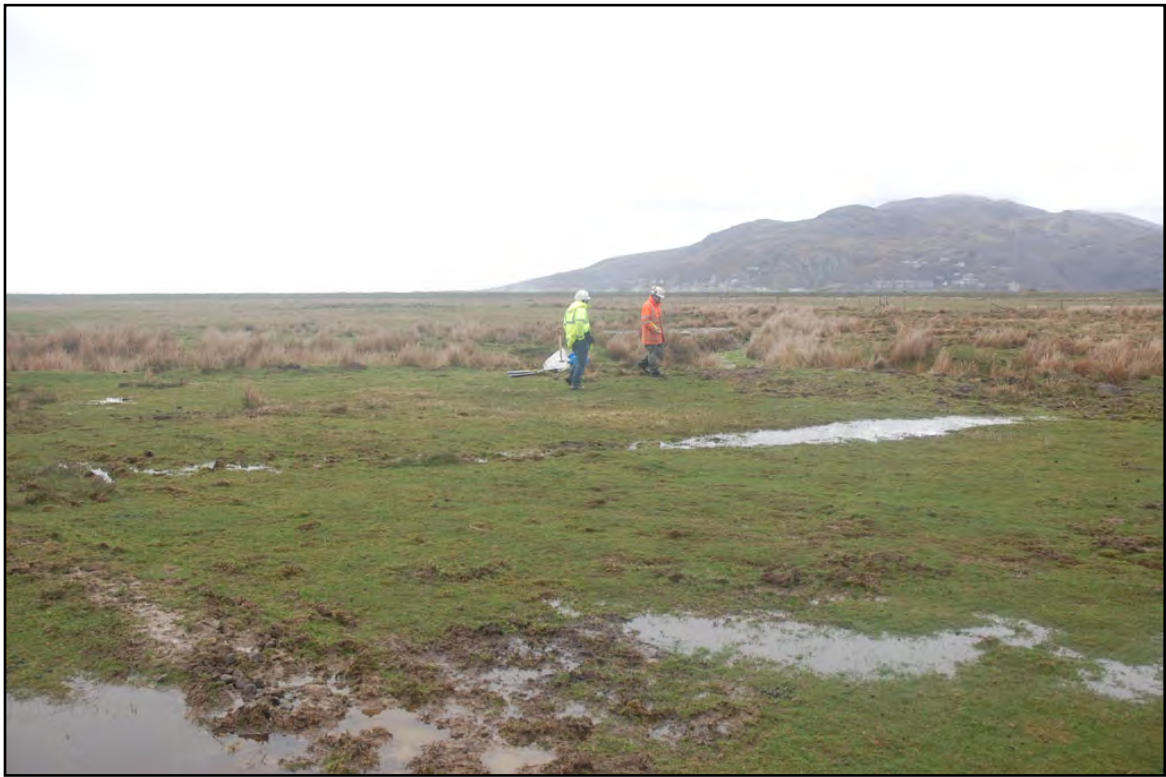
Plate 11 - location of test pit 19, located to the northeast of Fairbourne within the coastal floodplain