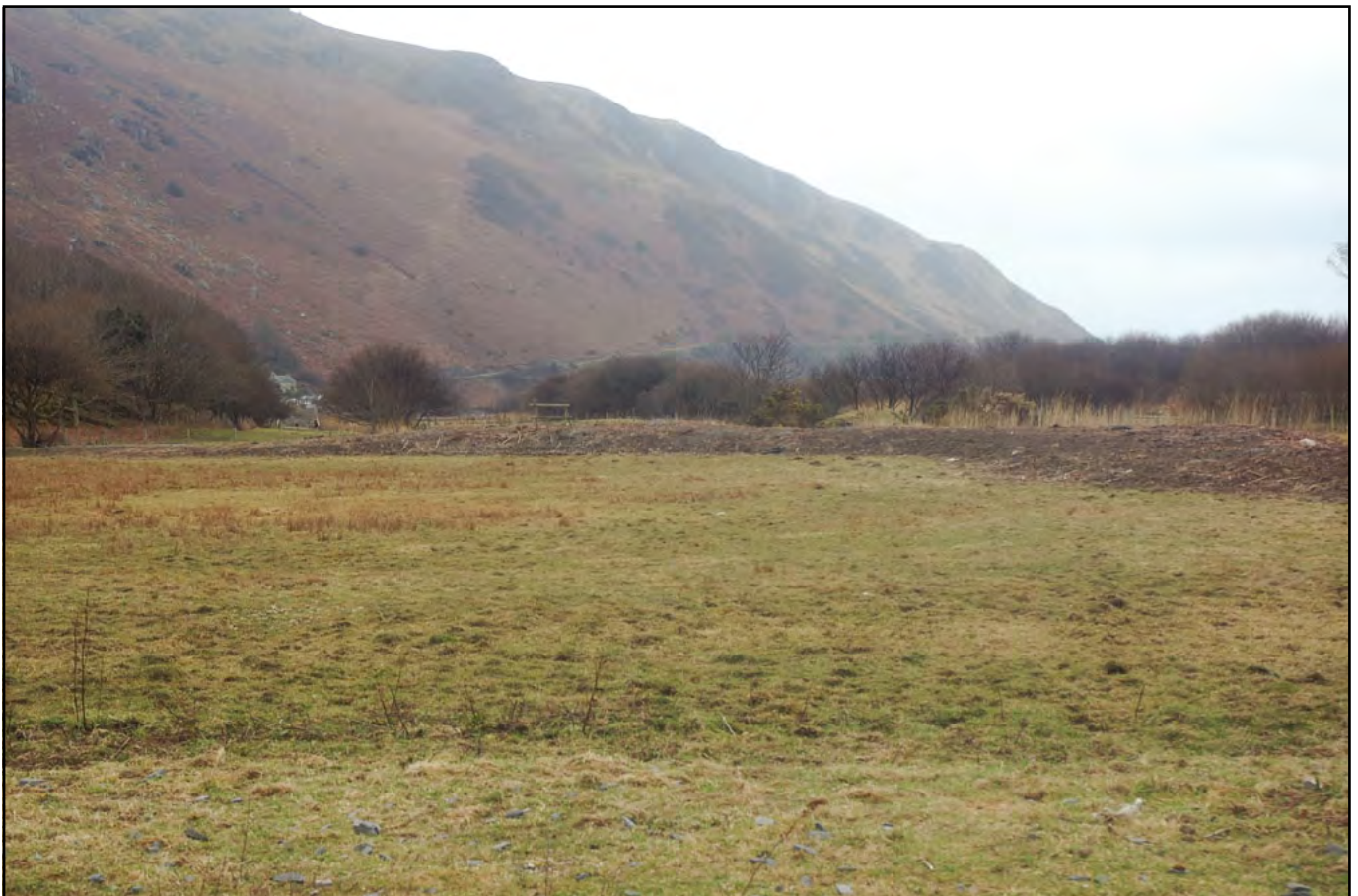
Plate 02 - General view of the location areas for TP06 to TP08, Ynys y Bugail can be seen to the left of the photo.