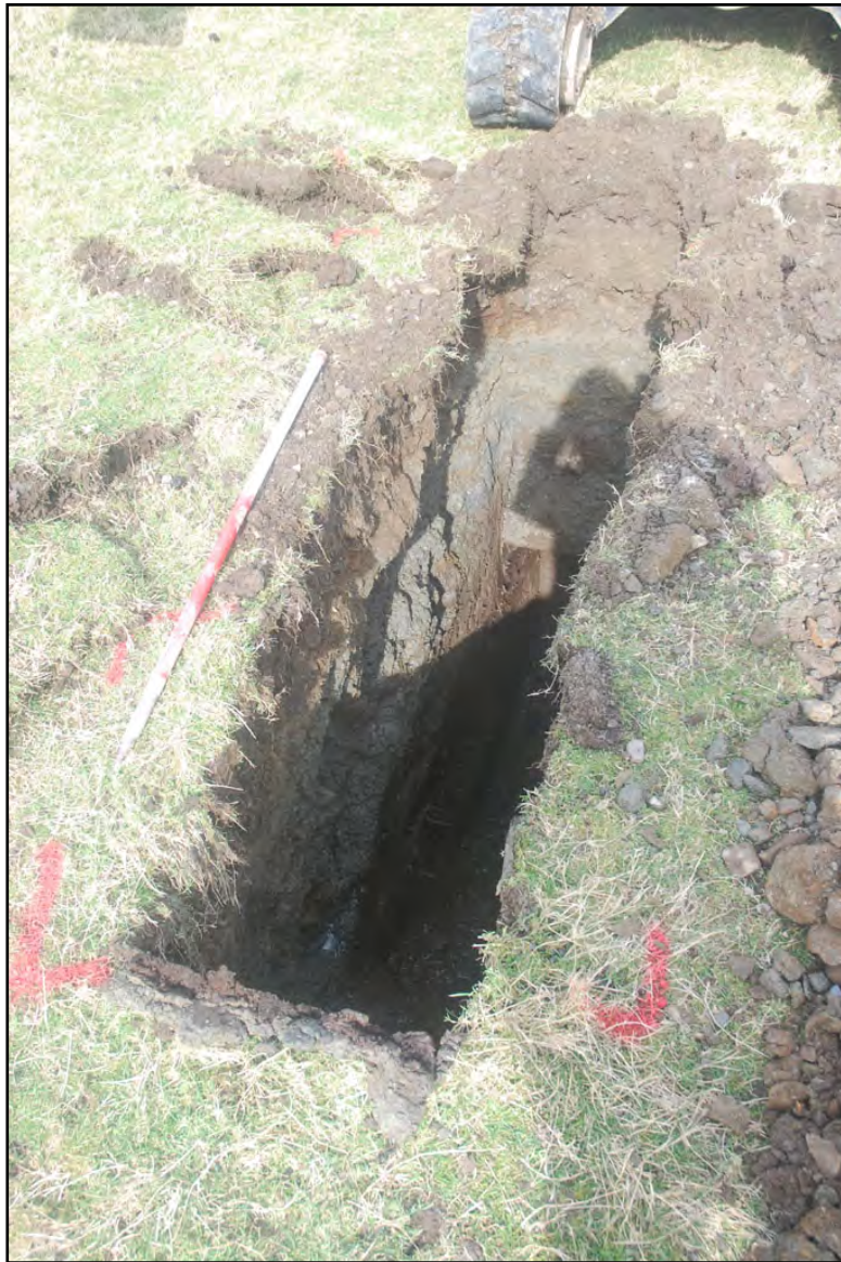
Plate 03 - test pit 01: exposed section on completion. A 0.40m thick layer of silt-sand, peat-rich with frequent organics was identified @1.00m below ground level