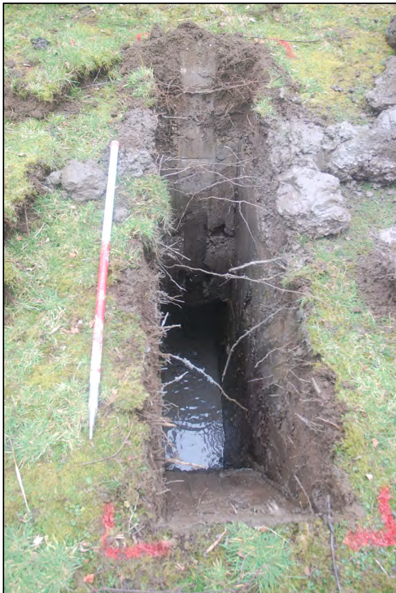
Plate 10 - test pit 10 on completion, detailing limit of excavation and water ingress @1.50m below ground level