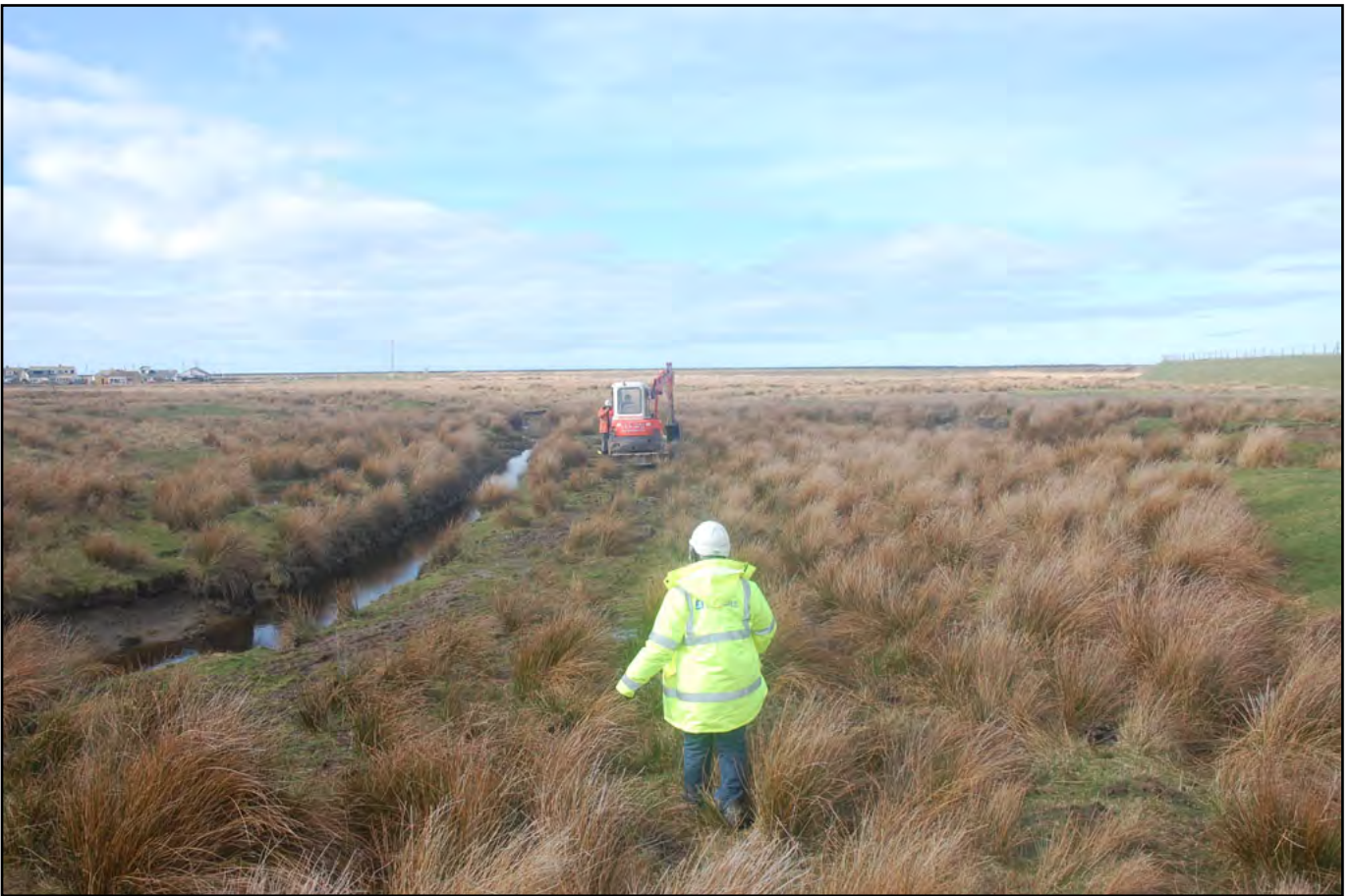
Plate 13 - location of test pit 22, positioned within the coastal flood plain to the northeast of Fairbourne. Test pit 22 was the final test pit excavated as part of the GI programme.