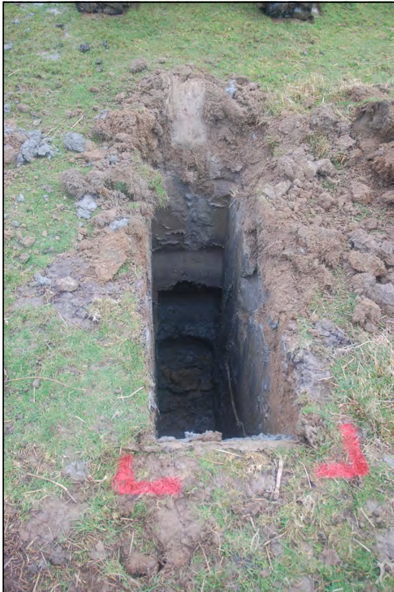
Plate 12 - test pit 19 at limit of excavation, detailing a succession of sand-rich layers. No archaeological activity was identified within the confines of the test pit