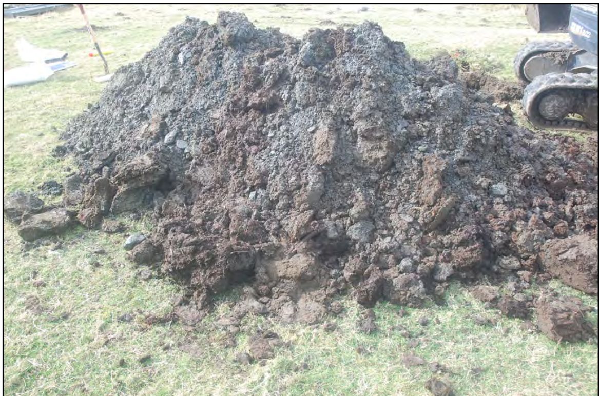
Plate 04 - deposit located beneath the peat-rich layer that continued to limit of excavation (3.00m below ground level)