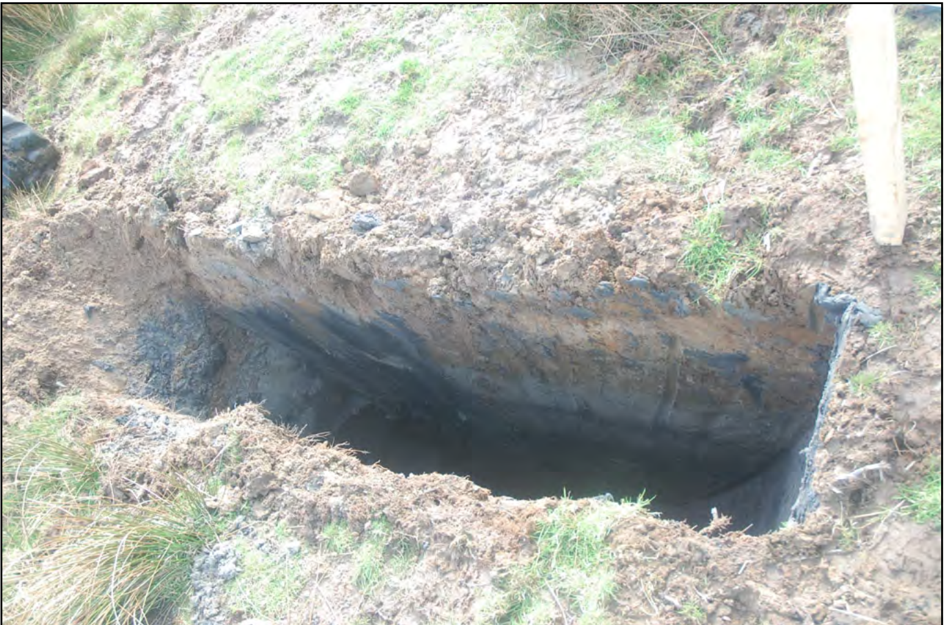
Plat□ within the confines of the test pit