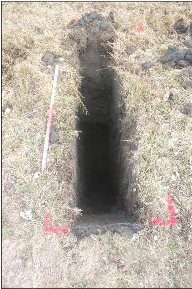
Plate 05 - test pit 05 post-excitation, Similar to test pit 01, peat-rich organic deposits were identified @0.55m below ground level, continuing towards the limit of excavation where the deposit became clay-rich