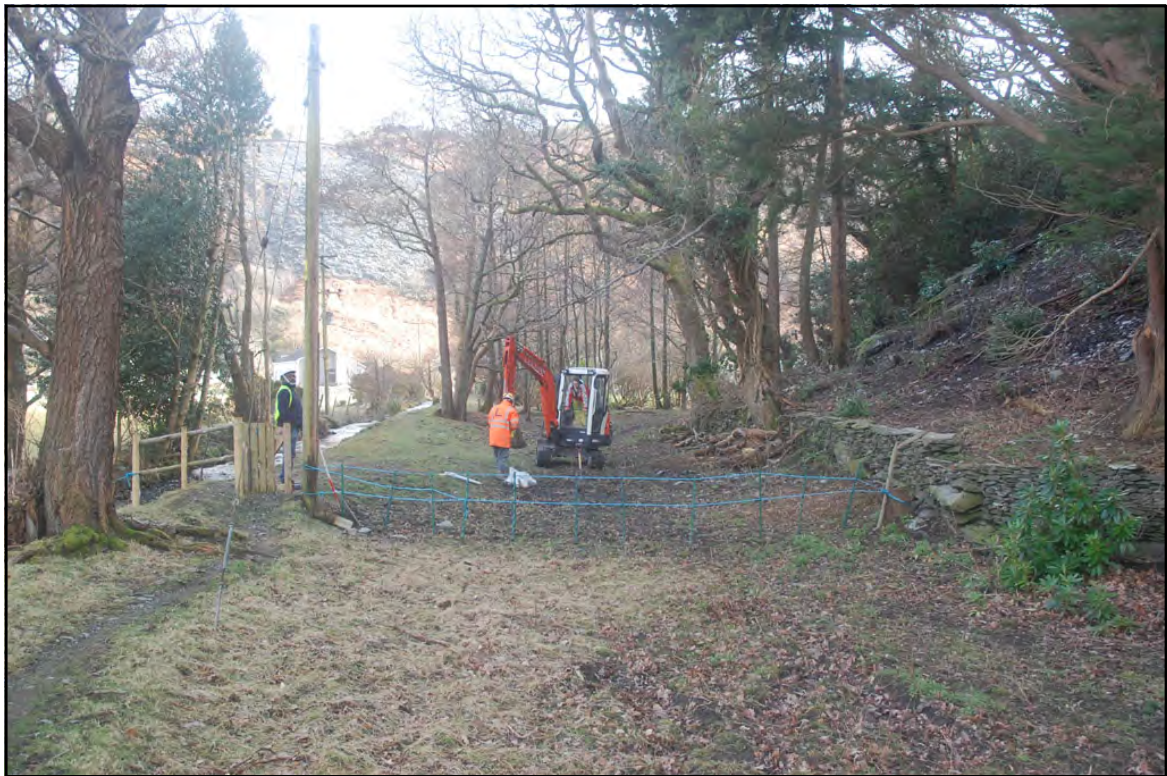
Plate 07 - location of test pit 04. The test pit included organic-rich deposits and shale fragments at the limit of excavation