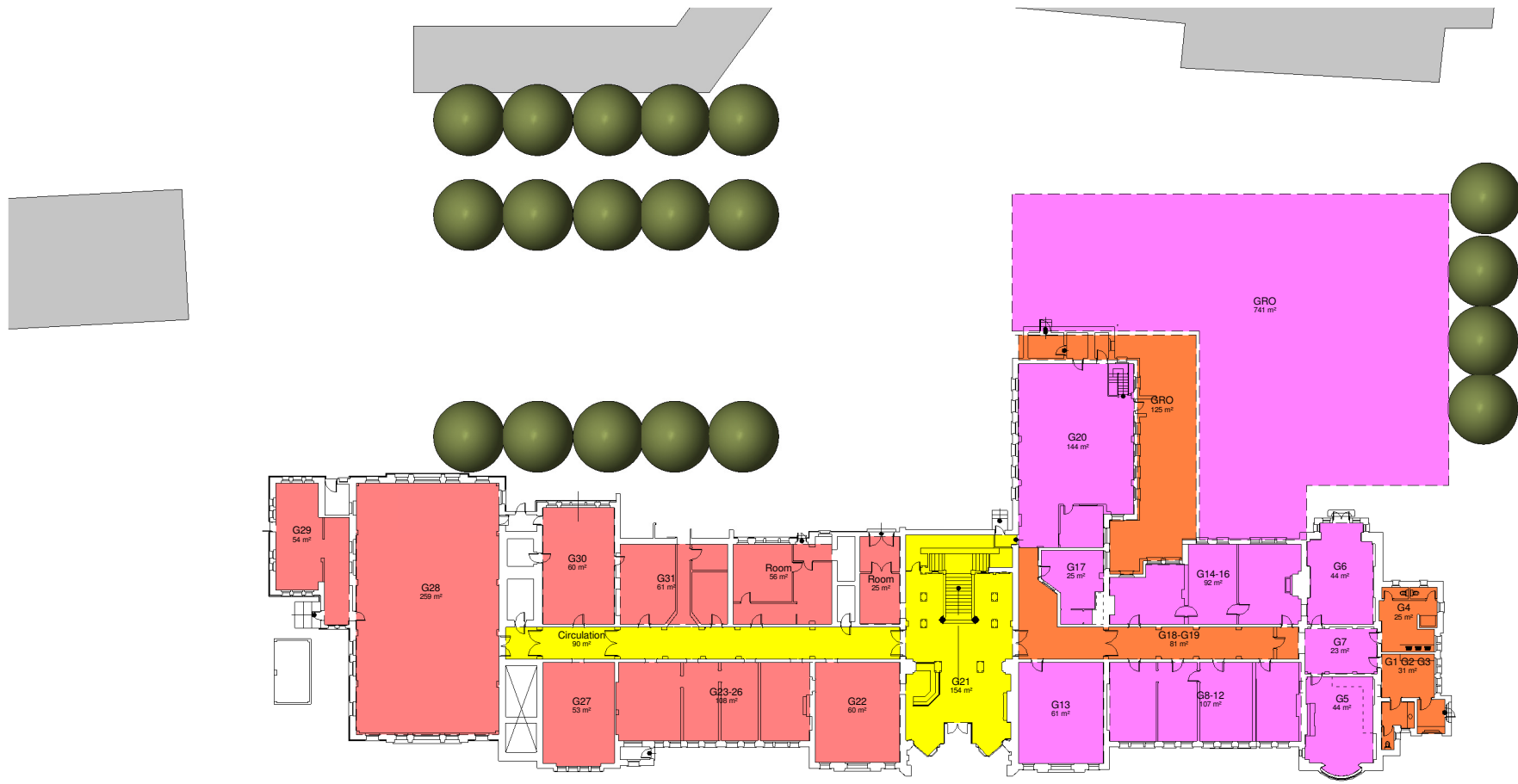
1 Ground Floor 1 : 250