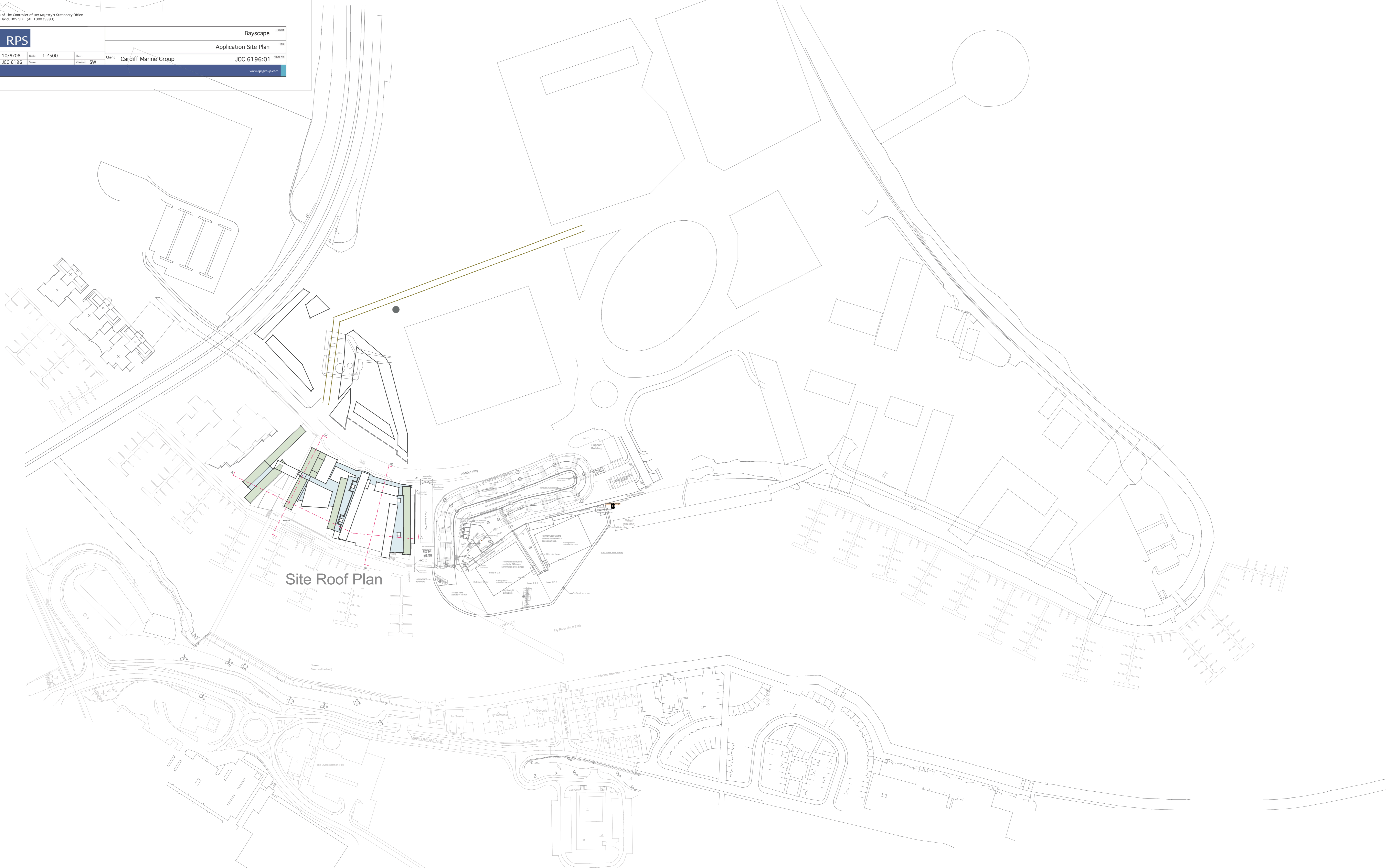
Site Roof Plan