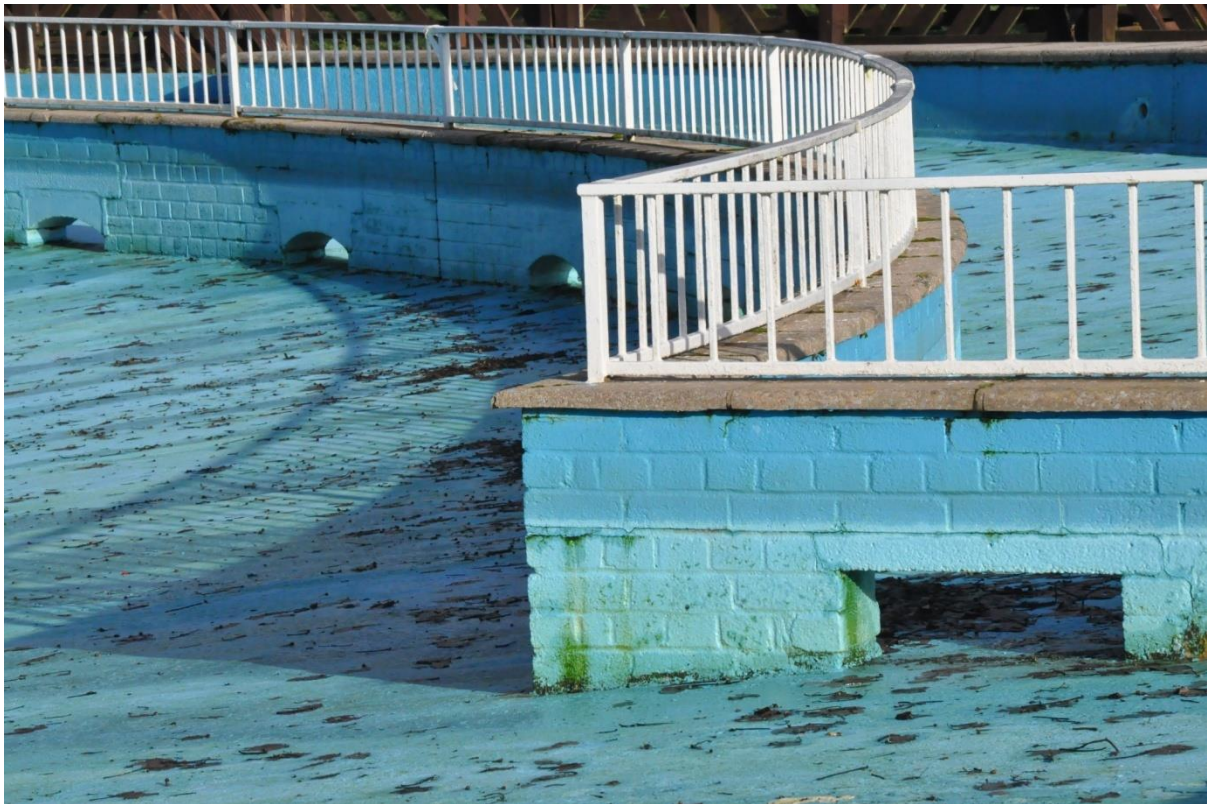
Image 7 - A more detailed view of the internal brick built wall, which segregates the toddler area, from older users of the paddling pool.