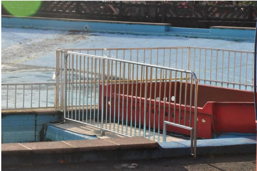
Image 6 - A close up view of the modern spiral water flume's, catch pool, showing the exit point, for users.