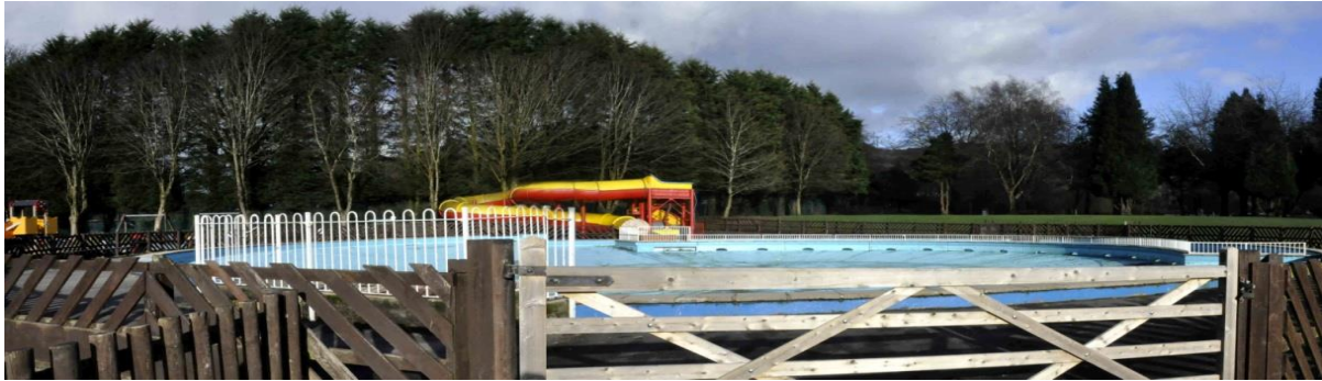
Image 3 - A general view from the south (lido side), showing the paddling pool with the modern spiral water flume in the background, along with gate and perimeter fencing in the foreground .