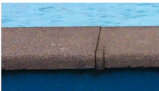
Image 5 - A close up view of the dwarf concrete wall, topped with coping, which forms the pool circumference.