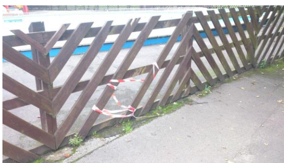
Image 2 - A close up view of the perimeter fencing, surrounding the circumference of the paddling pool.