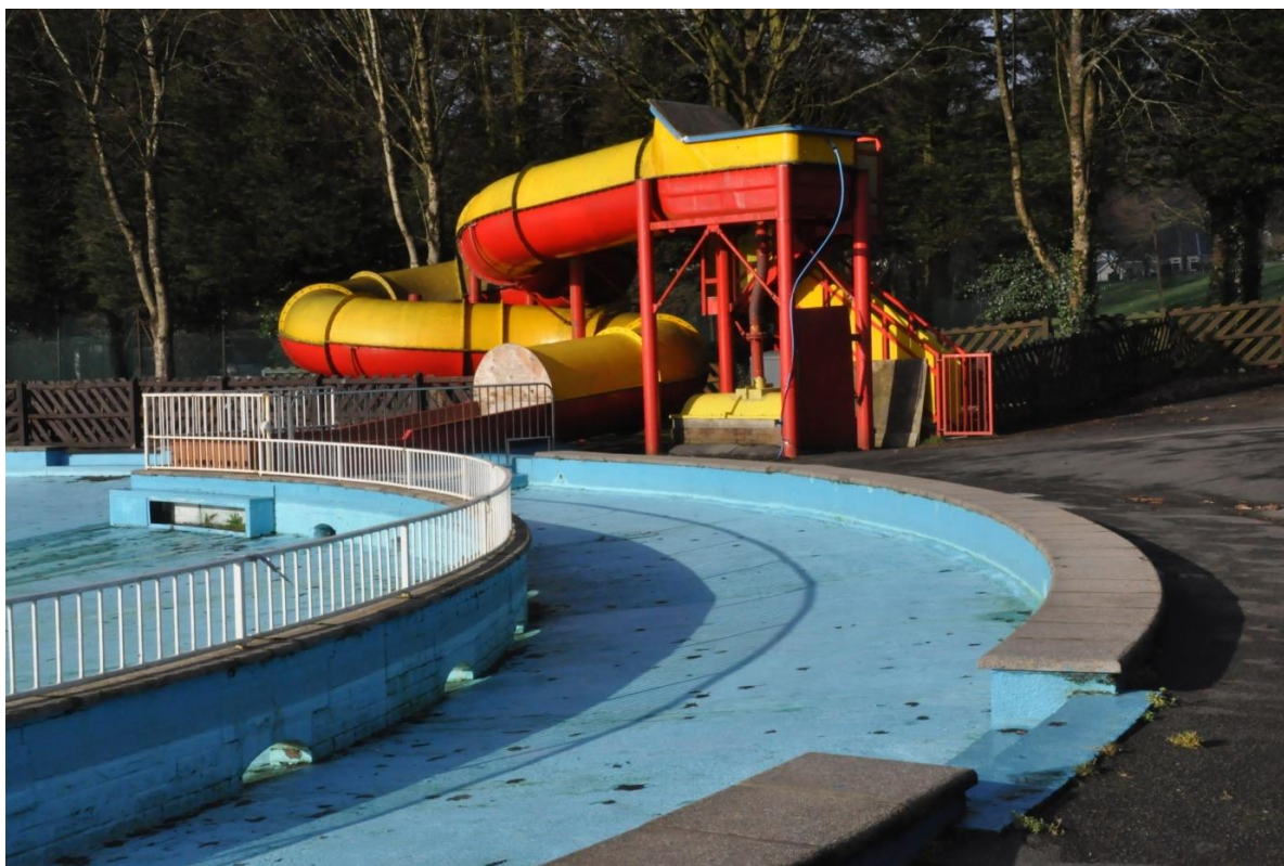
Image 4 - A view showing the detail of the dwarf concrete wall, topped with coping, constructed around the circumference of paddling pool. This view also shows a more detailed view of the spiral water flume, with its catch pool to the north east of the site. The brick built, internal wall, topped with metal railings, segregates an area for toddlers, from other older users, up to the age of 12 years old. Also shown are the steps on the east side, one of four entry points for paddlers, there are identical sets of steps on the north, south & west sides of the pool.