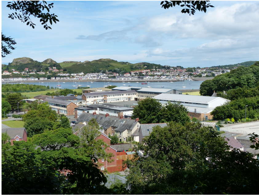
Aberconwy Secondary Modern School later Ysgol Aberconwy