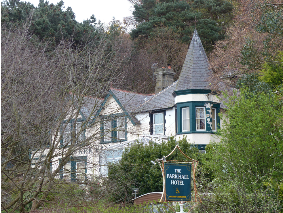
Gorphwysfa/St.Philip's Preparatory School

1911 Conway Trade Directory-advertisement p.216