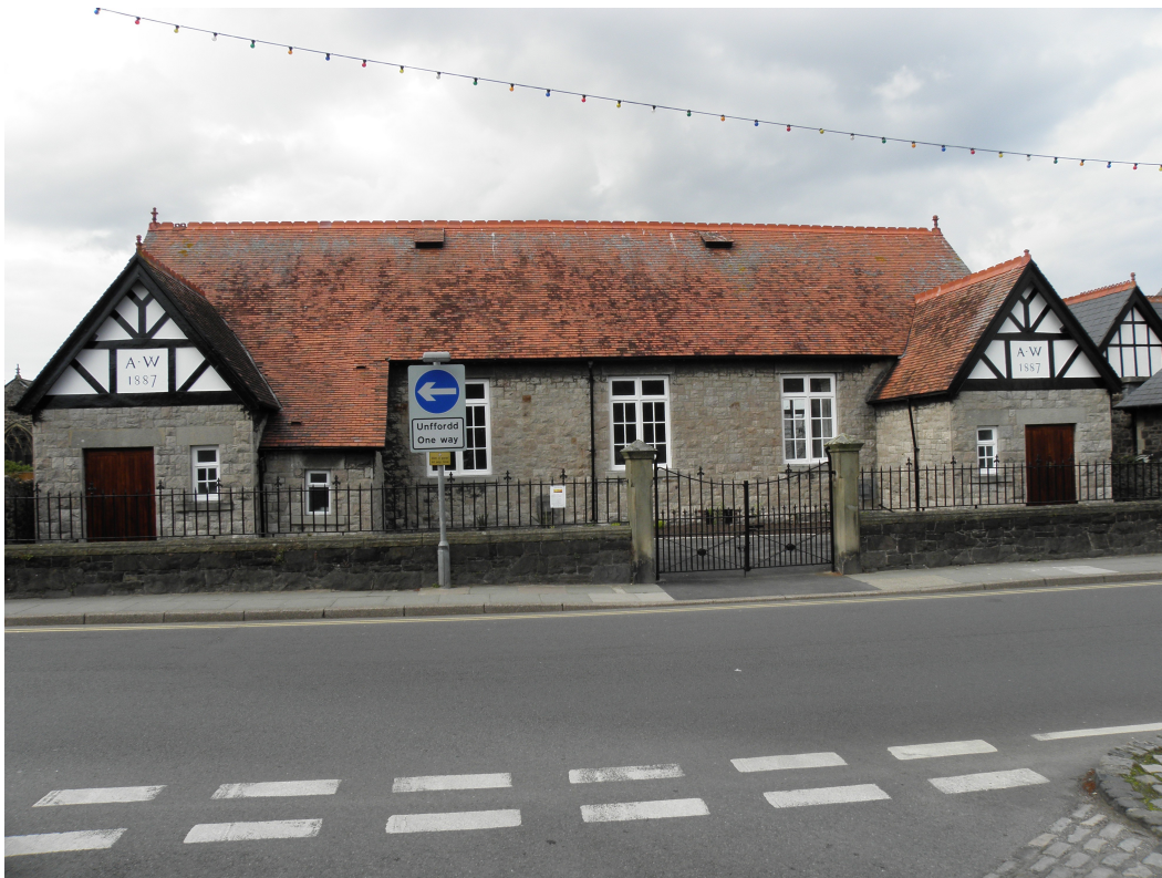
The National Boys School