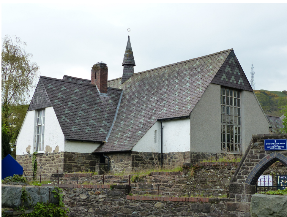
Gyffin Community Centre

Although much needed repairs were carried out by Conwy Borough Council, the building was not used in 2013.