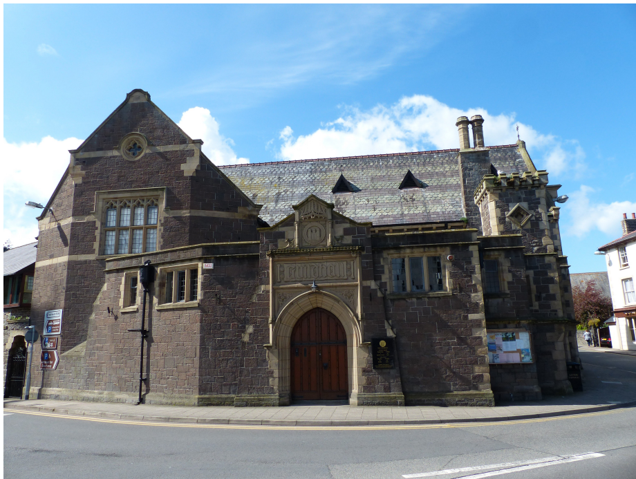
The Town Hall later the Guildhall