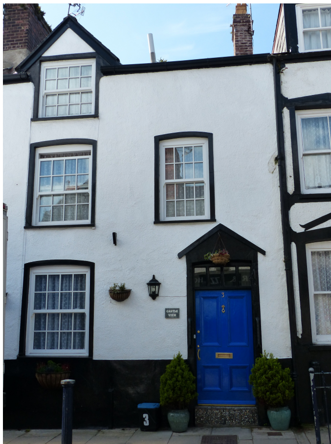
3 Berry Street