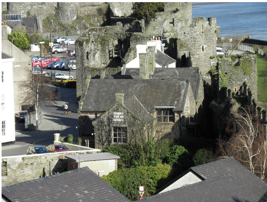
The National School – now the Conwy Visitor Centre