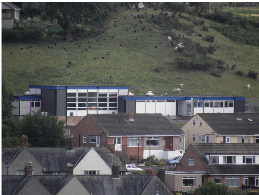
The new Gyffin Infants School, Maes-y-Llan