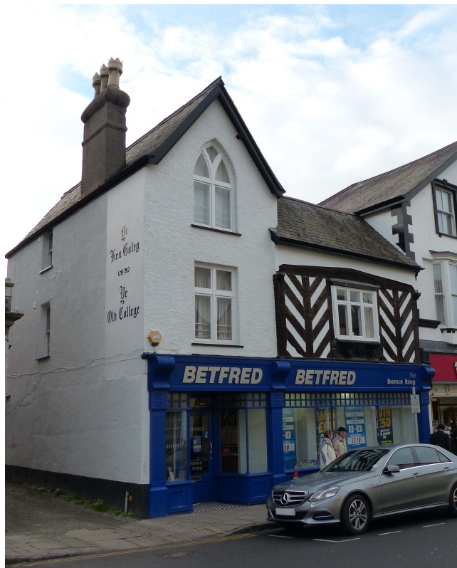
The Old College, Castle Street

Could this school have been held in the 'Old College' (no.20 Castle Street)? No verification of this has been found but nobody seems to know exactly how the building got its name. It has been rebuilt/re-modelled so much over the centuries that it has been dated by different authorities as being from the 13 th century to the 16 th century with much modification at later dates. The only known connection with education appears to be its name.