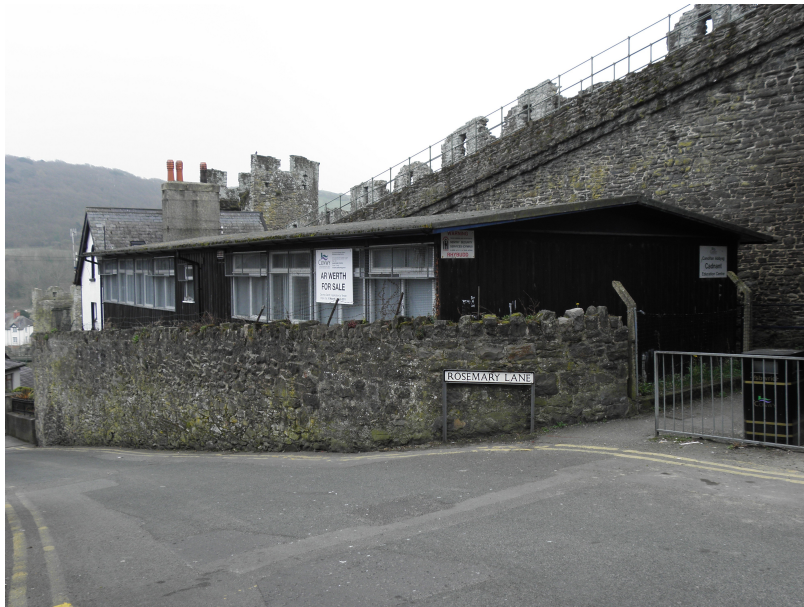
The Education Centre in Rosemary Lane

The Education Centre was set up to provide off-site provision for twelve pupils who have experienced social or emotional difficulties in mainstream primary schools with an additional ten places for students who have experienced difficulties in attending primary schools or in the transition to secondary school. It was originally sited in Rosemary Lane just inside the town walls but when the pupils in the Gyffin School in Maes-y-Llan were transferred to the new Port-y-Felin School the Centre moved into the vacant building.